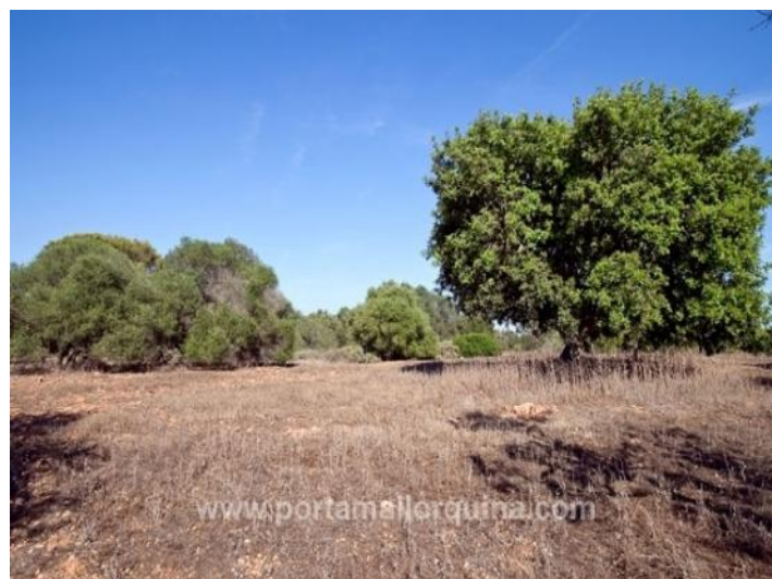
View over the plot