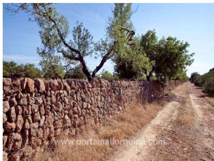
Access of the property