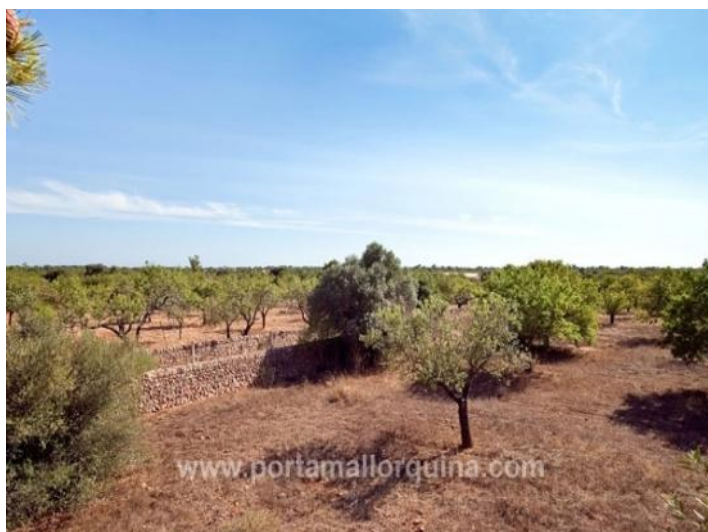
The plot is situated in a typical Majorca rural area