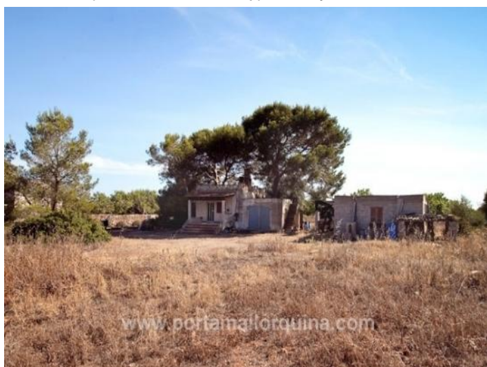
Alternative view over the plot