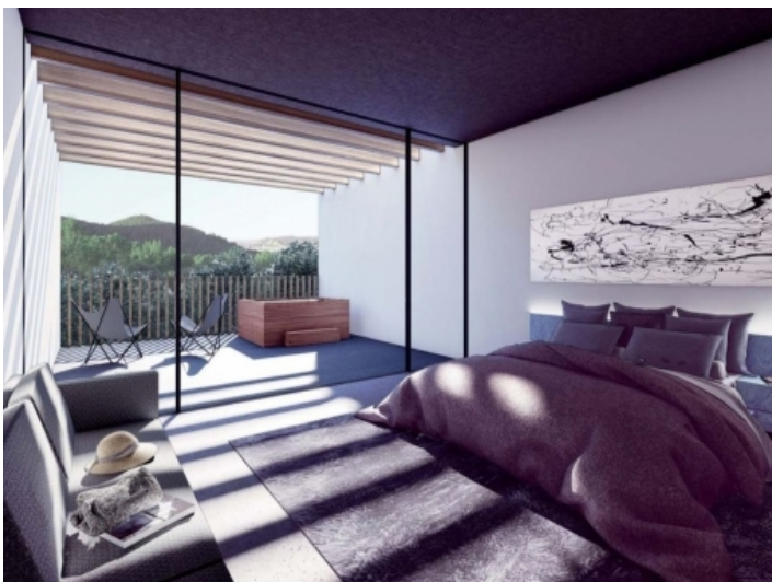
Panoramic windows of the villa