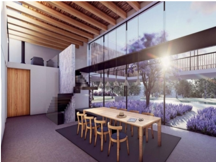
Light flooded dining and living area