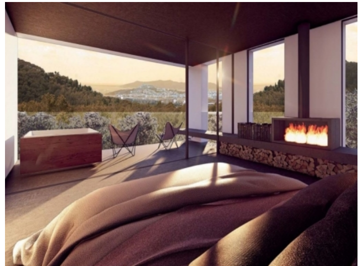
Bedroom with views to Dalt Vila