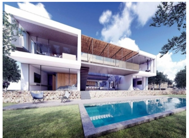
Exterior view with pool