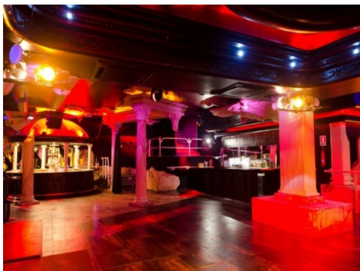
View of the dance floor