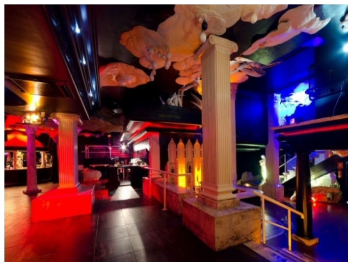
Alternative view of the dance floor