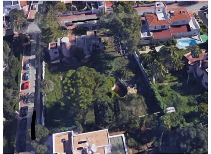
The plot from a birds-eye view