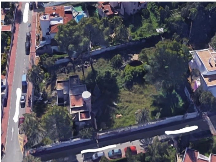
The plot from a birds-eye view