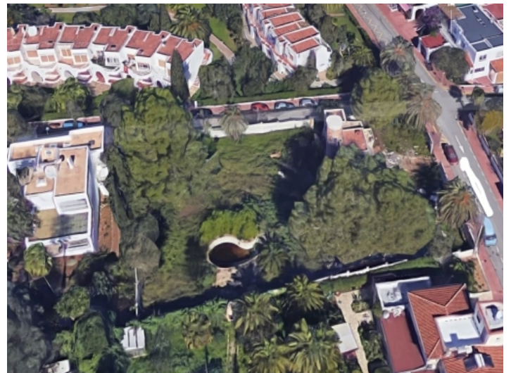
The plot from a birds-eye view