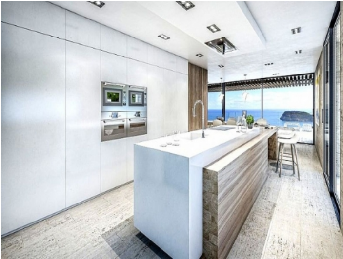
High quality kitchen