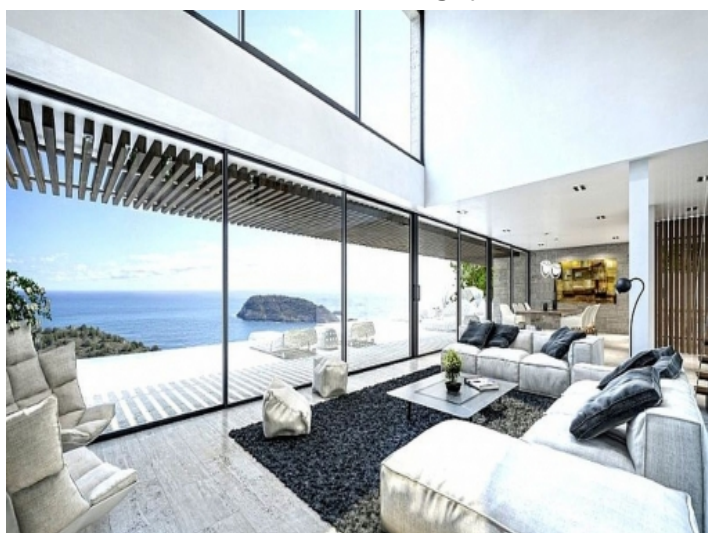
Living area with panorama sea views