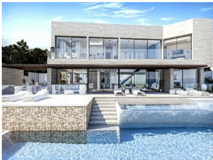
Exterior view with large pool