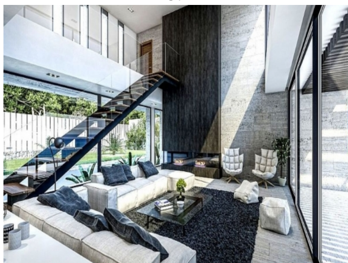
Living area with high ceiling and gallery