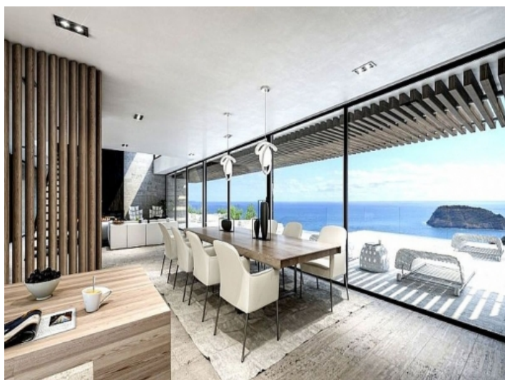
Impressive dining area