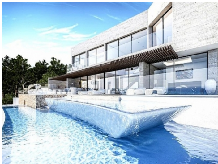
Stunning pool area