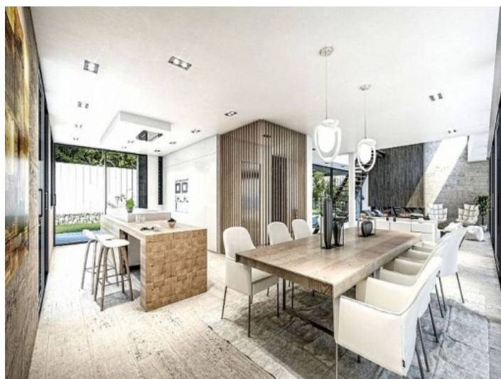
Open plan living and dining area