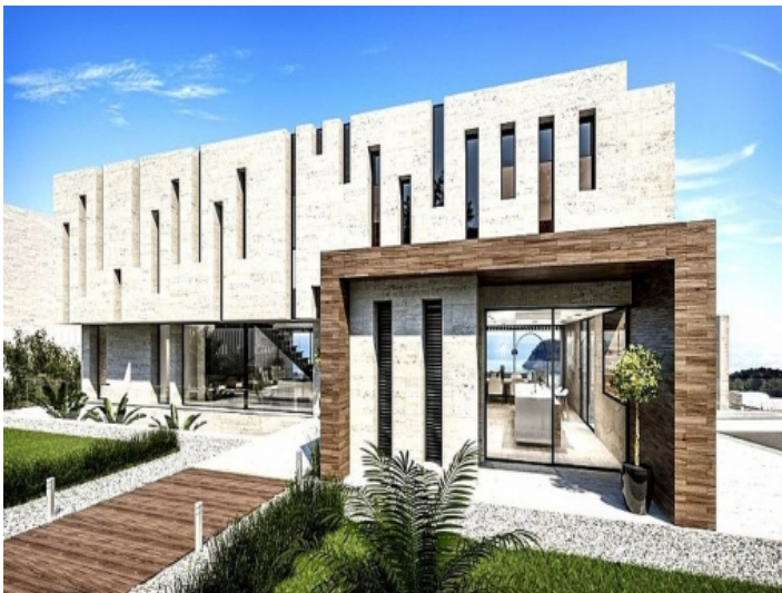
Front view of the villa