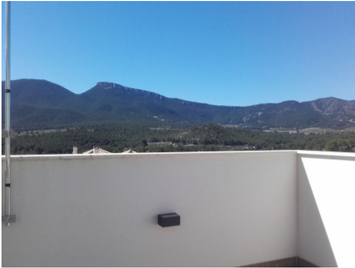
Mountain view from the rooftop terrace