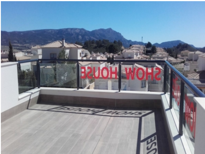
Terrace on the upper floor