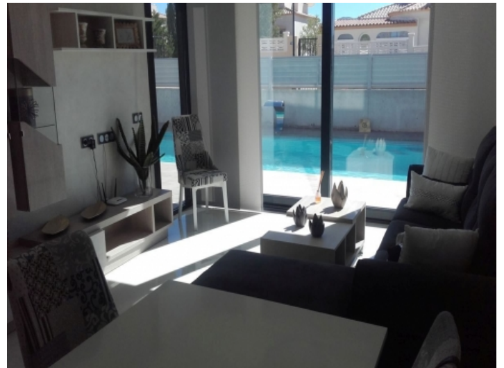
Living area with terrace access