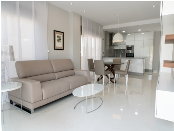
Living area with dining area