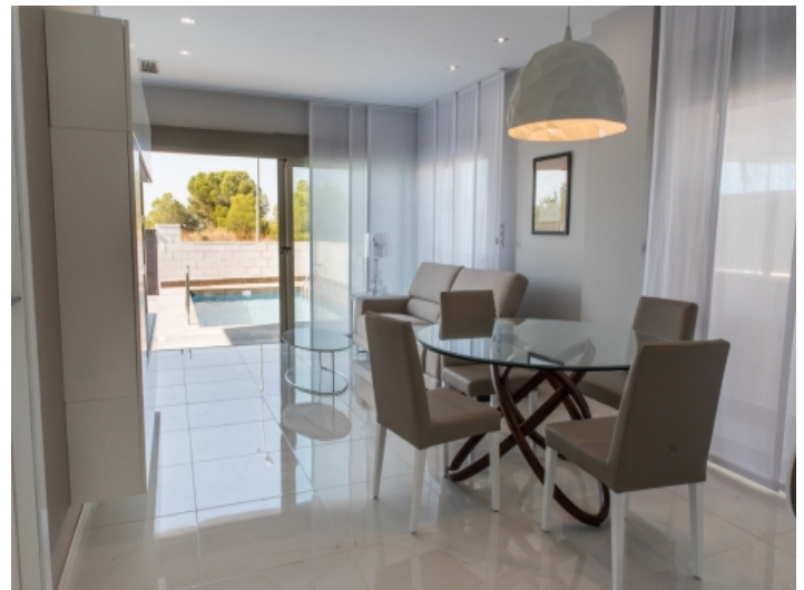
Garden view from the living-/dining area