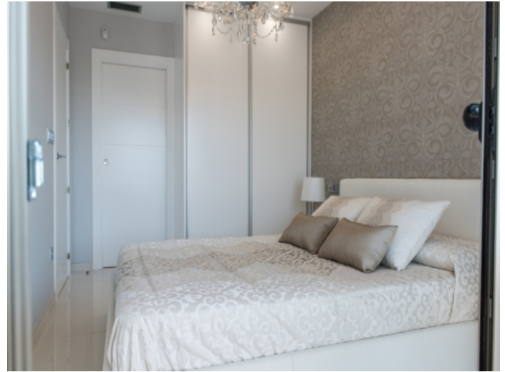
Additional bedroom with bathroom en suite