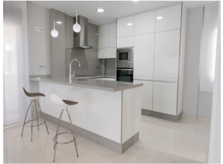
Modern kitchen with white fronts