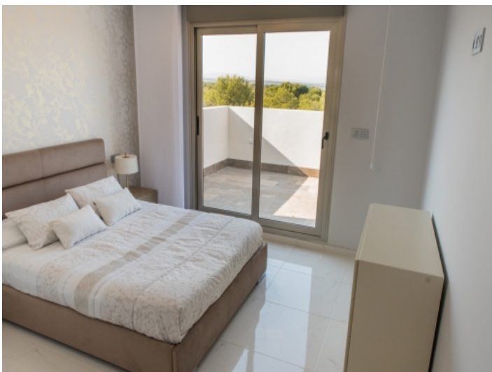
Bedroom with access to the roof terrace