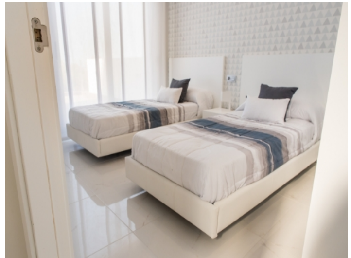
Bright bedroom with two single beds