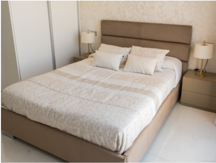
Bedroom with double bed