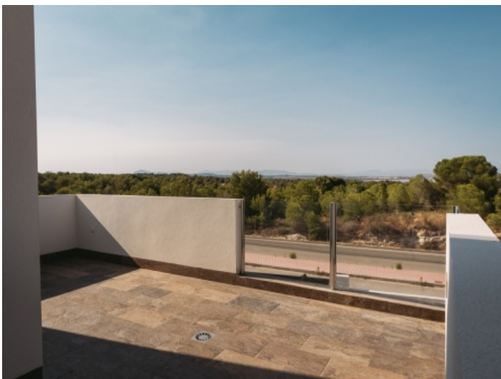
Terrace with panoramic views