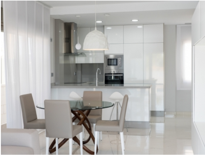
Dining area mit bordering kitchen