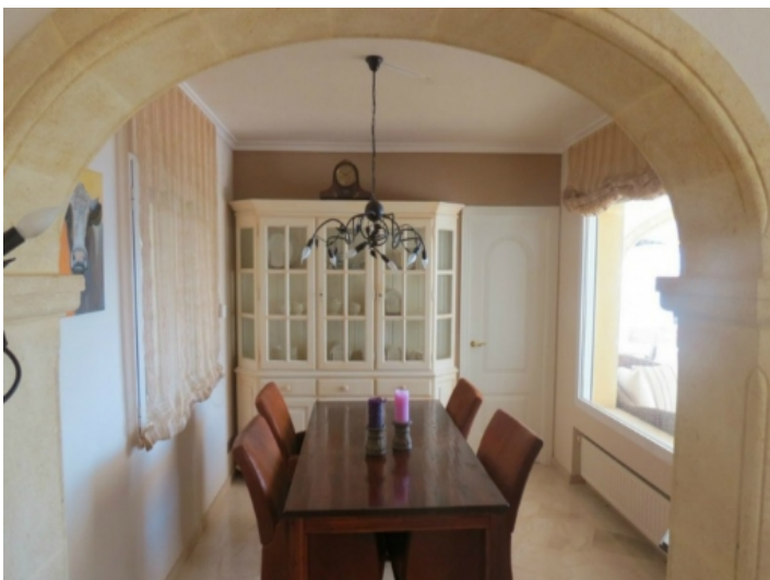
Lightflooded dining room