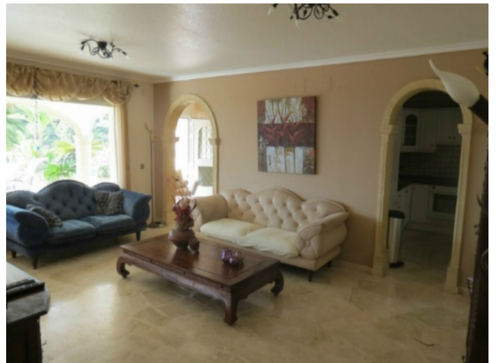
Large living room