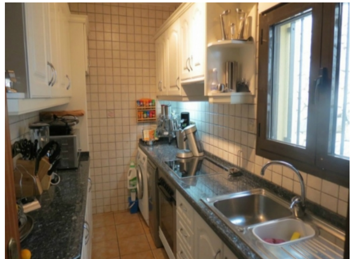
Second fully equipped kitchen