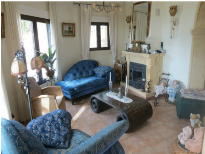
Spacious living room