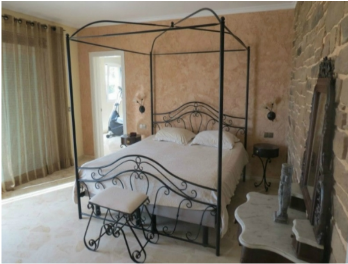
Bedroom with stone wall