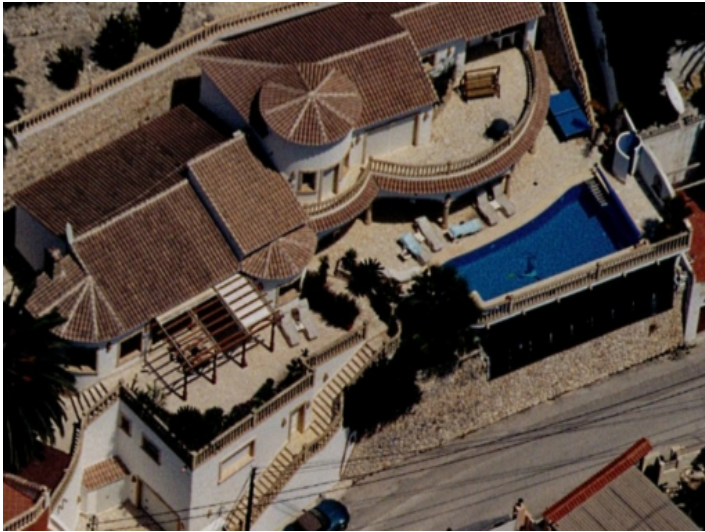
Birds eye view