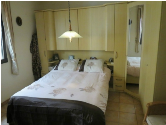
Bedroom with lots of storage space