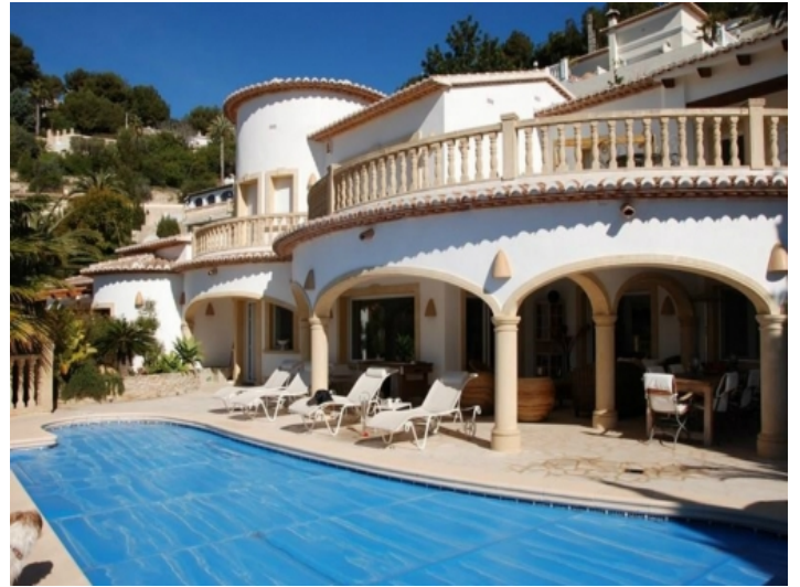
Representative villa with pool