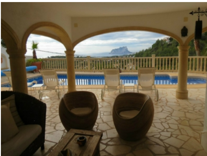
Pool with stunning sea view