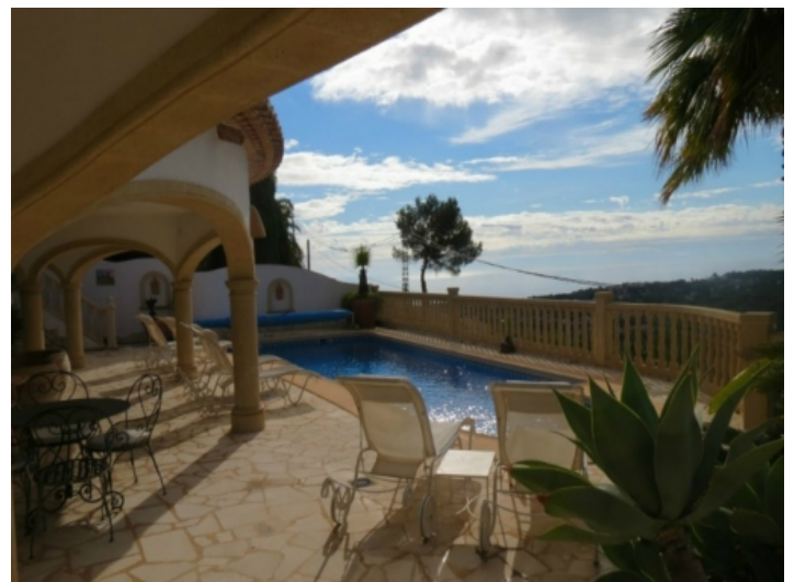
Amazing sea view from pool area