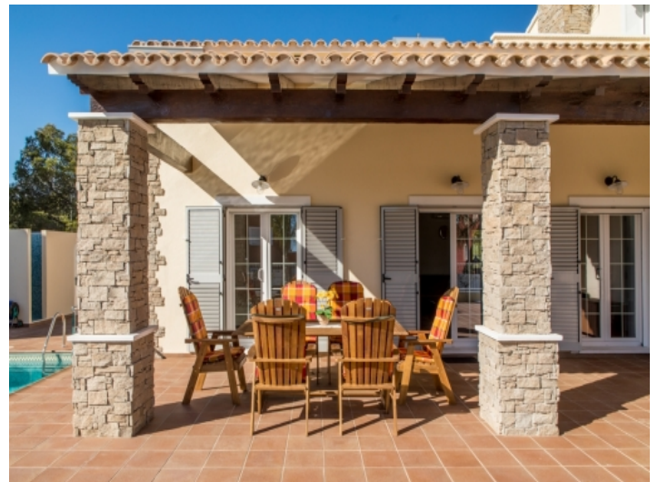
Cozy terrace seating area