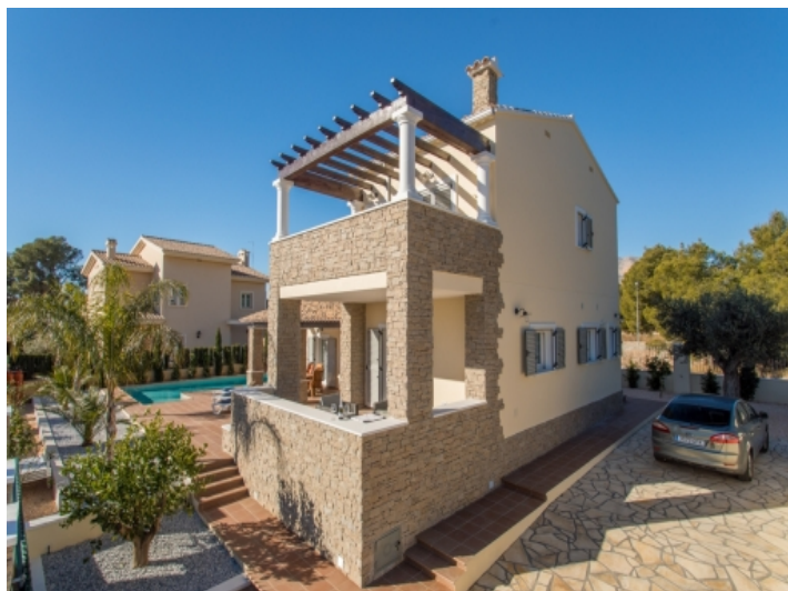
Rear view of the villa