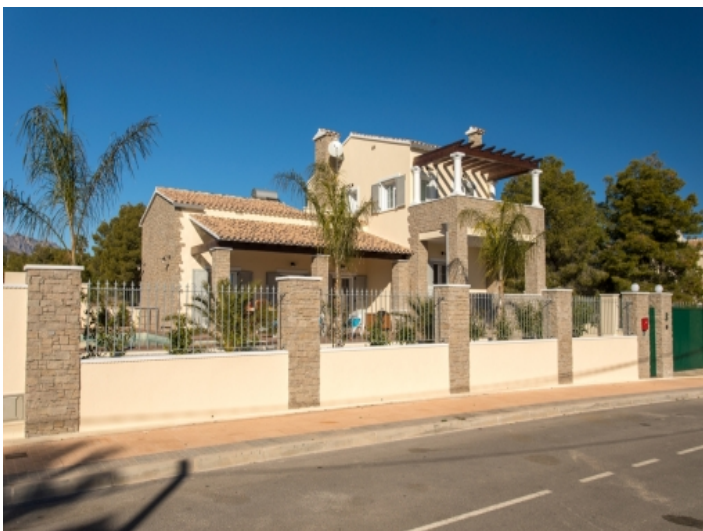
Front view of the property