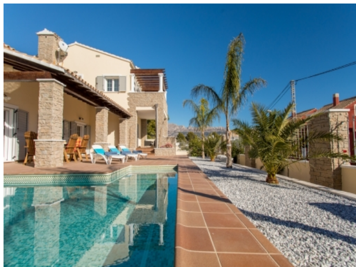
View from the pool area