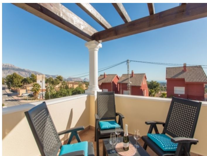
Balcony with sea view