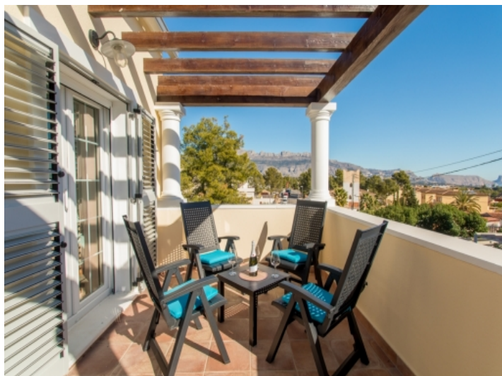
Balcony with sea view from another perspective