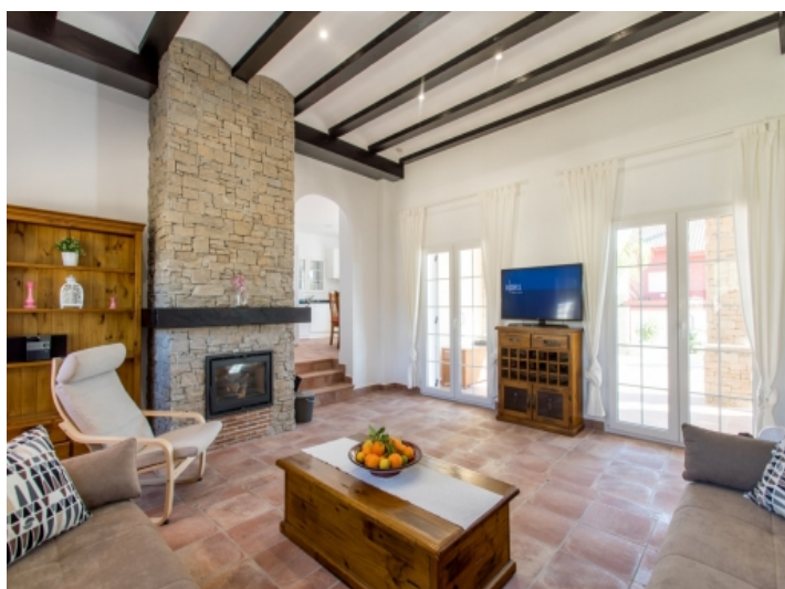
Cozy living room