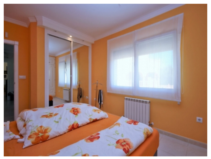
Bedroom from another angle