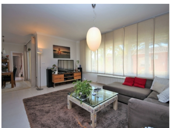
Cozy living room