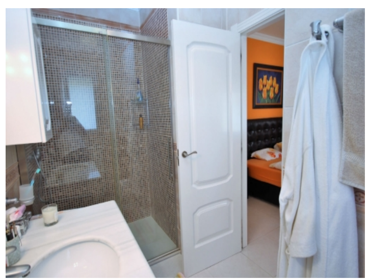
Bathroom on suite