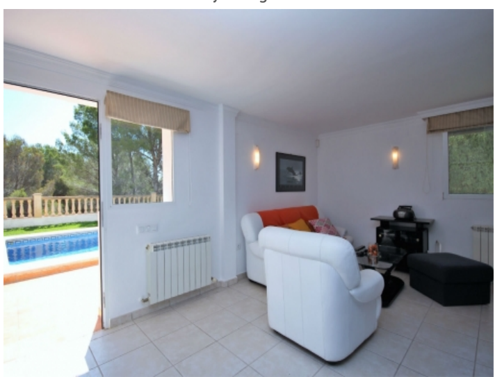
Separated living room next to the pool