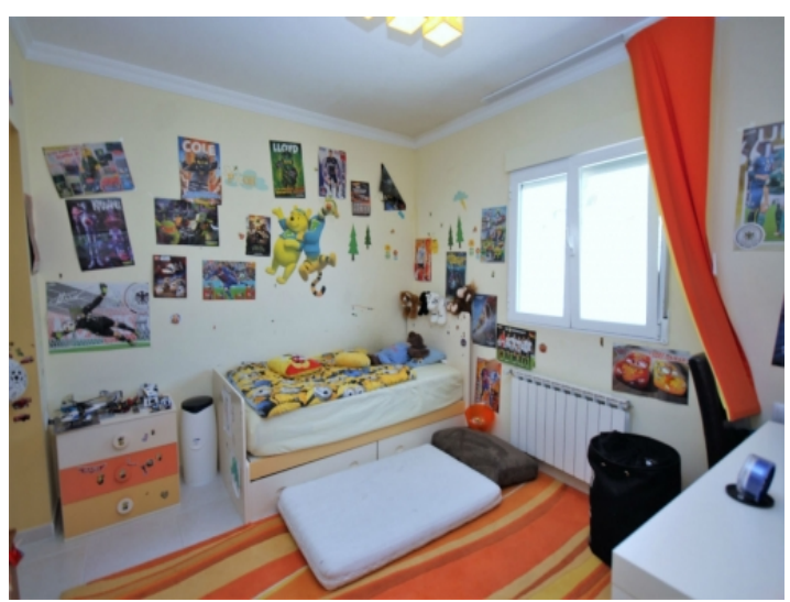
Spacious children's room