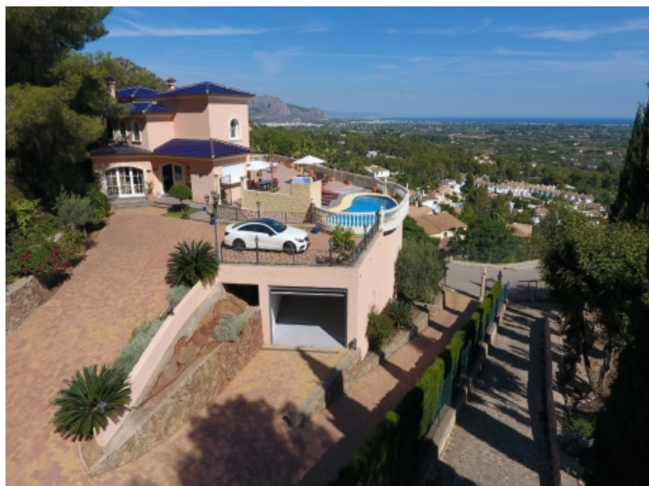
Bird's eye view of the entrance