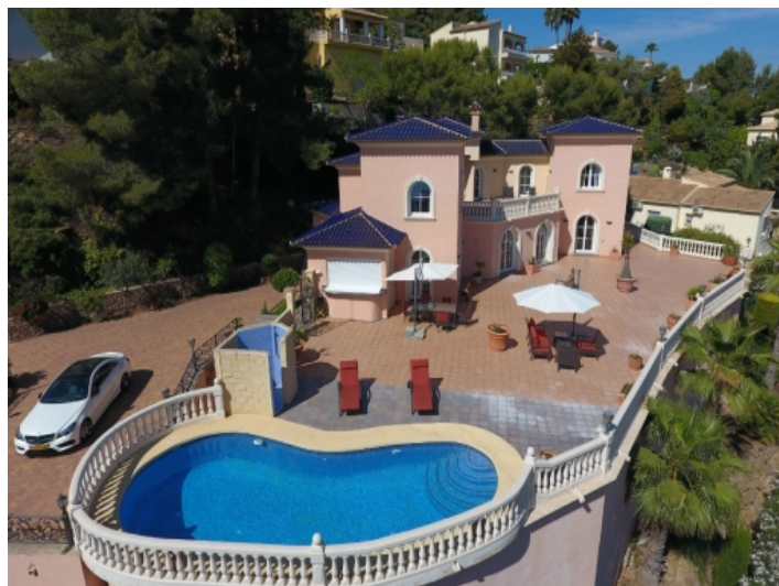
Bird's eye of rear side