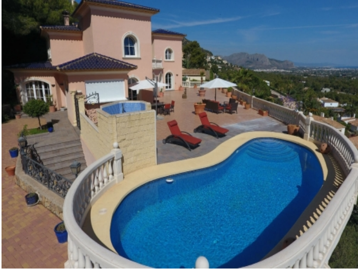
Large outside area