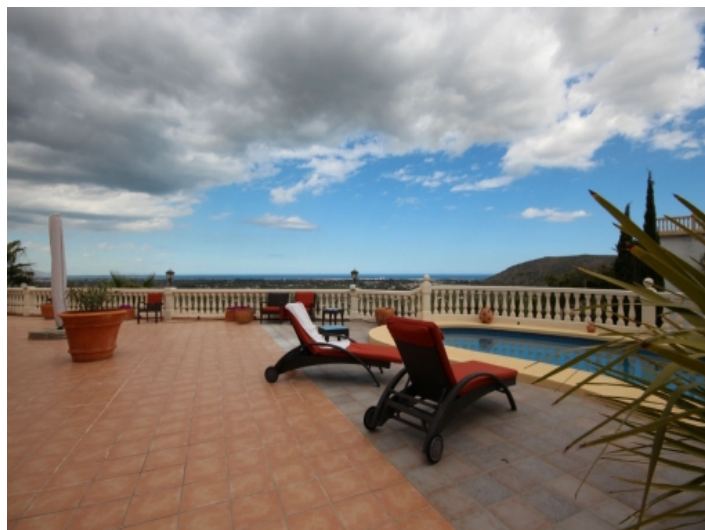
Panoramic view from the pool area