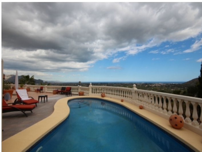
Panoramic sea view