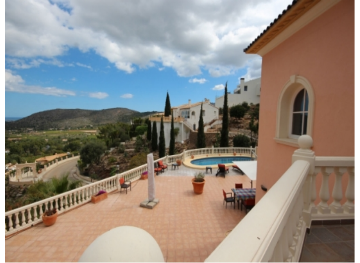
View from the separated terrace