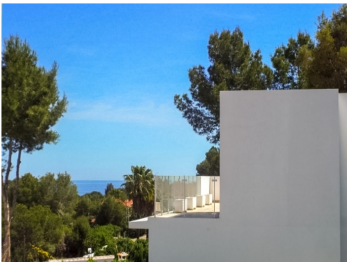
Sidely sea views