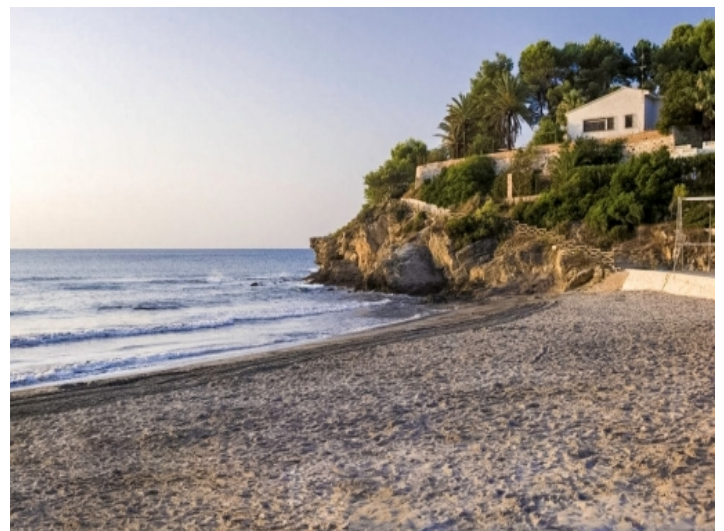
Close-by beach La Fustera