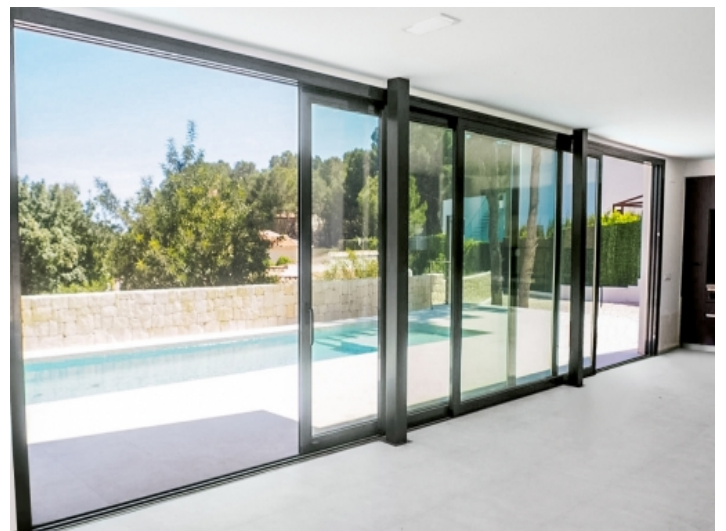
Light-flooded living area