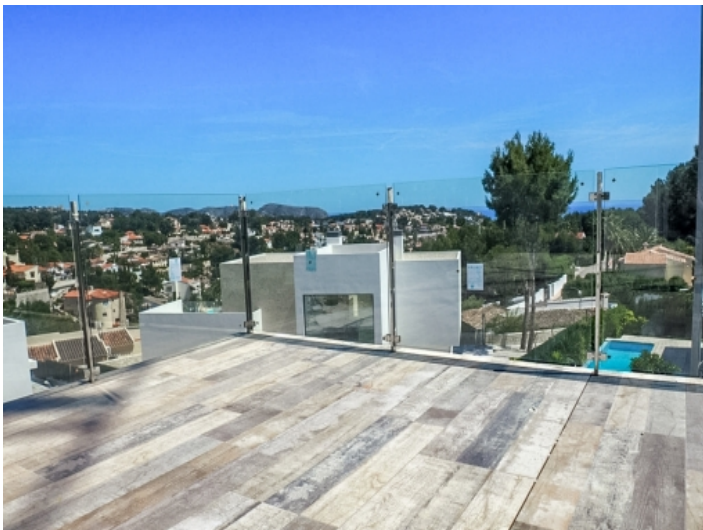
Stylish roof top terrace