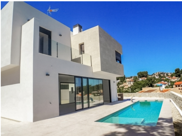
Terrace with pool and stunning views