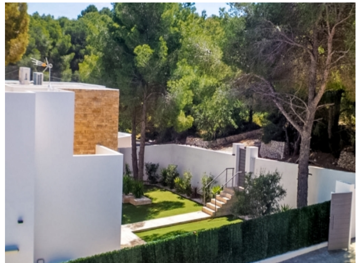
Well-tended entrance area