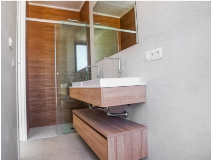
Bathroom with daylight and rain shower