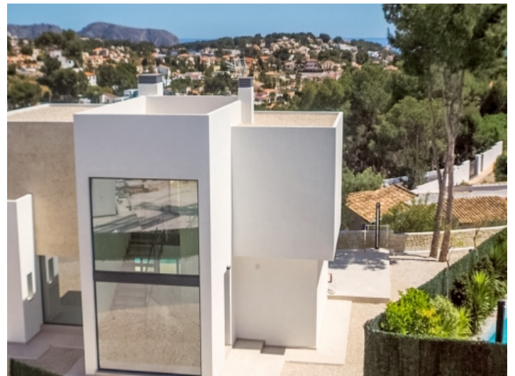
Beautiful views of Benissa and surroundings