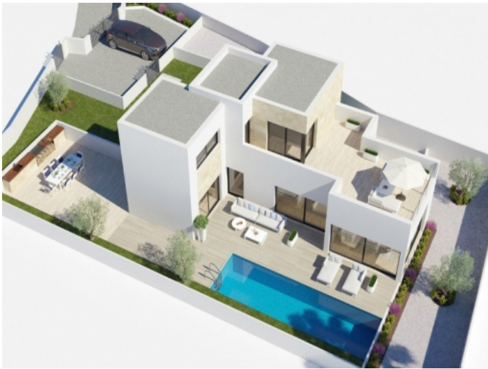
Exterior view of the spacious estate