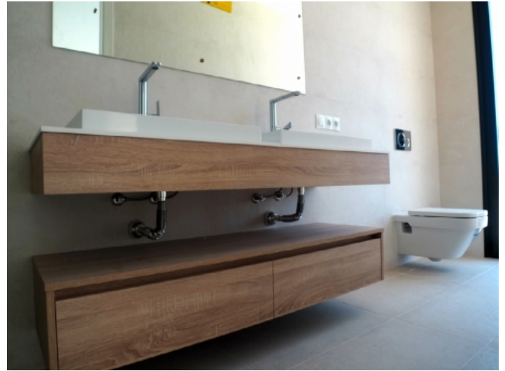
High-quality bathroom equipment