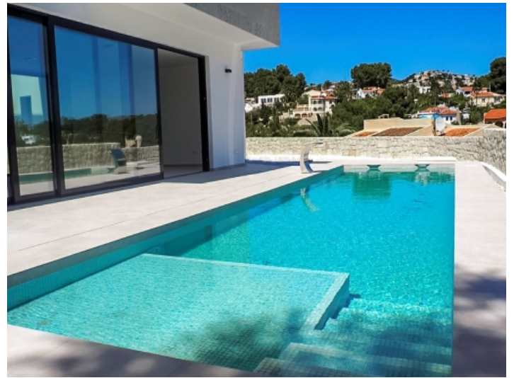
Spacious and puristic pool area