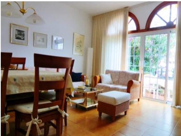
Bright living room with access to the terrace