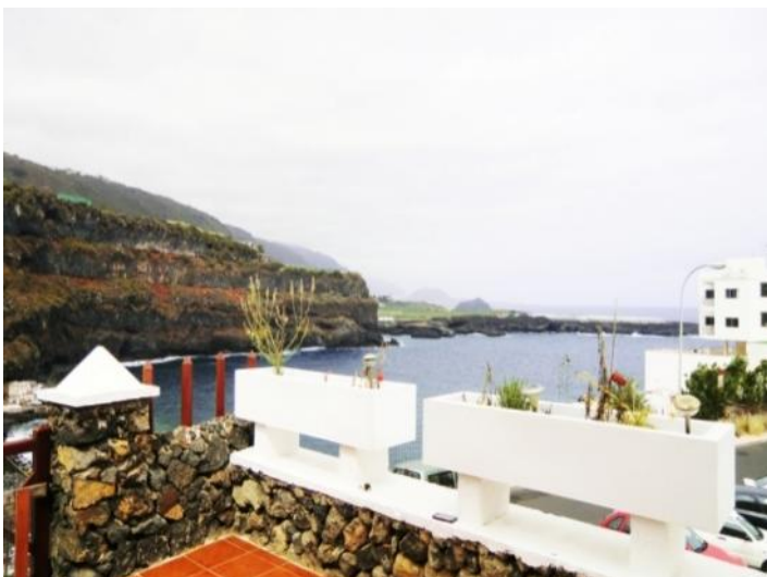
View of the bay of San Marcos