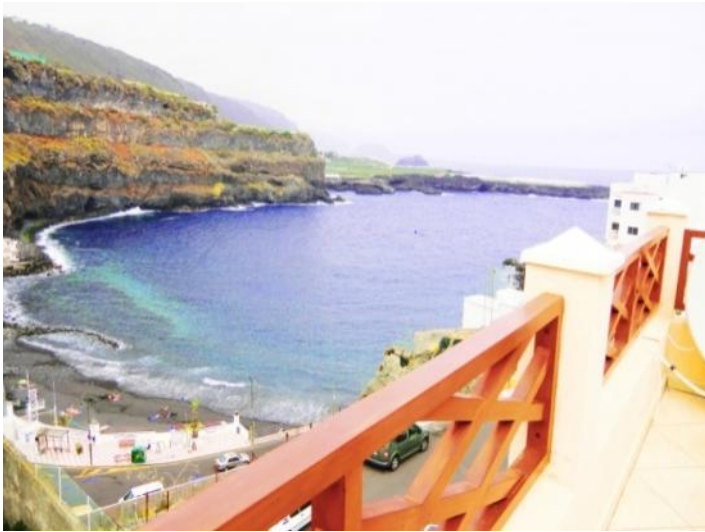
Stunning sea view from balcony