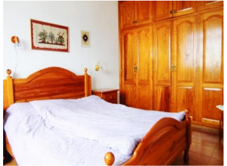
Bedroom with large fitted wardrobes