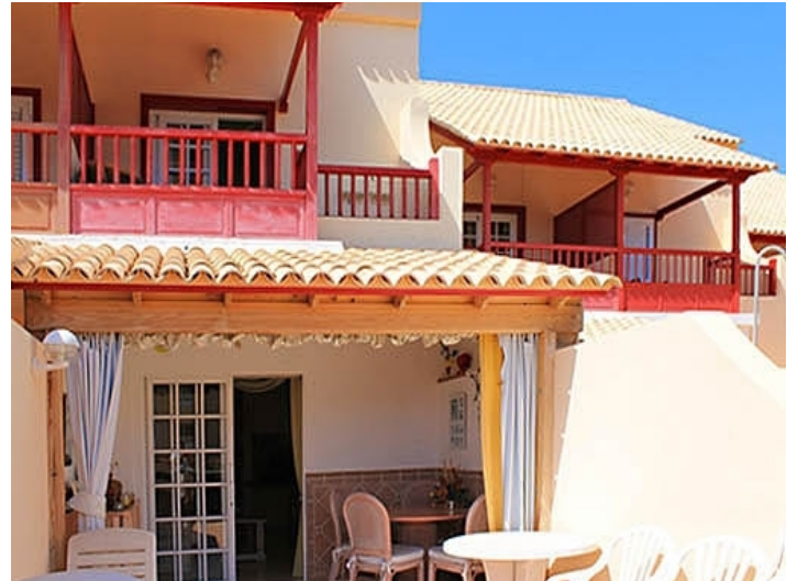
View to the back area of the house