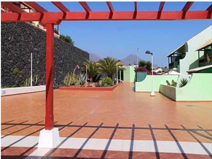
Access to road