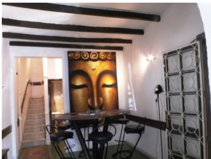
Charming sitting area