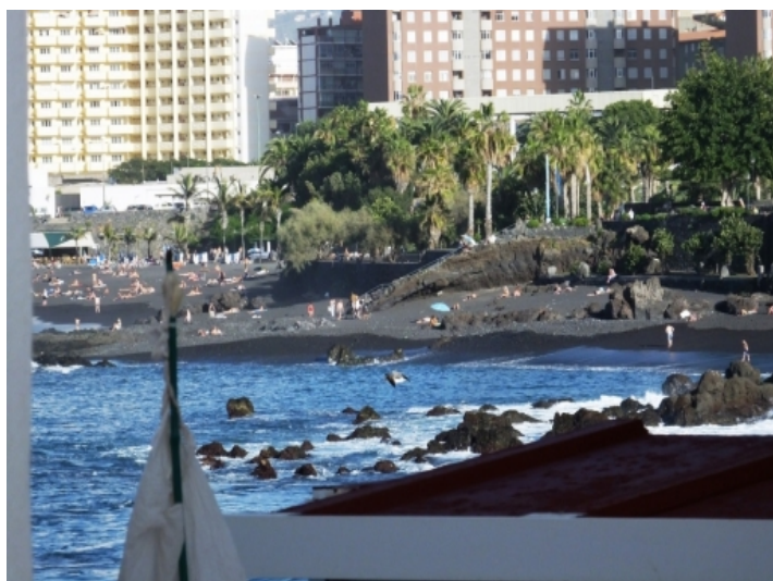
View from the livingroom