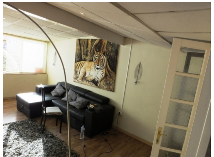
Comfortable seating in the living room