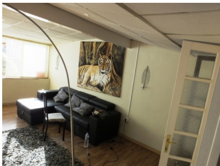
Comfortable seating in the living room