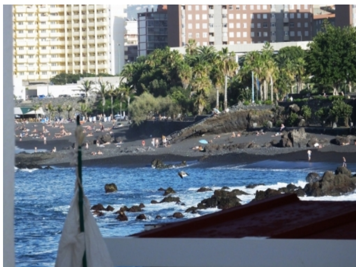
View from the livingroom