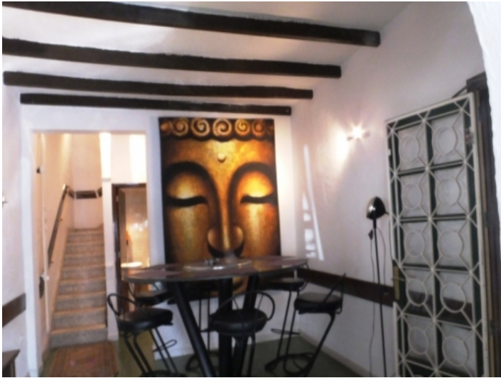
Charming sitting area