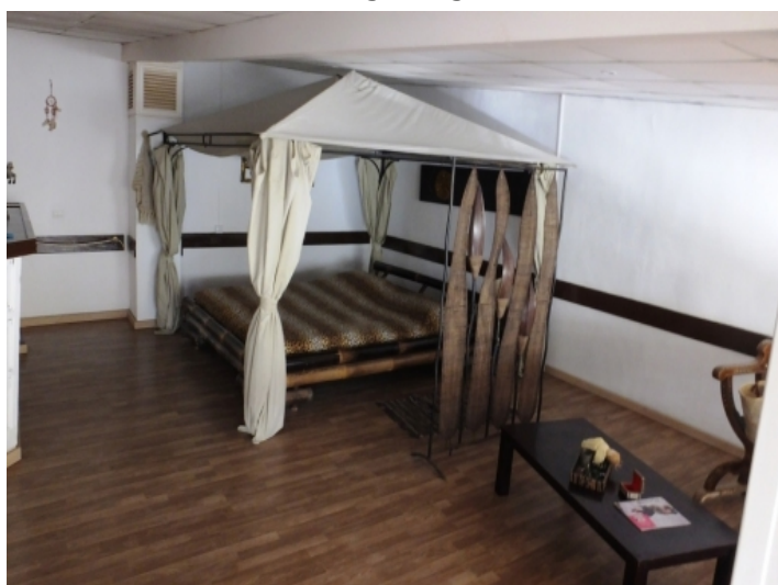
Bamboo canopy bed