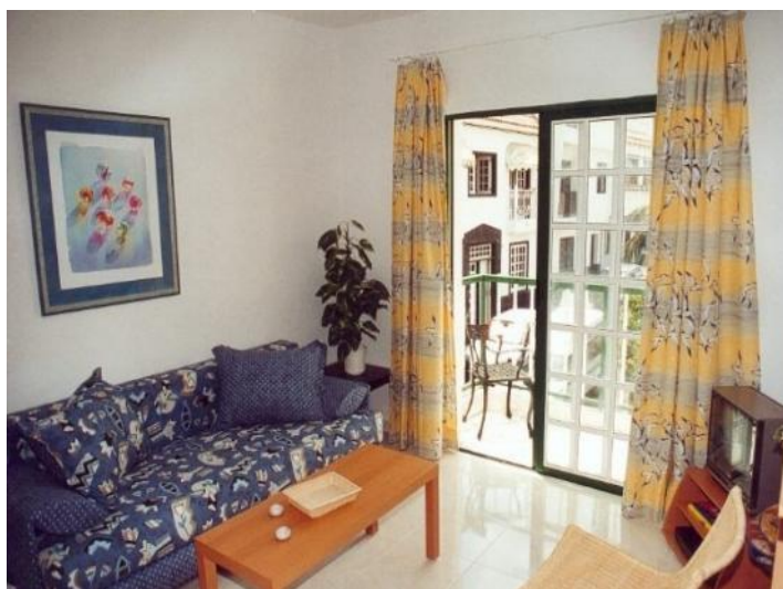
Apartment 6 Livingroom