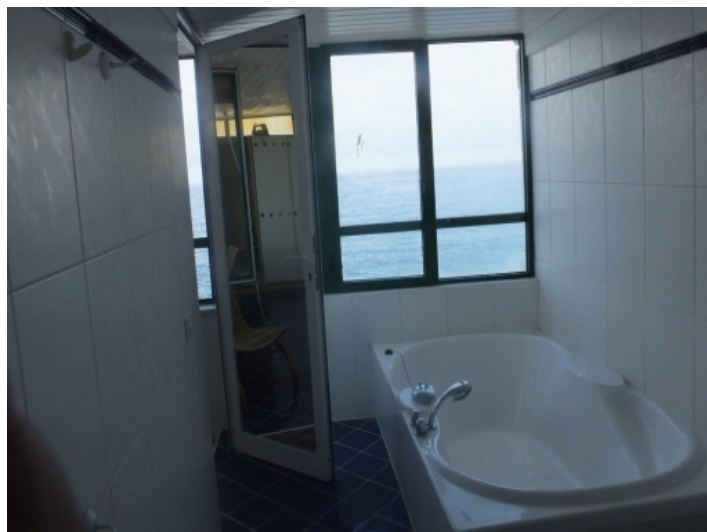
Apartment 1 Bathroom