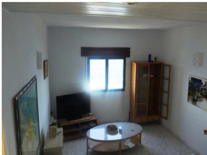
Apartment 1 Livingroom