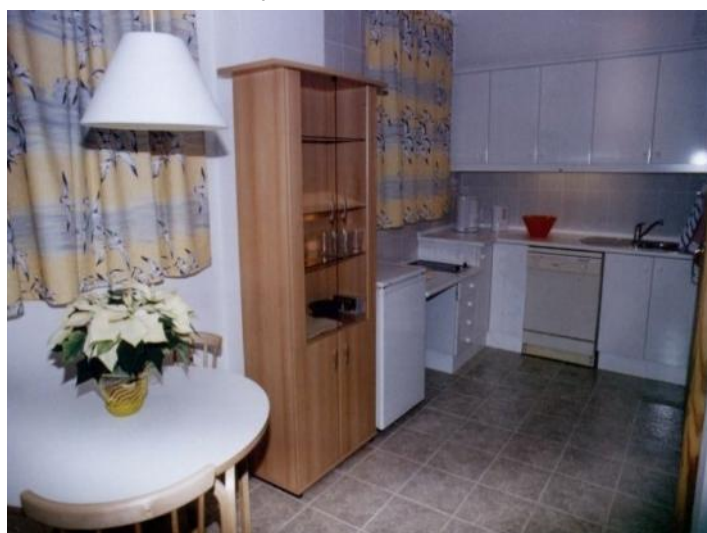
Apartment 5 Livingroom