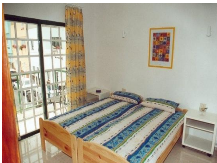
Apartment 6 Bedroom