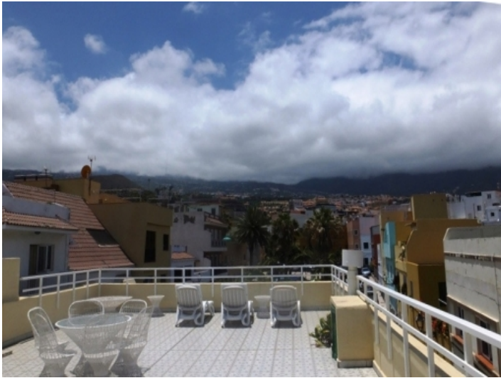
Sun terrace with Teide views