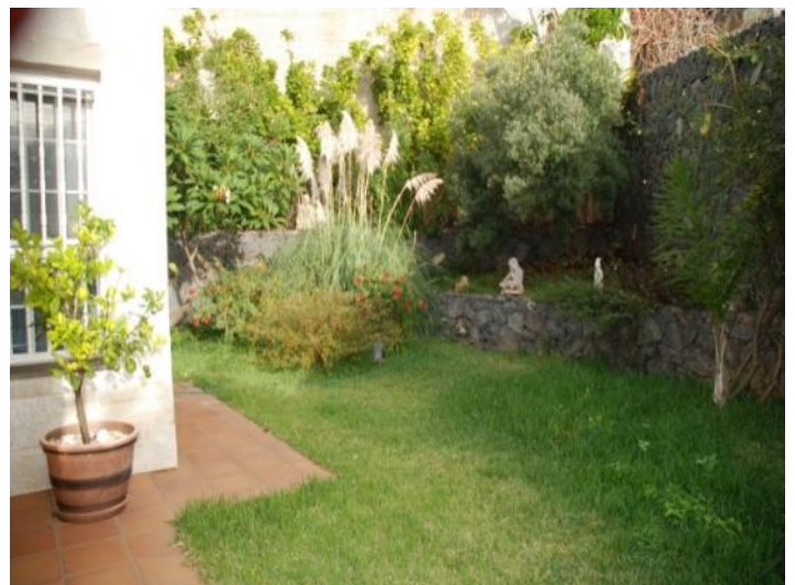
Beautifully landscaped garden surrounding the house