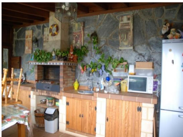
Summer house with barbecue and seating area