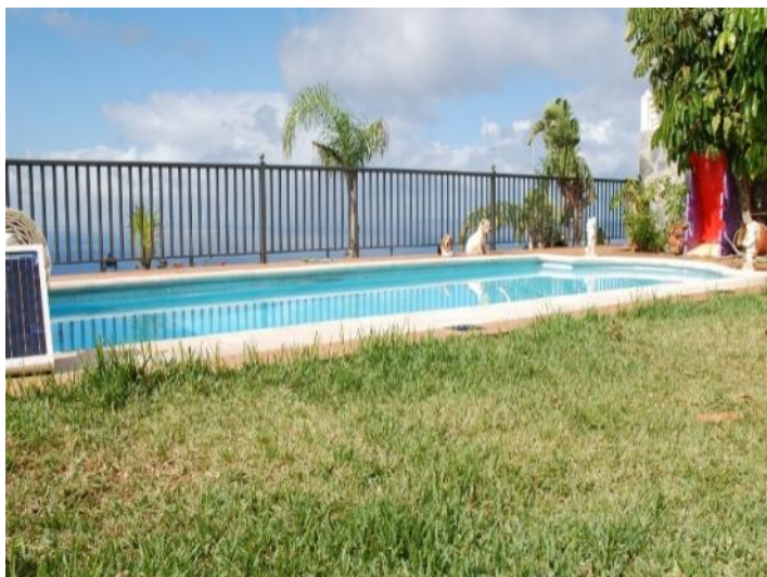
Garden with large heated pool