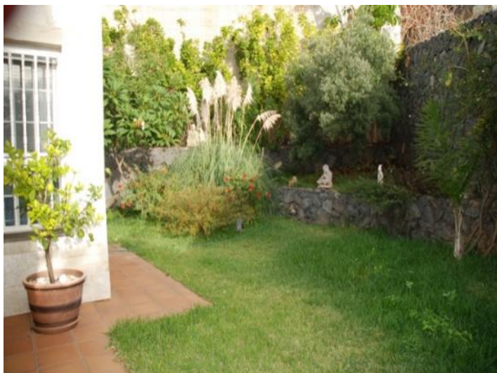
Beautifully landscaped garden surrounding the house