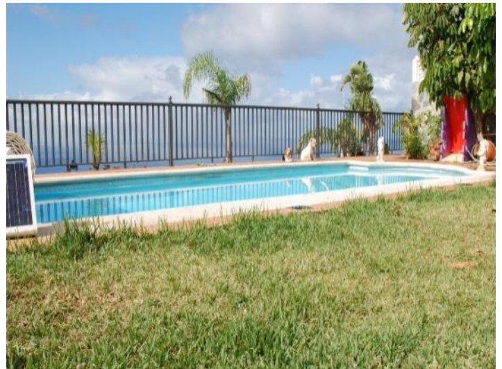
Garden with large heated pool