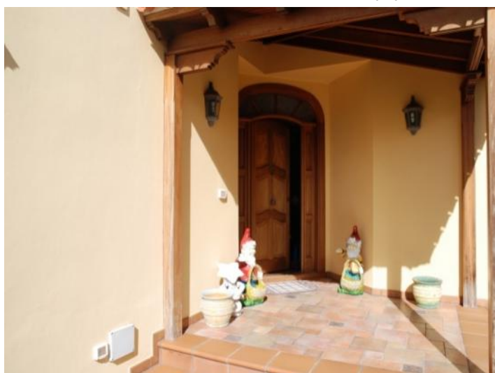
Entrance area of the beautiful chalet