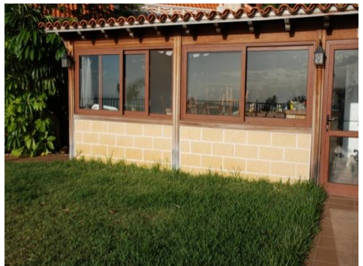
Summer house with additional kitchen equipment