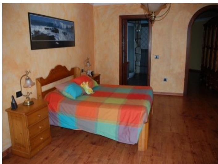
Bright bedroom with bathroom ensuite