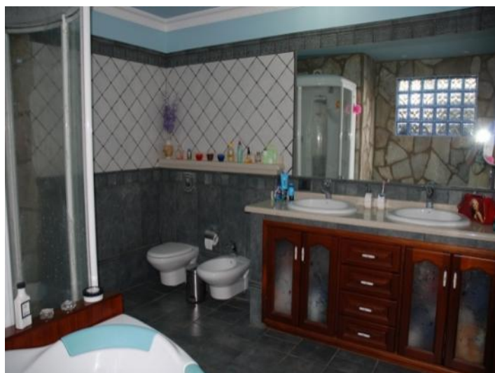
Precious bathroom with corner bath tub and shower