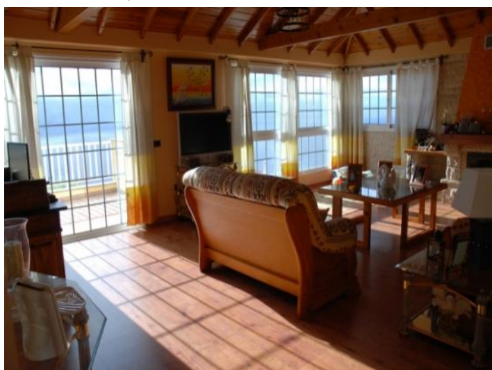
Stylish attic room with chimney in stone design and gable