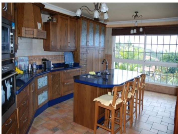
Large kitchen in a beautiful wood design with additional