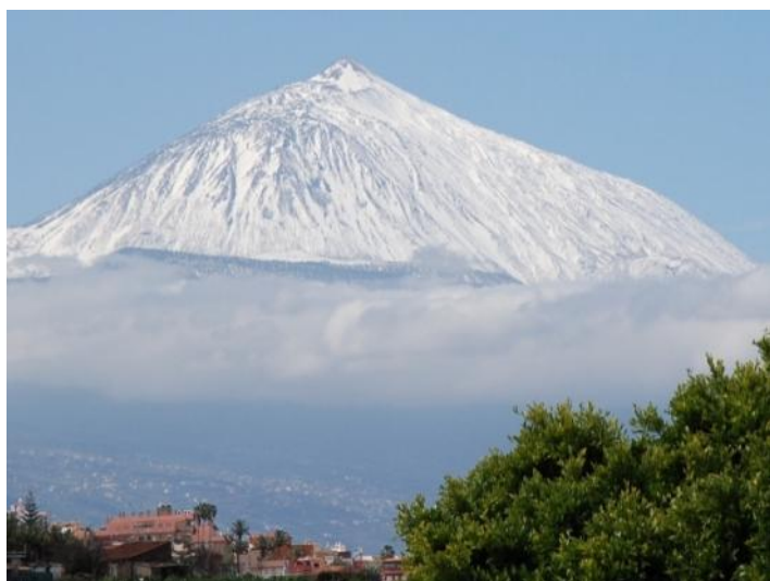
Impressive view of the volcano Teide