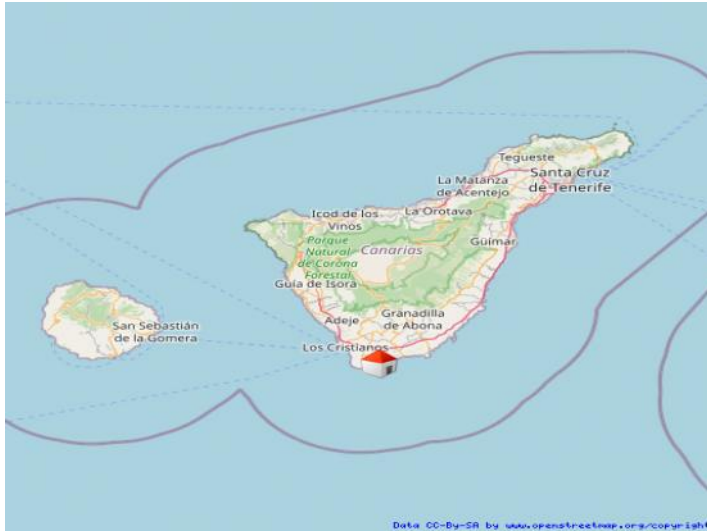
Costa Del Silencio