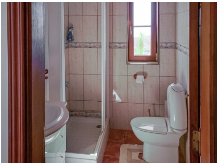
Second natural-light bathroom