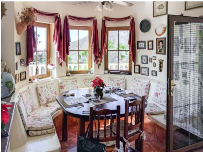
Dining area with natural light