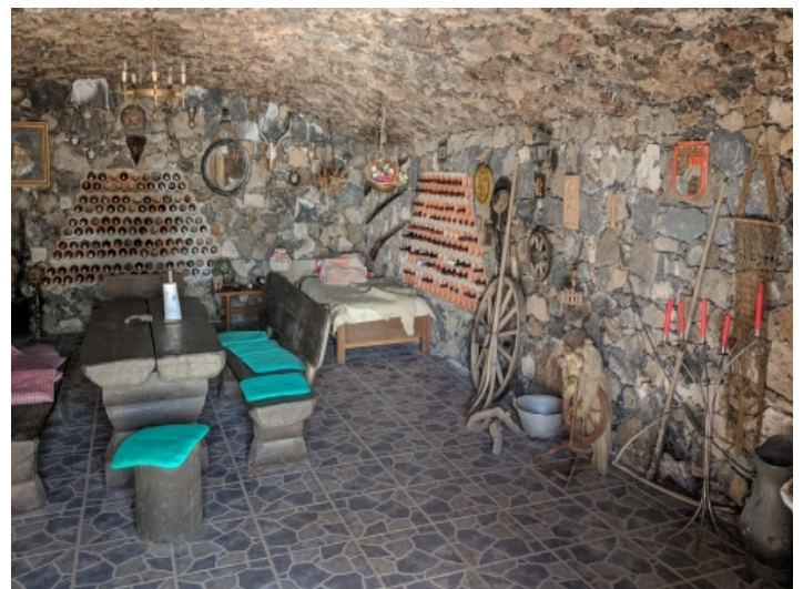
Exterior dining area