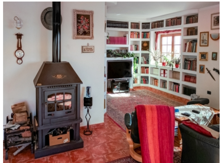
The villa has a fireplace