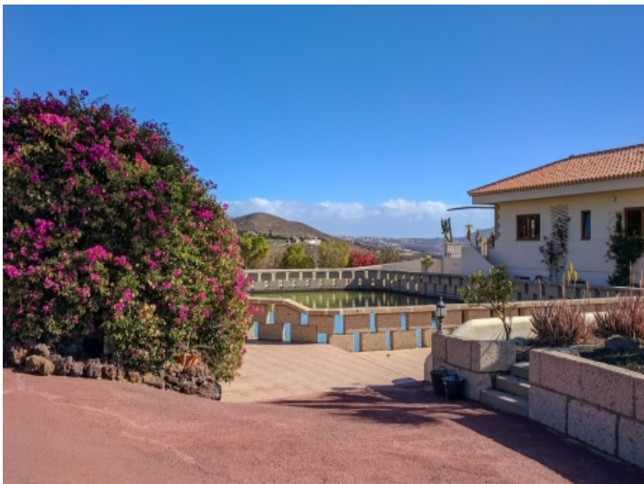
Entrance area of the property