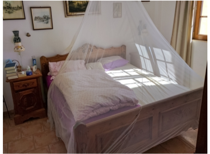
One of four bedrooms