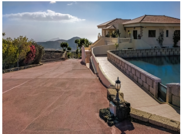
San Miguel de Abona is situated at the southern coast of Tenerife