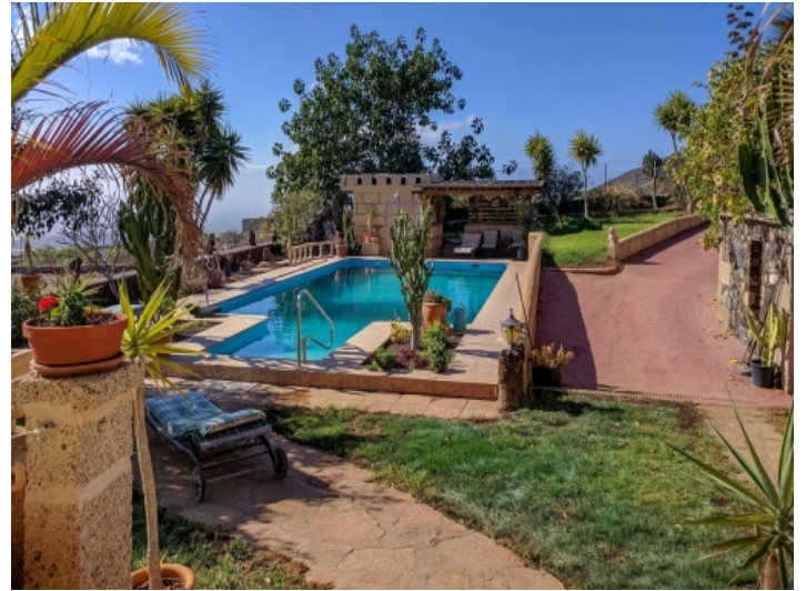
Pool and relaxing area