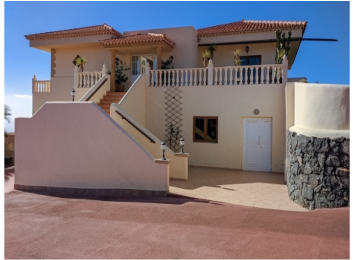
The villa is in a quiet neighborhood