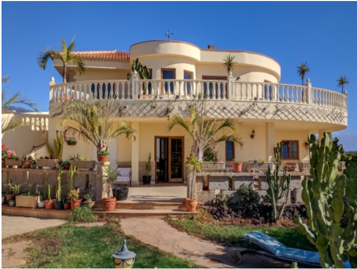
Spectacular exterior views