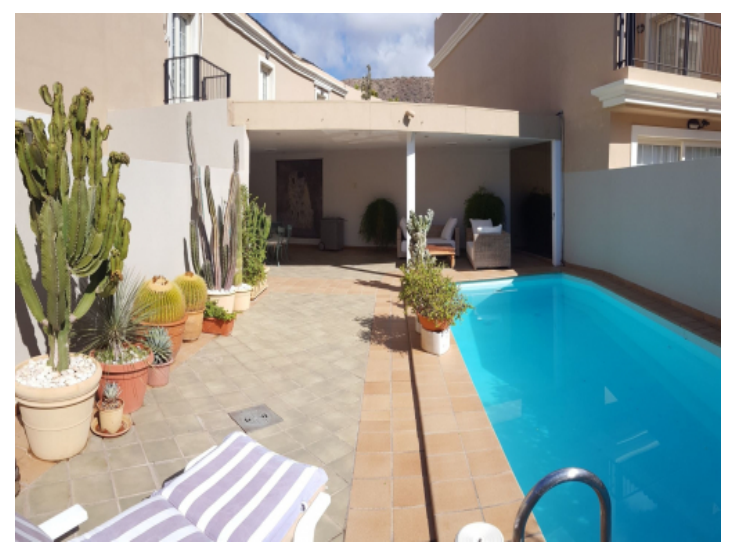
house, Palm Mar