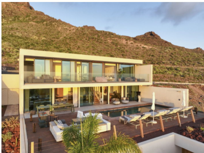
Modern luxurious villa with stunning sea and mountain views