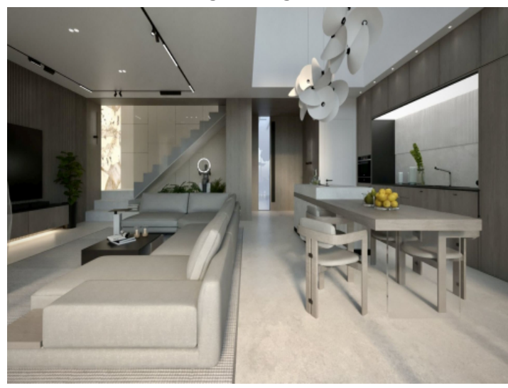
Open room layout