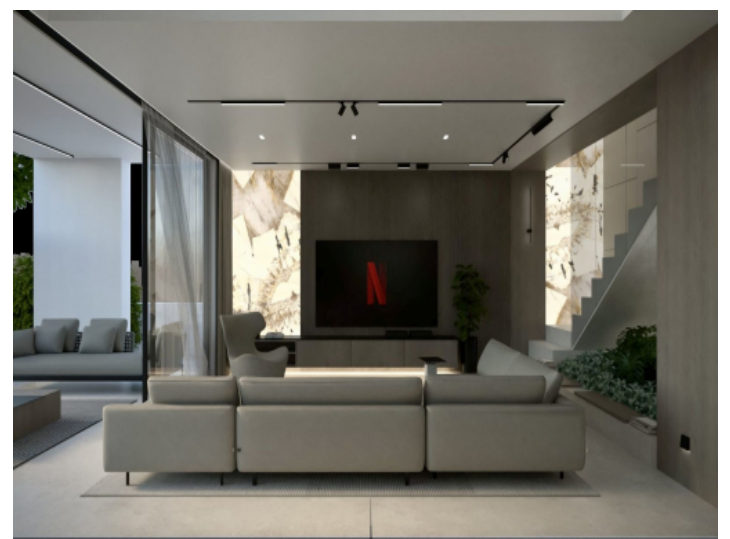
Elegant living area