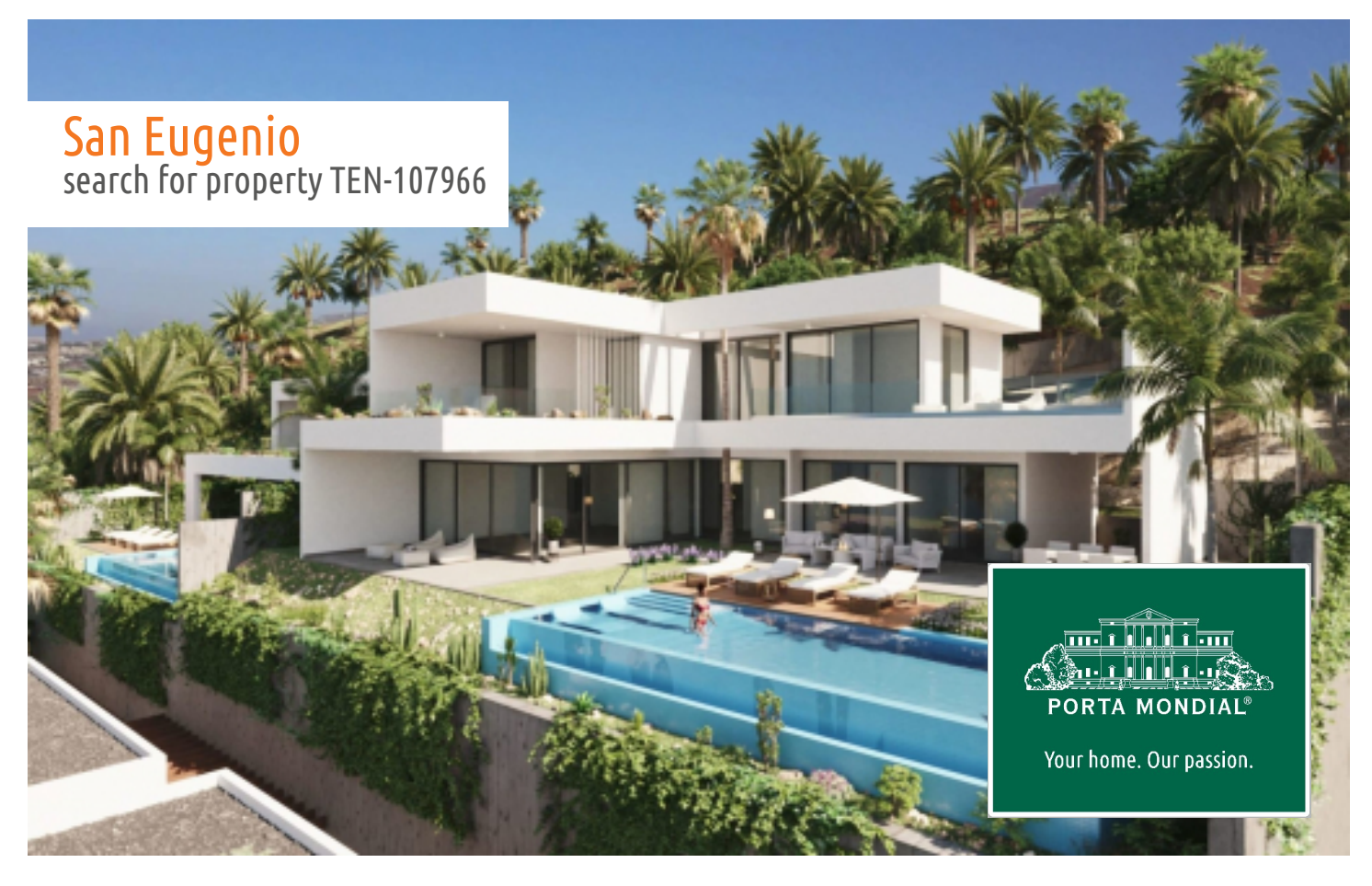
Magnificent 3-bedroom luxury-villa in Costa Adeje