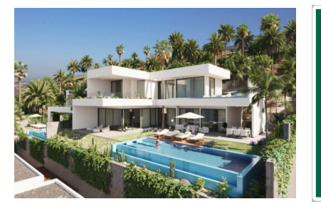
San Eugenio search for property TEN-107966