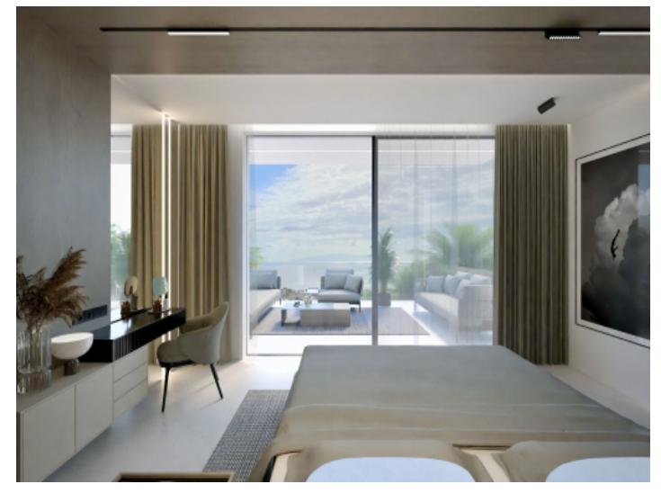
Bedroom on the first floor