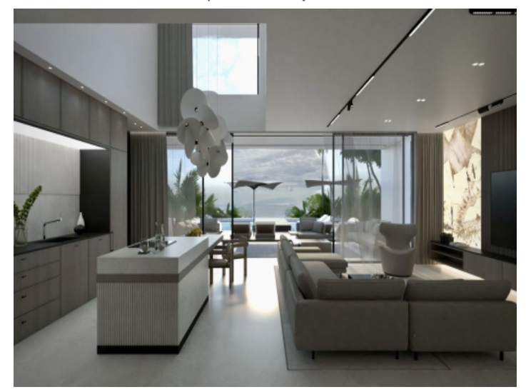
Large window fronts provide plenty of light

PORTA TENERIFE • CALLE LUIS DE LA CRUZ 10, 38400 PUERTO DE LA CRUZ, SPAIN TEL.: +34 922 386 273 • INFO@PORTATENERIFE.COM • WWW.PORTATENERIFE.COM