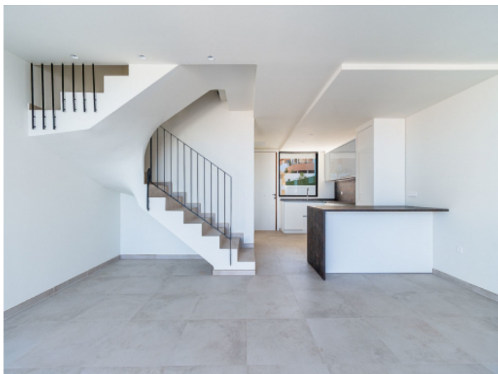
Living, dining and kitchen area