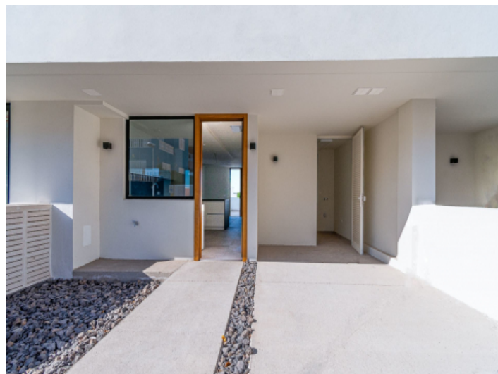
Façade and patio