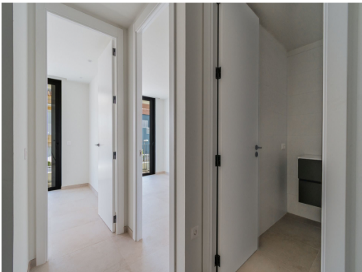
Two bedrooms shares one bathroom