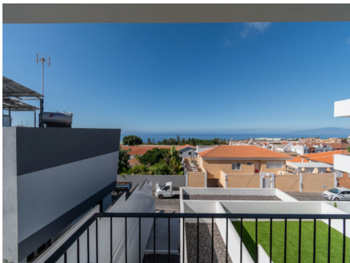
Views from the first floor