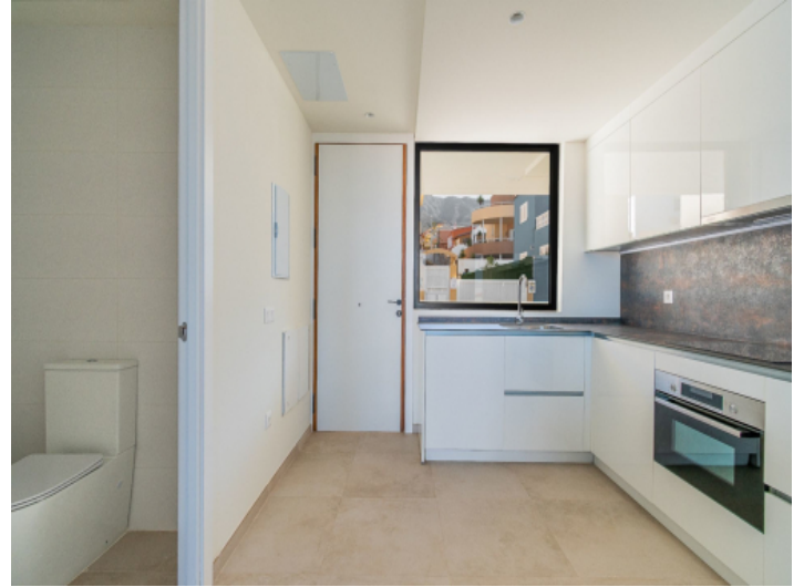
Kitchen and guest toilet