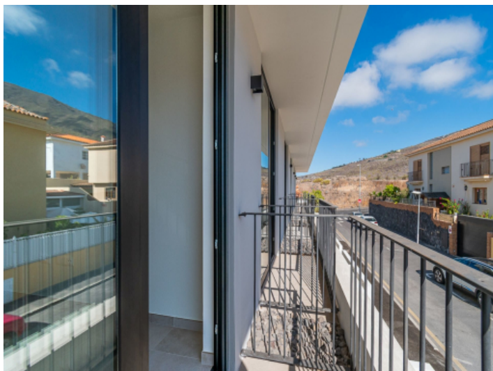
Terrace first floor