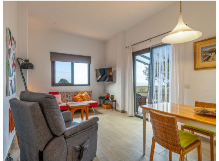
Living area guest apartment