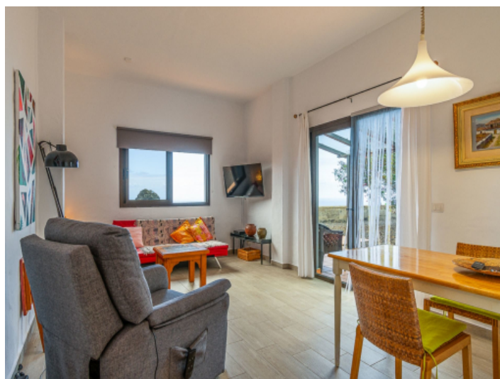
Living area guest apartment