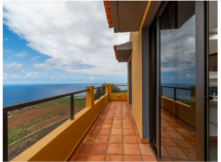
Balcony with sea views