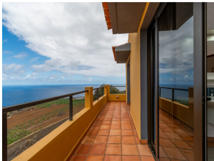
Balcony with sea views