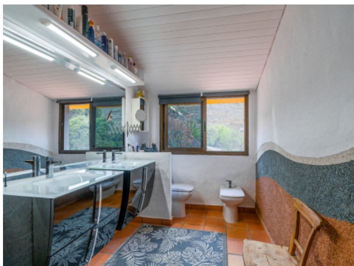
The villa offers 5 bathrooms