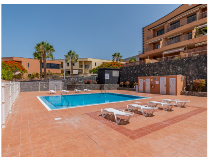
Playground Community pool