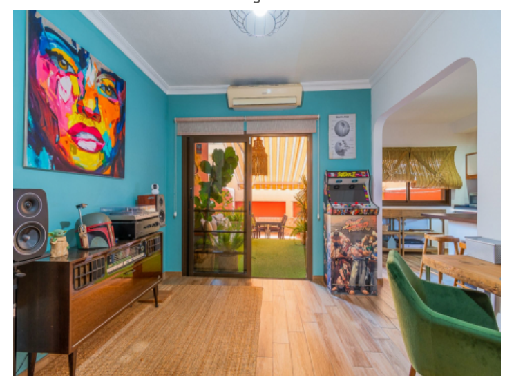
Direct access to the patio