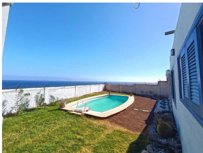
Pool area with sea views