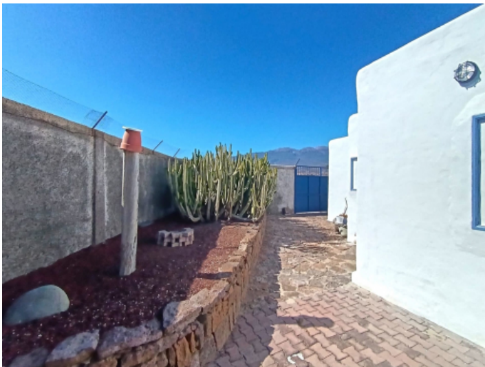
Terrace with mountain views