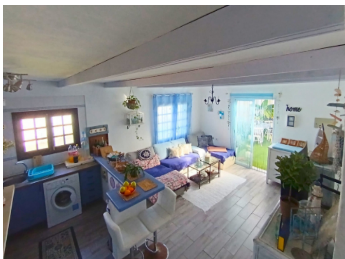
Open-plan living area