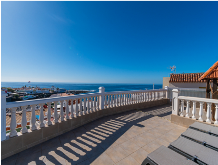
Unique sea views from the balcony