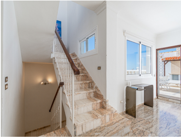
Staircase leads to the different levels from the townhouse