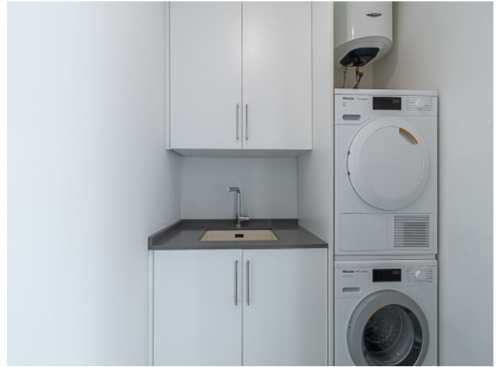
Utility room with washing machine and dryer