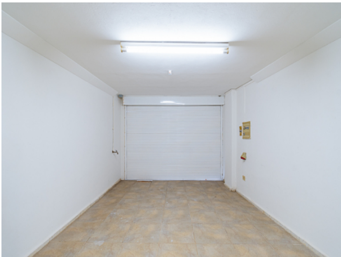
Garage from the townhouse