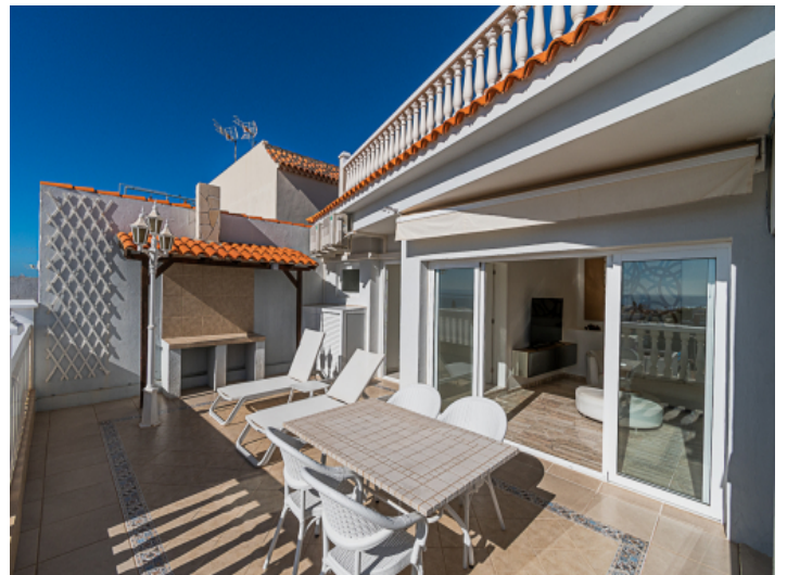
Dining area on the terrace