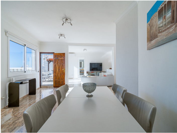
Modern dining area