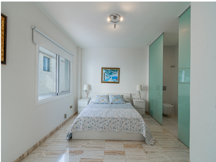
Cosy bedroom with bathroom en suite