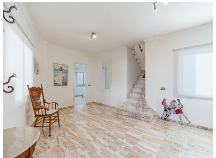
Entrance from the townhouse