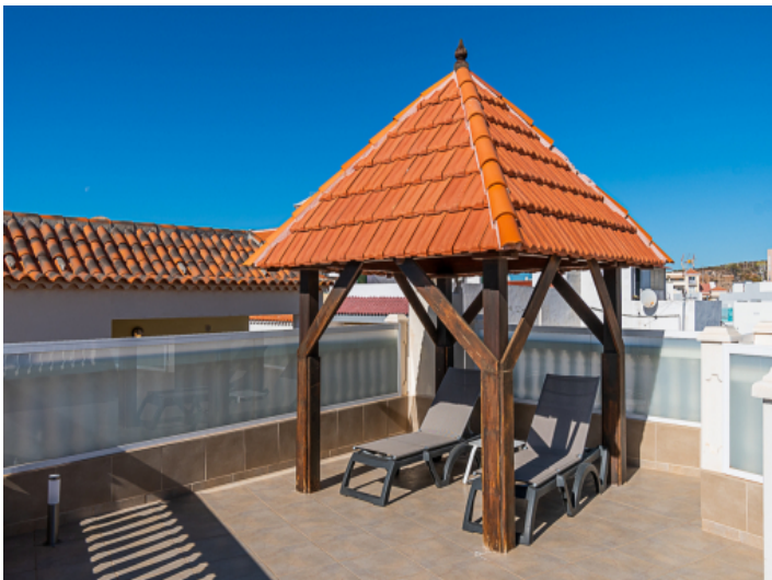
Terrace with pavilion