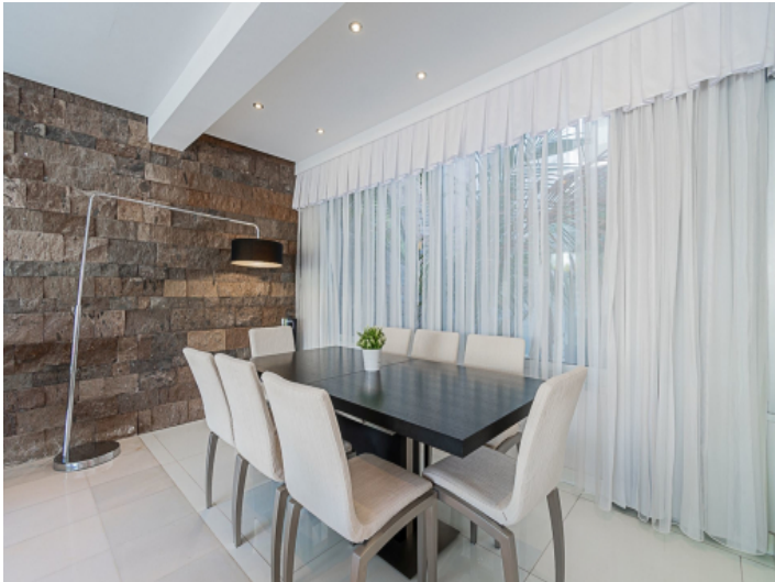
Dining area with natural stone wall