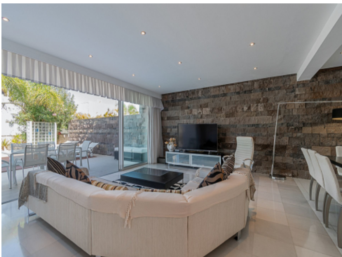
Living and dining area facing to the pool