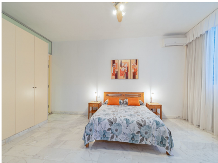
Bright bedrooms with built- in wardrobes