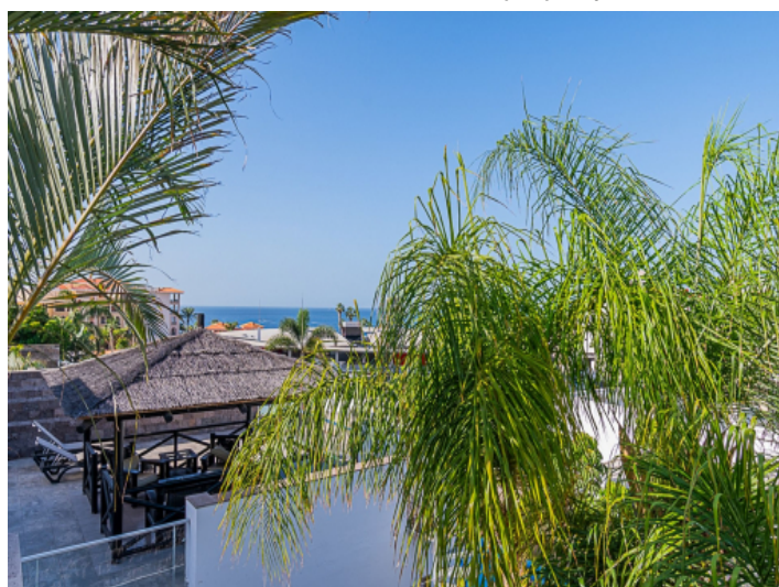
Sea views from the rooftop