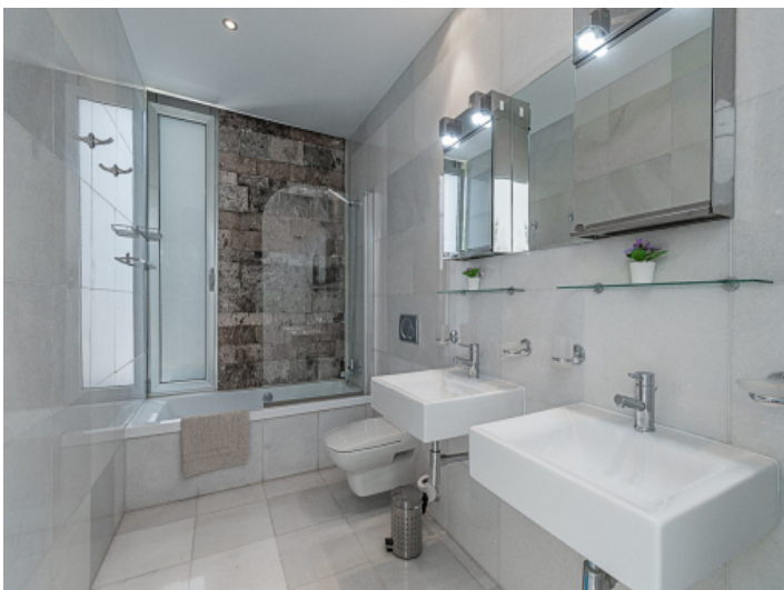
Bath en suite with shower