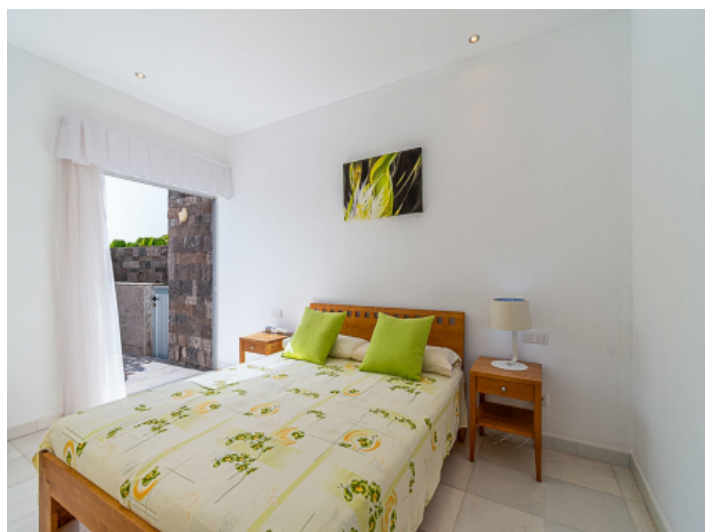
Bedroom with nice views