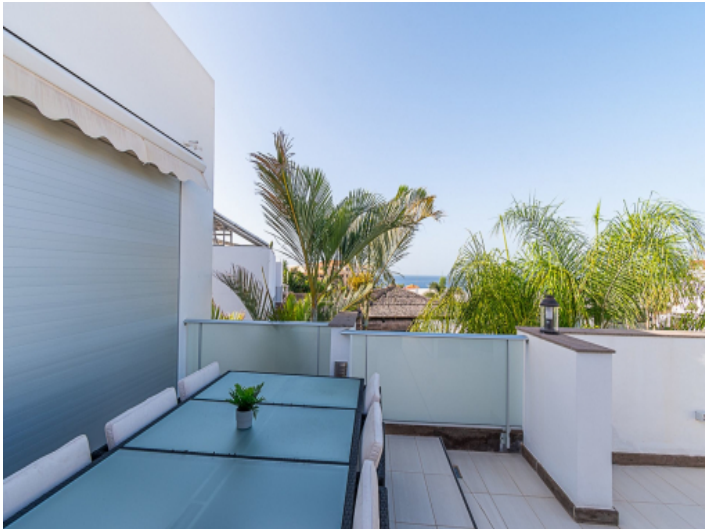
Large rooftop with sea views