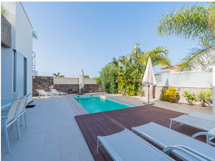
Join the perfect pool area