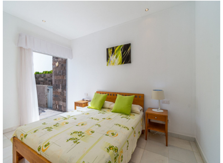
Bedroom with nice views