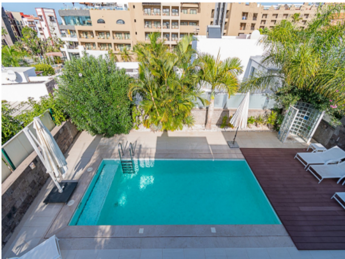
View from the rooftop over the pool and neighborhood