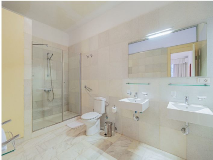
One o 5 bathrooms