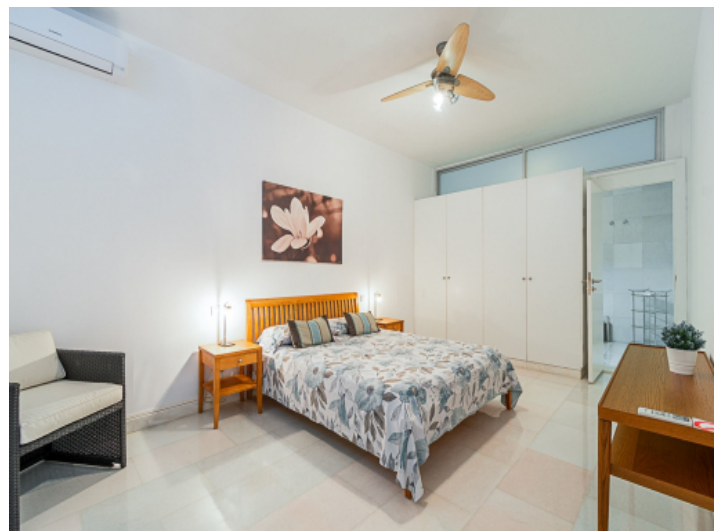
Another large bedroom with bath en suite