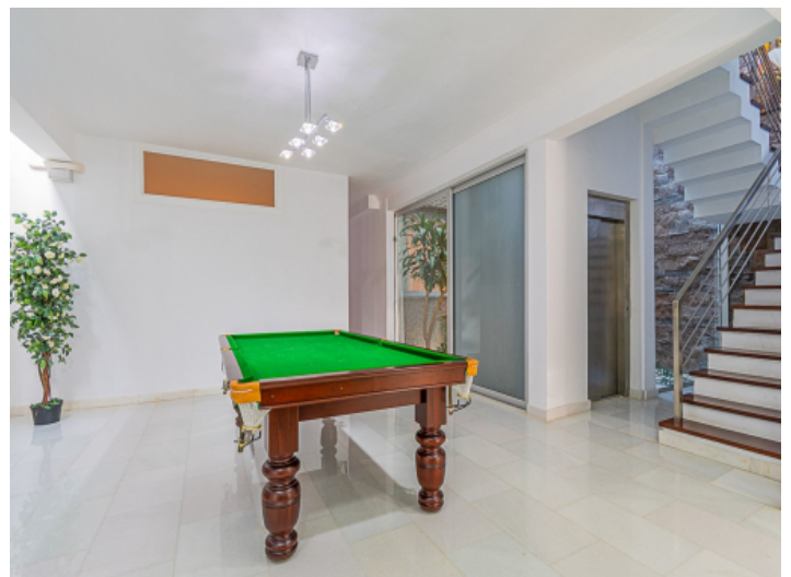
Game room in the basement easy reachable by elevator or staircase

PORTA TENERIFE • CALLE LUIS DE LA CRUZ 10, 38400 PUERTO DE LA CRUZ, SPAIN