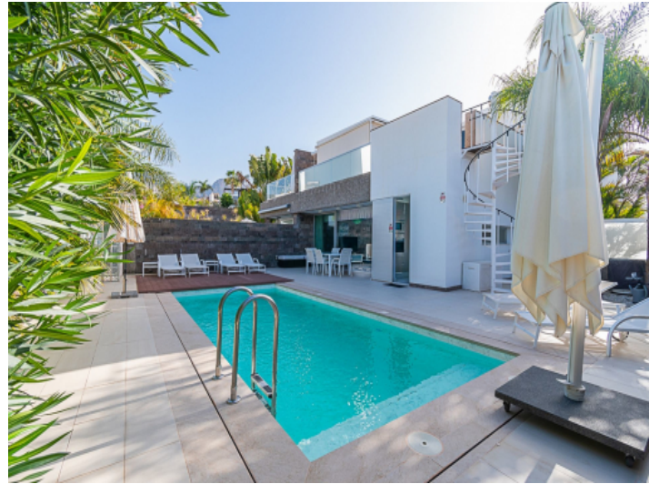
Alternative view from the property