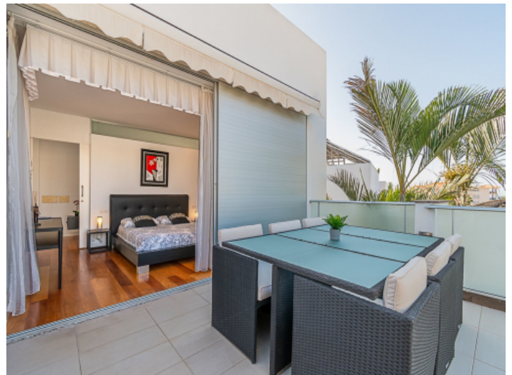
Master bedroom with direct access to the rooftop chillout area