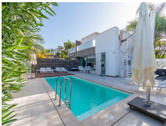
Alternative view from the property