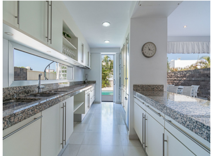
Large and modern kitchen