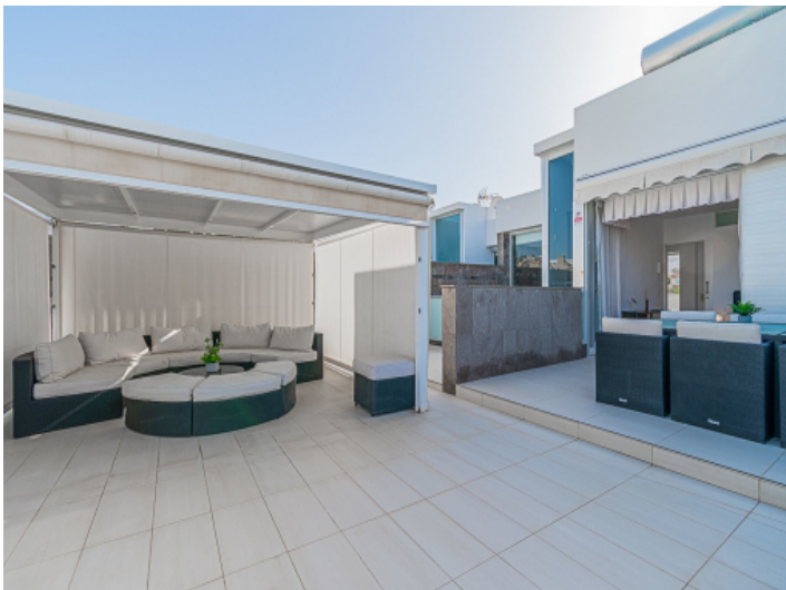
Rooftop with chillout lounge