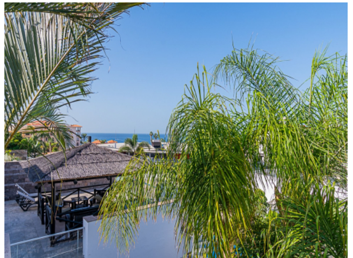
Sea views from the rooftop