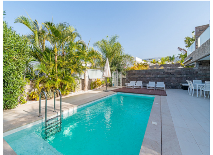
Tropical pool area