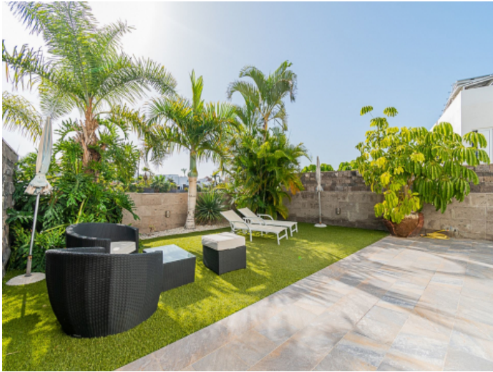
Beautiful green courtyard