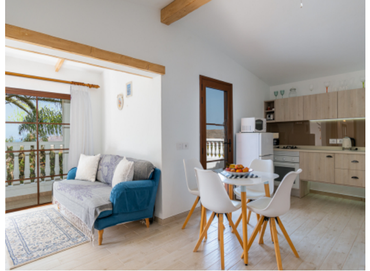
Apartment with open plan kitchen