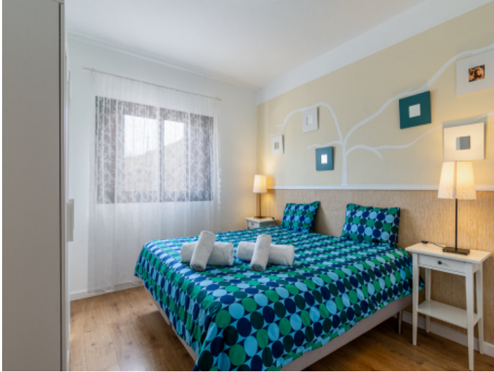
One bedroom of 10 bedrooms