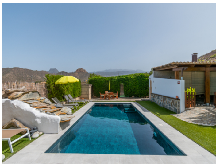
Well maintained pool area