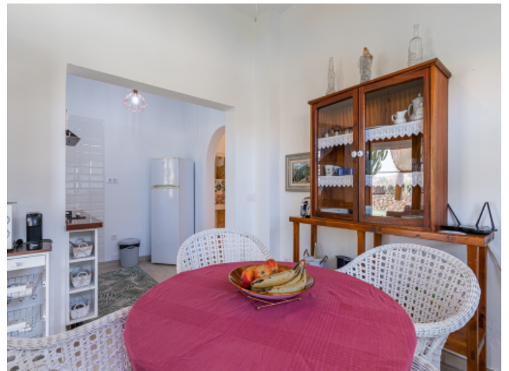
Comfortable living area in one of 4 apartments