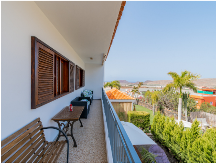
Large balcony with views