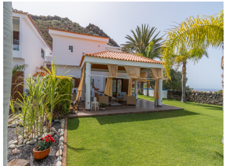
Main house surrounded by a tropical garden