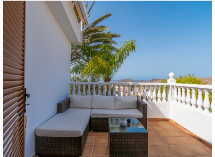
Beautiful private terrace