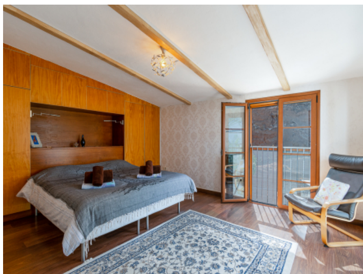
Comfortable holiday destination