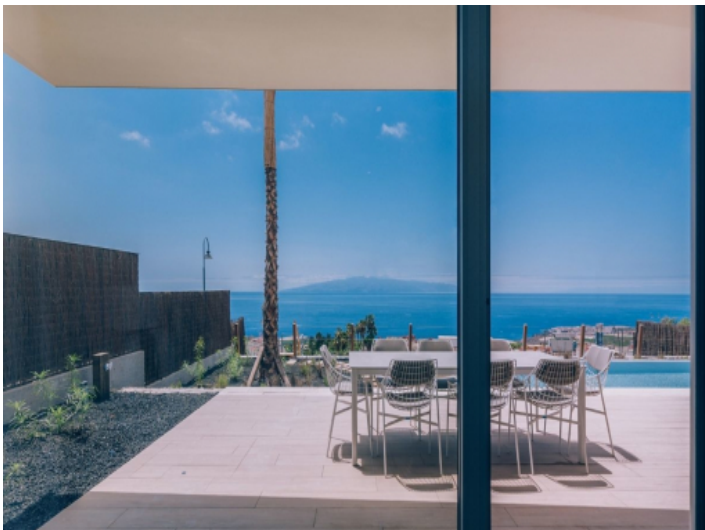
Fantastic sea views