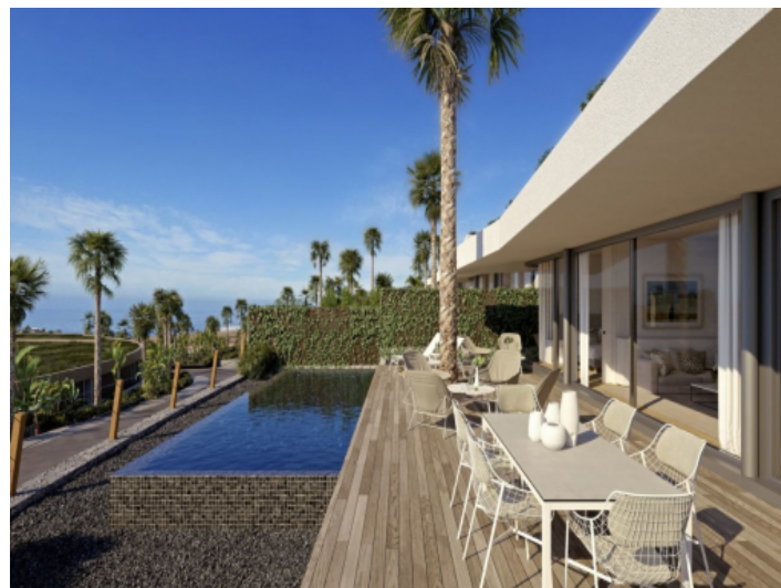
Large outdoor space with pool