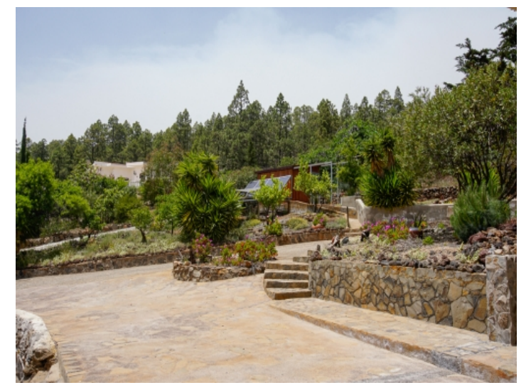
Exterior view of the property