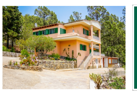
Vilaflor search for property TEN-107821