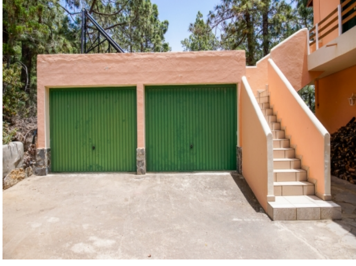
Spacious double garage

PORTA TENERIFE • CALLE LUIS DE LA CRUZ 10, 38400 PUERTO DE LA CRUZ, SPAIN TEL.: +34 922 386 273 • INFO@PORTATENERIFE.COM • WWW.PORTATENERIFE.COM