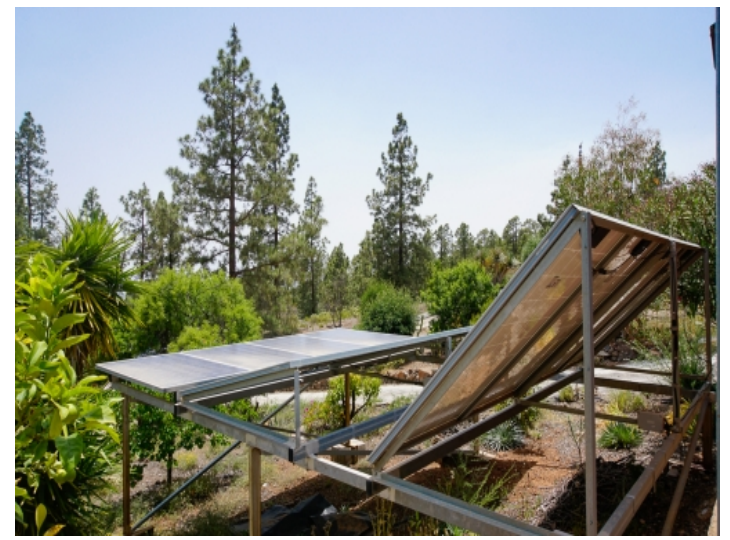
Large solar panels