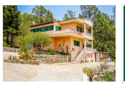
Vilaflor search for property TEN-107821