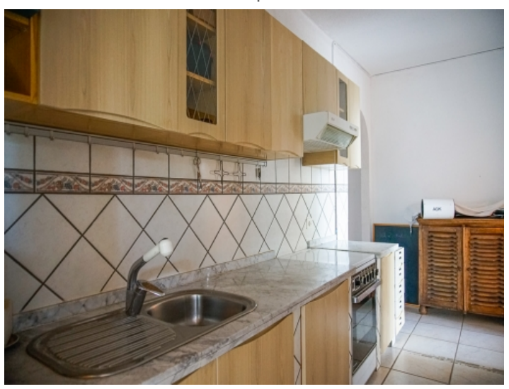
Kitchen Apartment 3