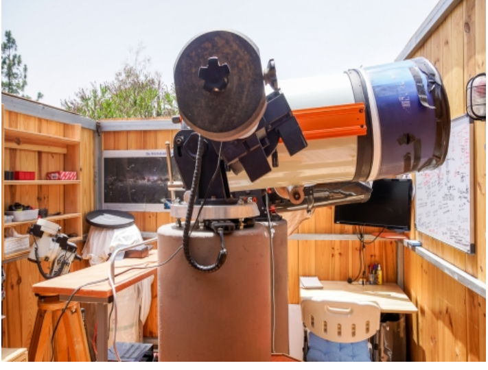
Splendid astronomical observatory