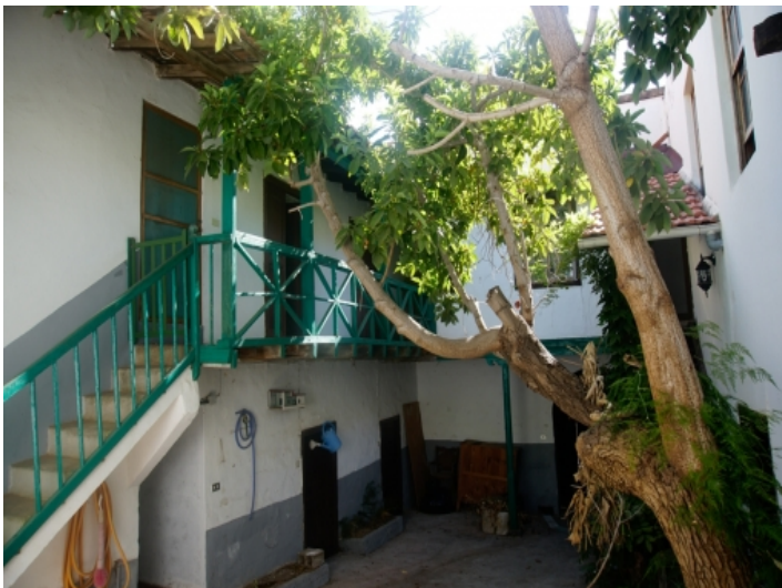
Large patio of the house