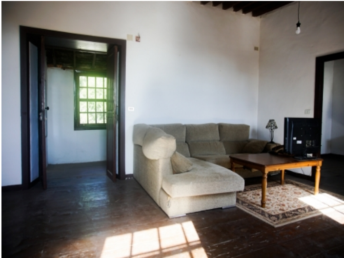
View of the living area