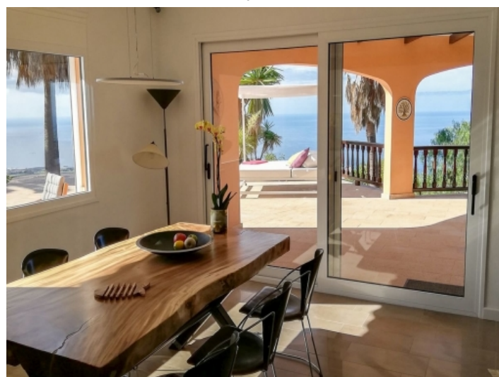
Dining area with terrace access