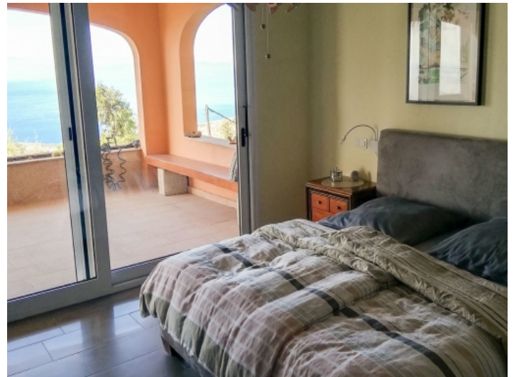
One of 4 bedrooms