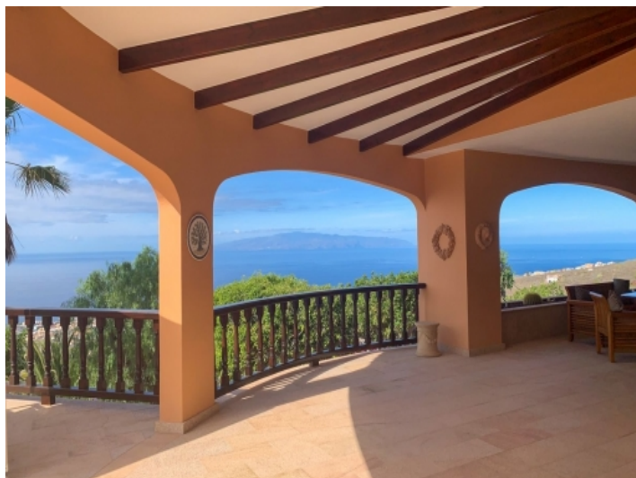
Spacious balcony with a view