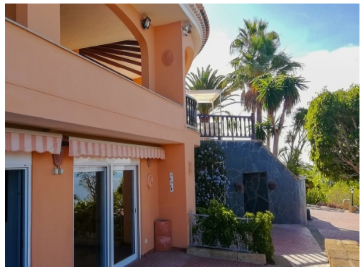
Side view of the villa