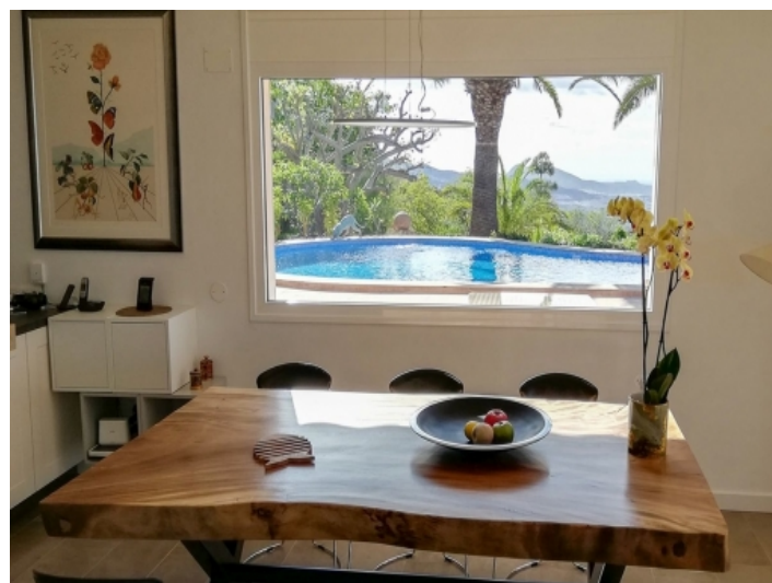
View to the pool area