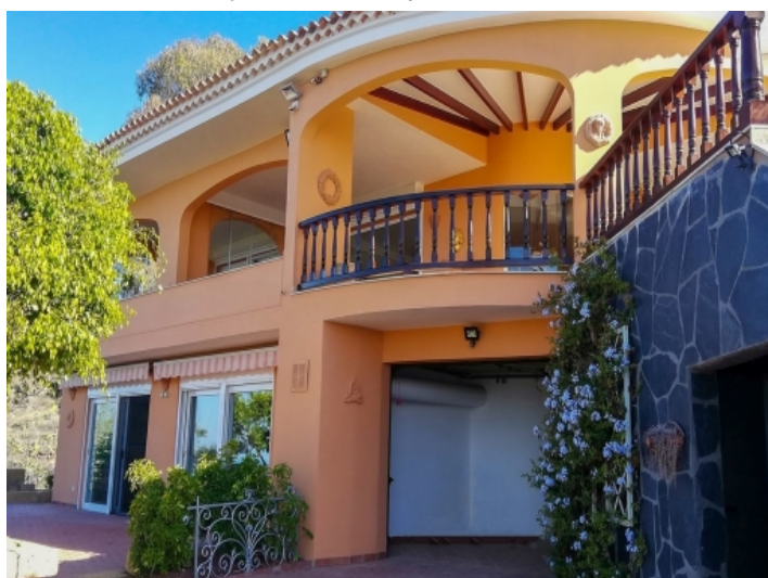
Exterior view of the villa