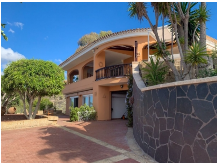
Entrance to the villa