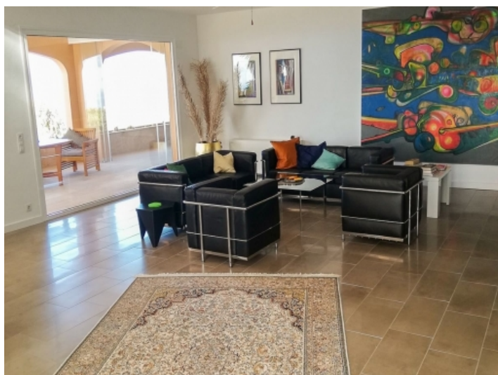
Large living area