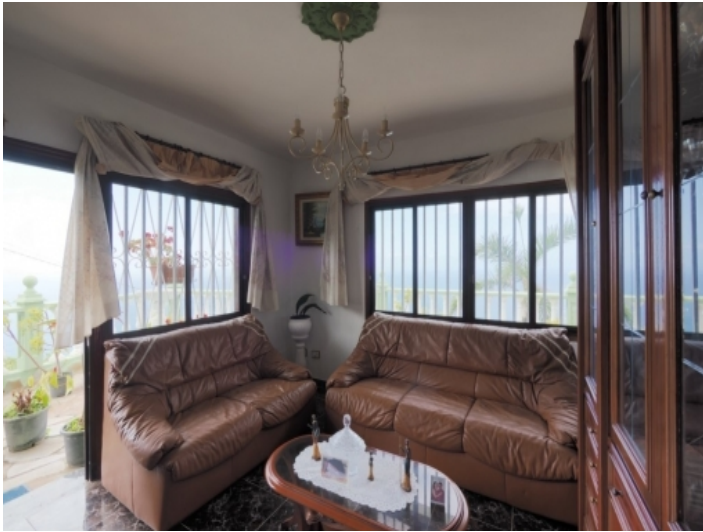
Living room with access to the terrace