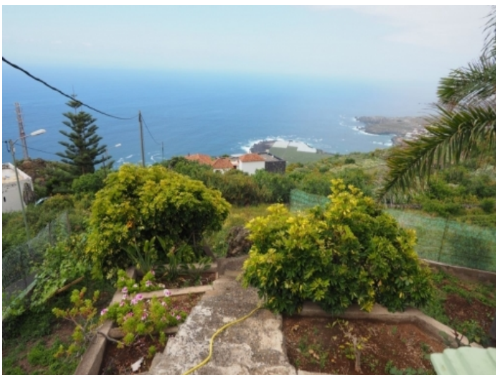
Garden and terrain