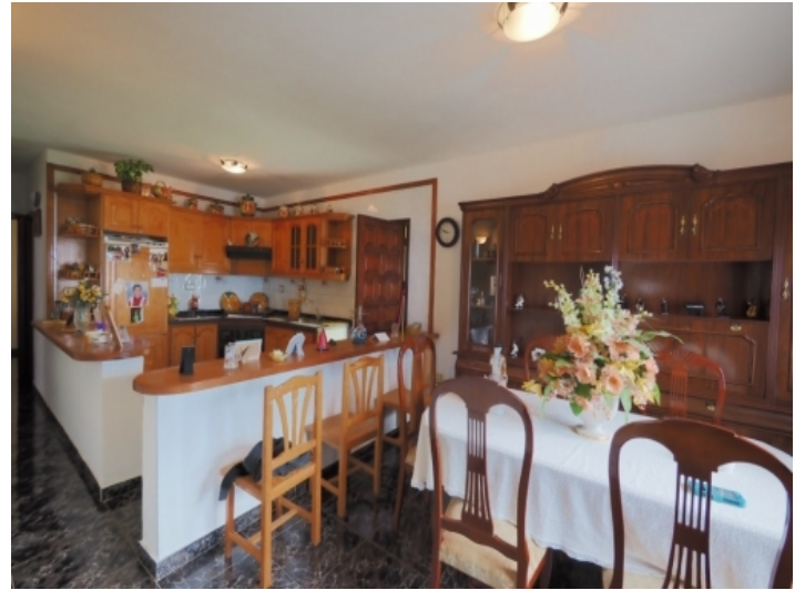
Kitchen and dining room