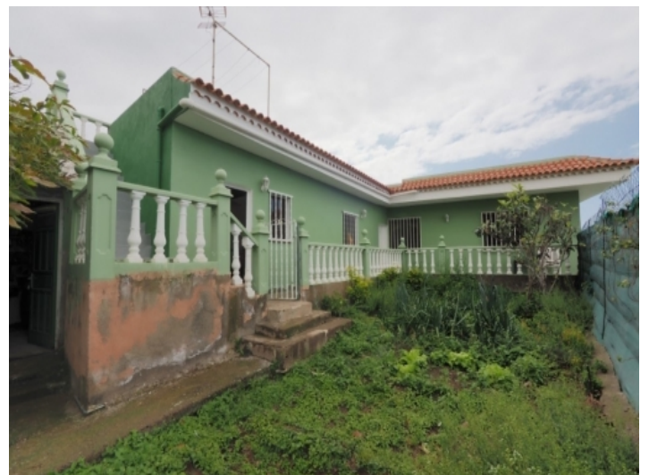
View on the house from garden