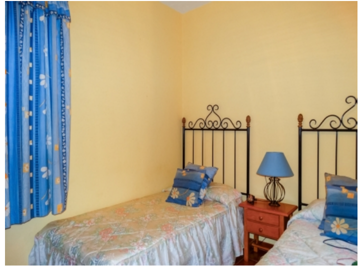
Guest bedroom with 2 separate beds