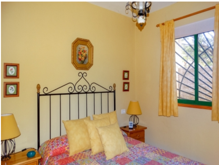
Bright master bedroom