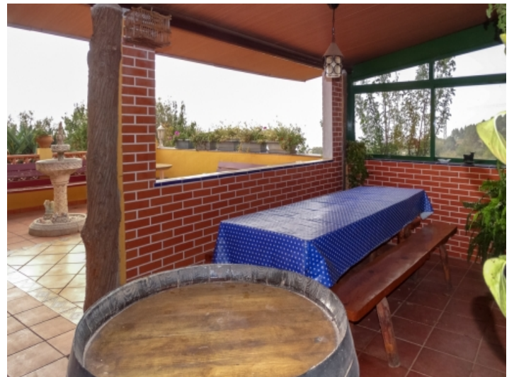
Outdoor dining area