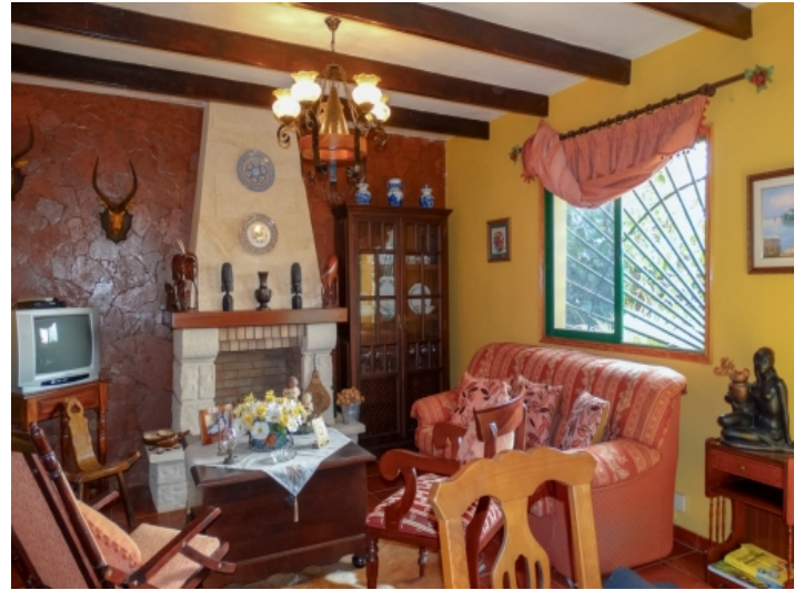
Cosy living area with fireplace