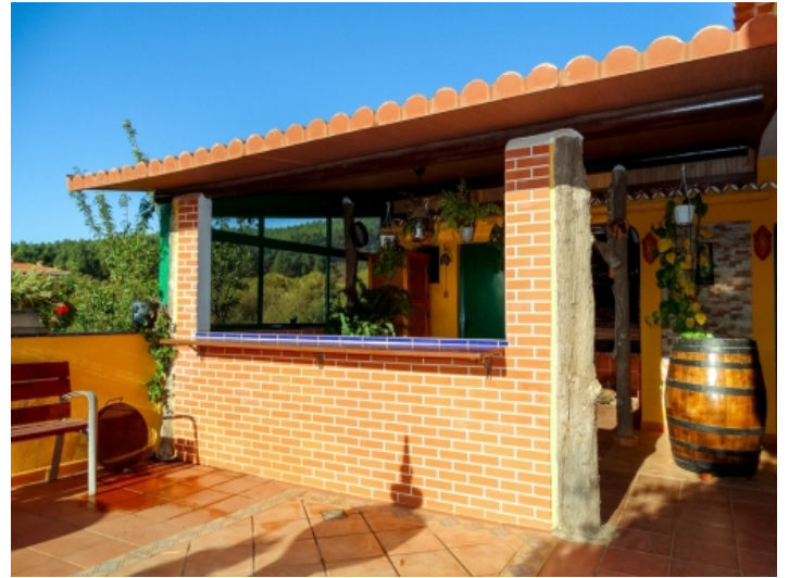
Views of the terrace