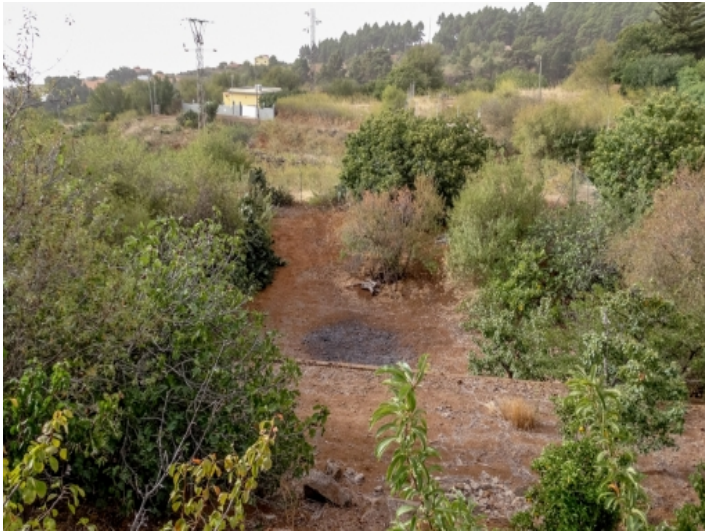
Large garden of the property