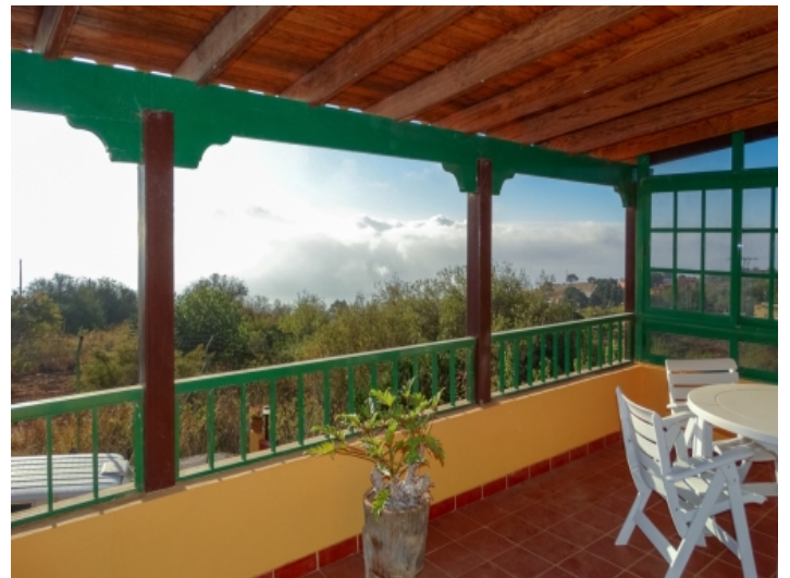
Stunning views from the balcony