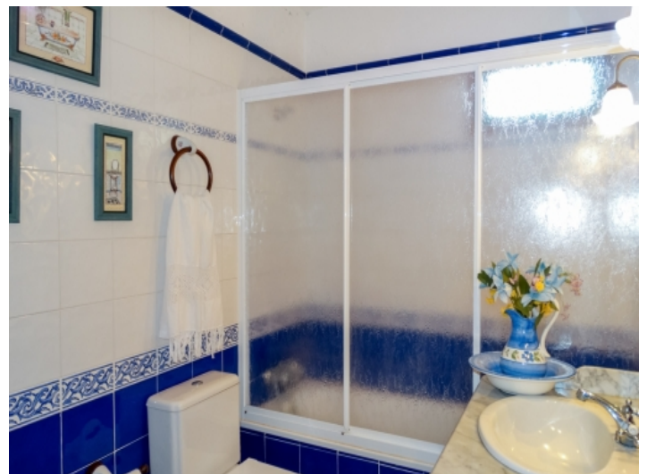
Light flooded bathroom