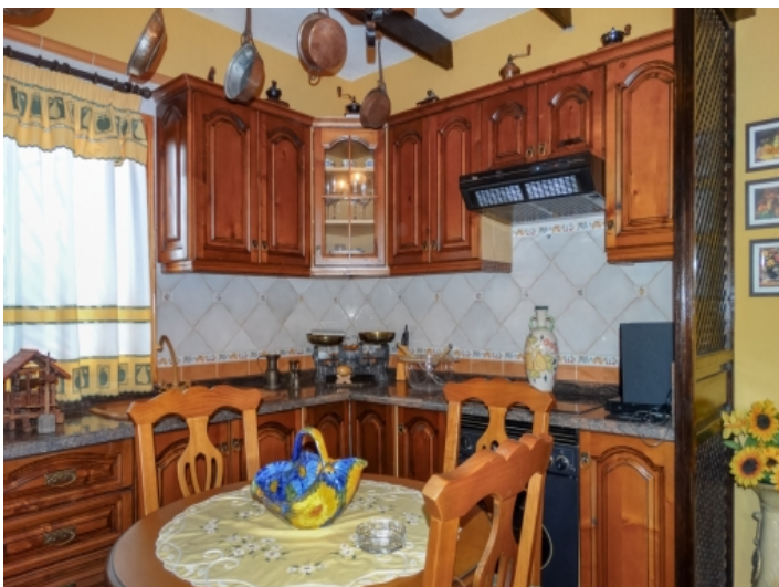
Fully equipped country kitchen