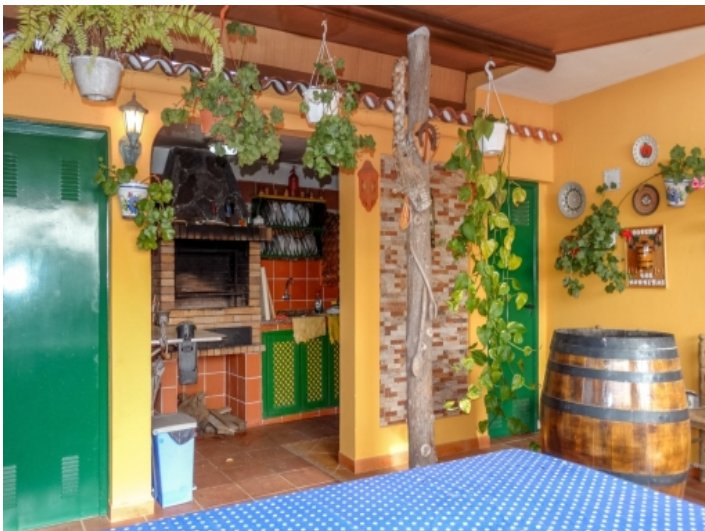
Exerior kitchen and dining area