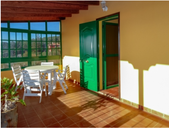
Covered dining area