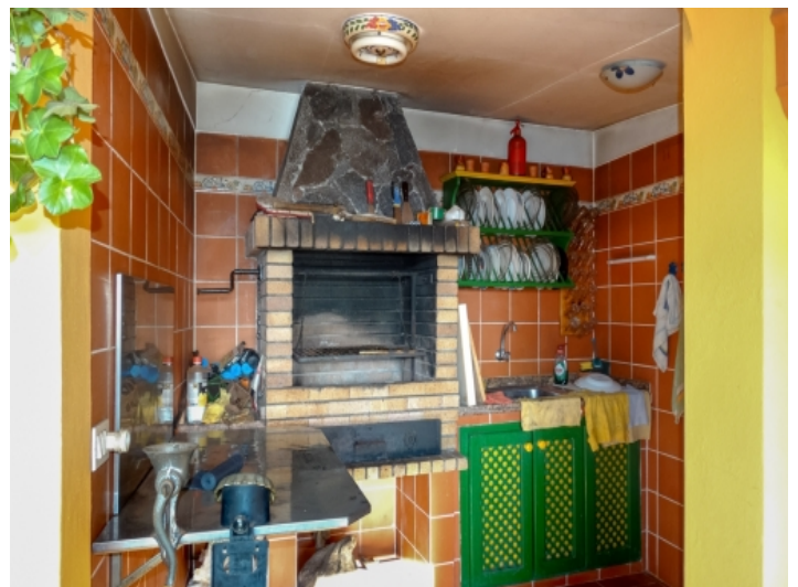
Practical outdoor kitchen