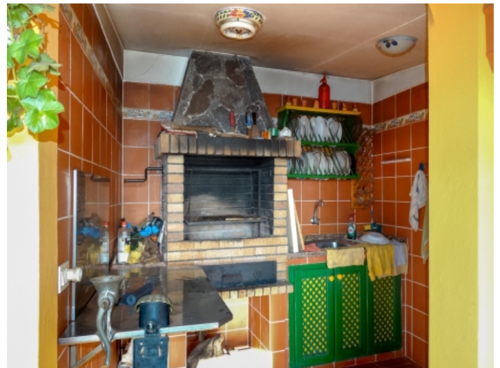
Practical outdoor kitchen