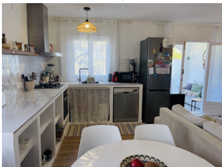
Upper living area