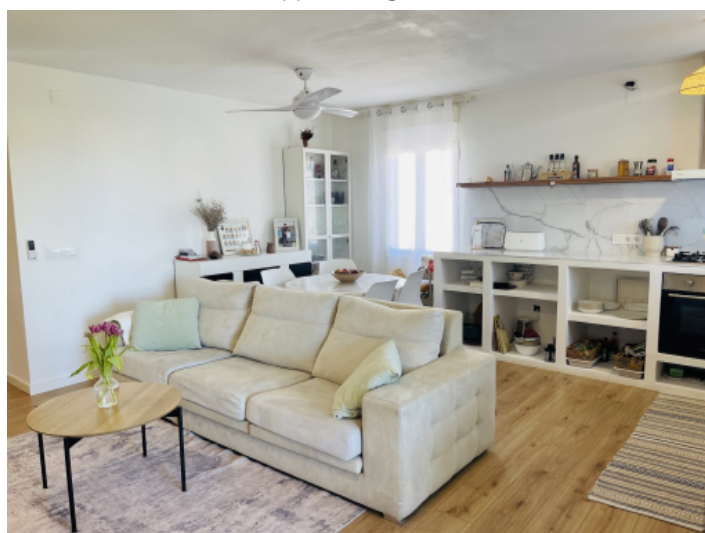
Upper living area