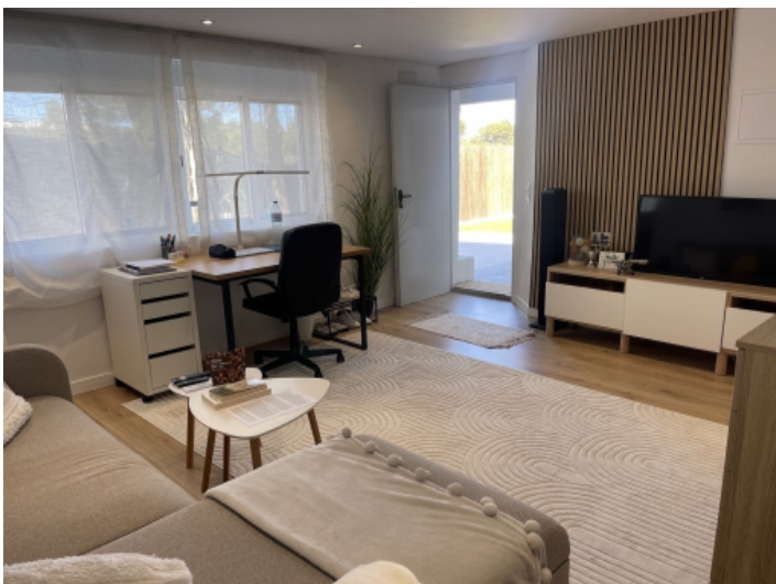
Lower living area