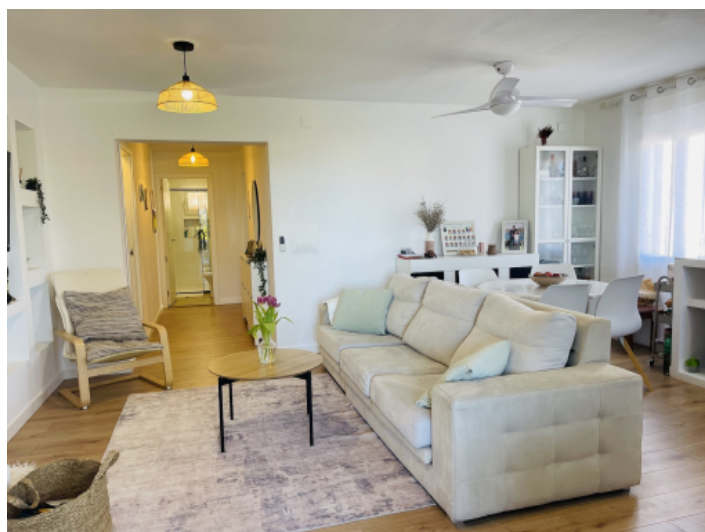
Upper living area