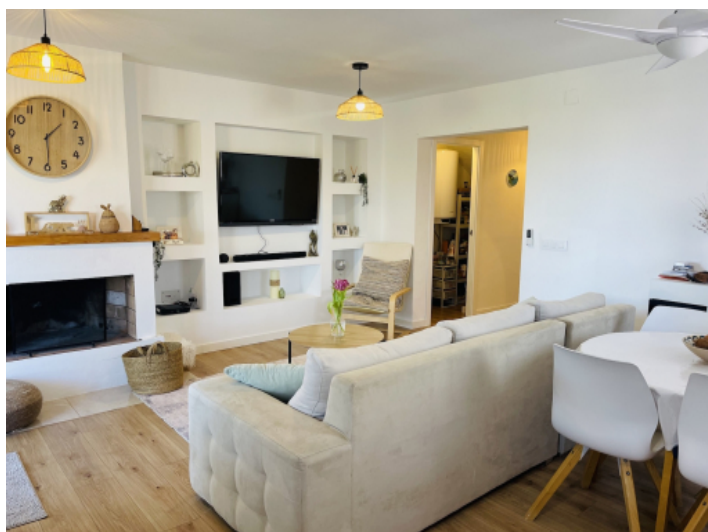
Upper living area