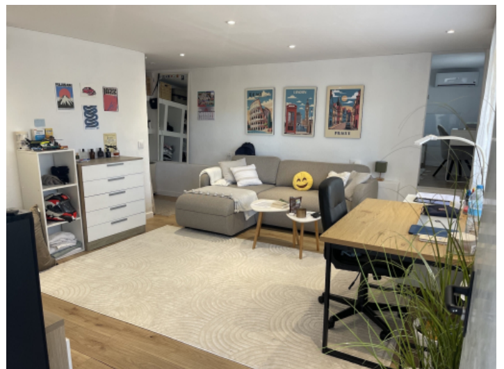
Lower living area