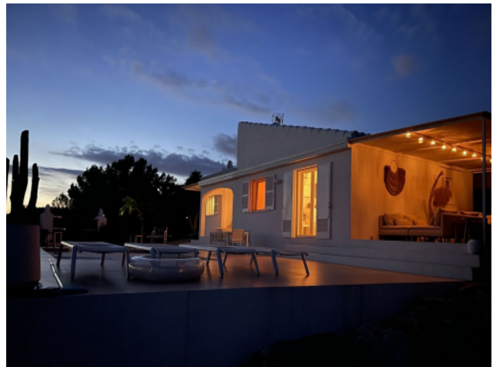
Finca at night