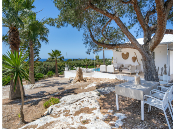
Garden and terrace