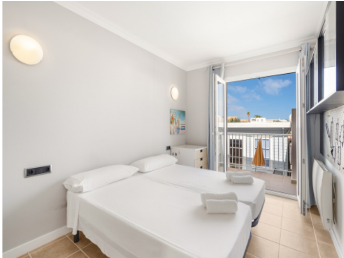
One of 4 bedrooms°