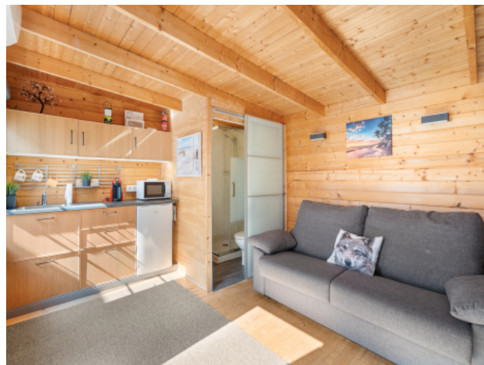
Living area guest house