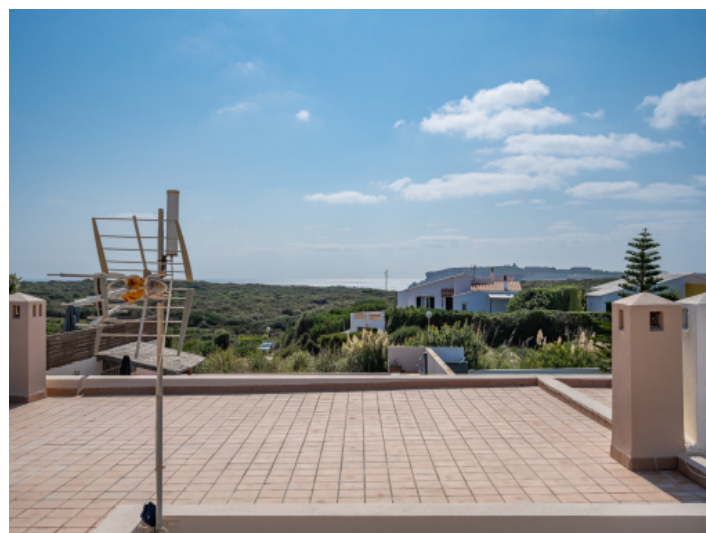
Stuning views up to Cala Llonga