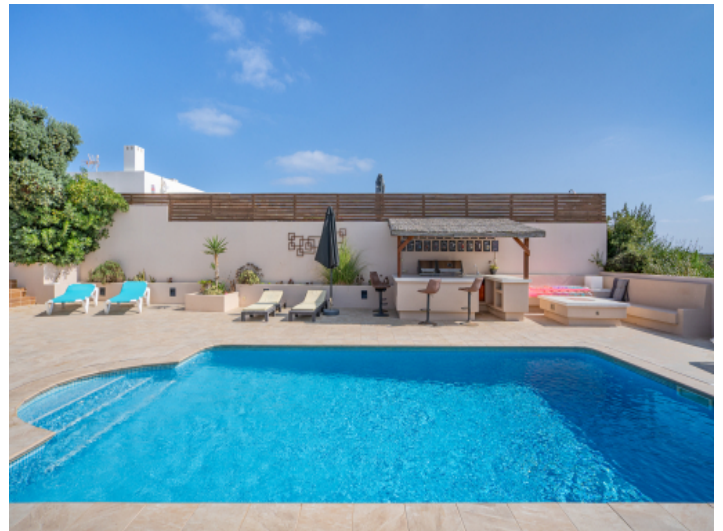
Large pool and BBQ