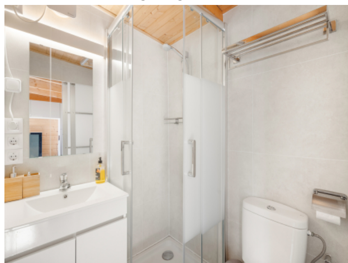
Bathroom guest house