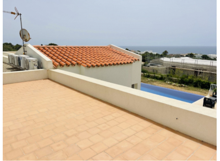
Rooftop terrace with sea views