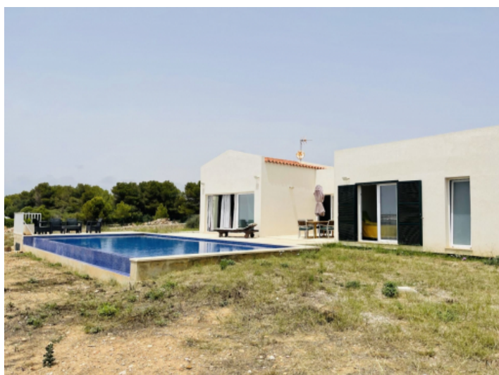
Pool and garden