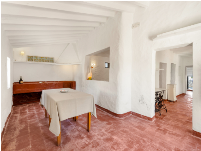
One of 6 rooms on the ground floor