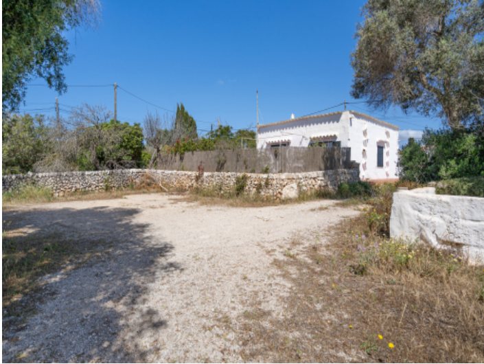
Property to renovate