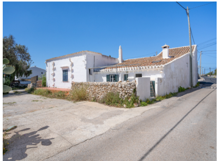
Large private parking space