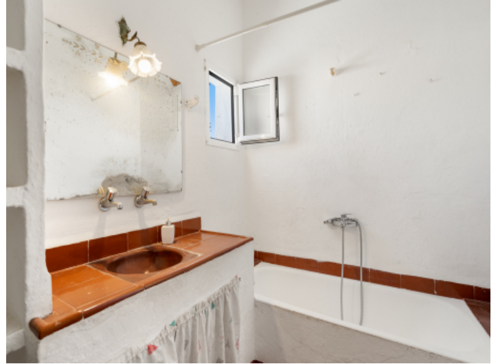
Bathroom on the first floor