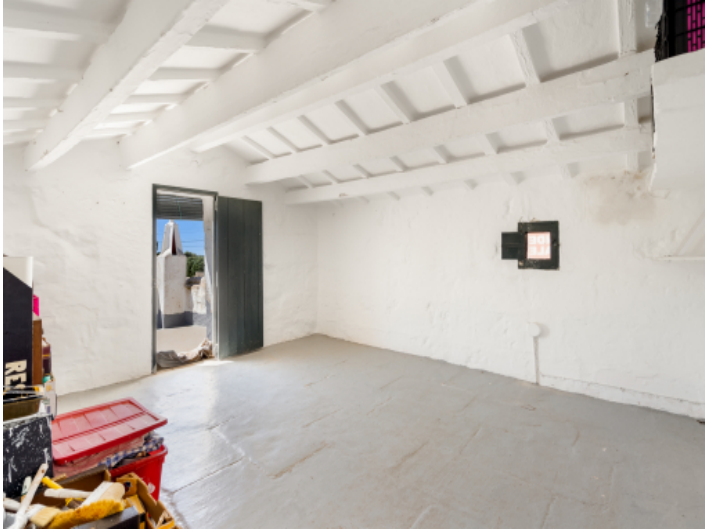
Room on the first floor