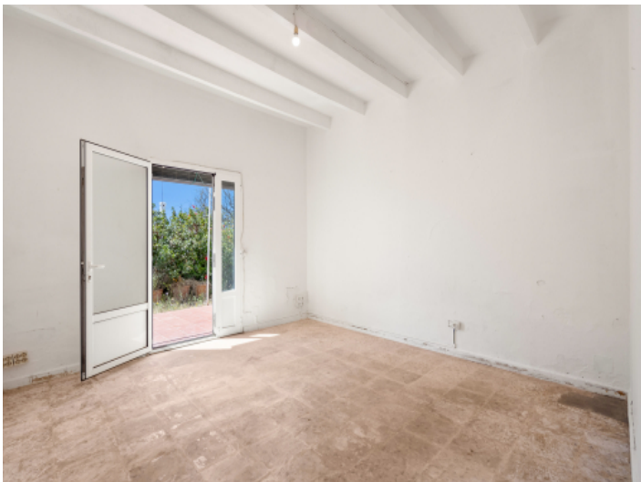
Room with garden access