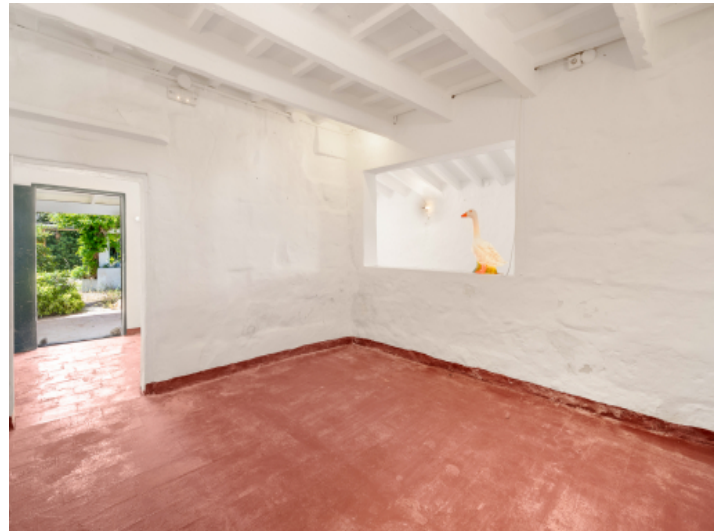
Room with direct access to the terrace