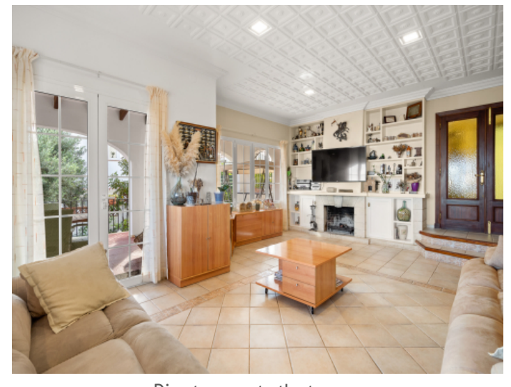
Direct access to the terrace