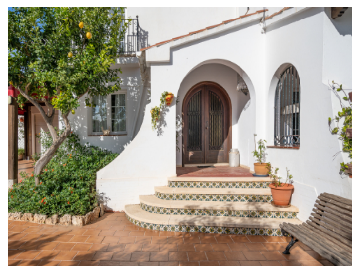
Access to the villa