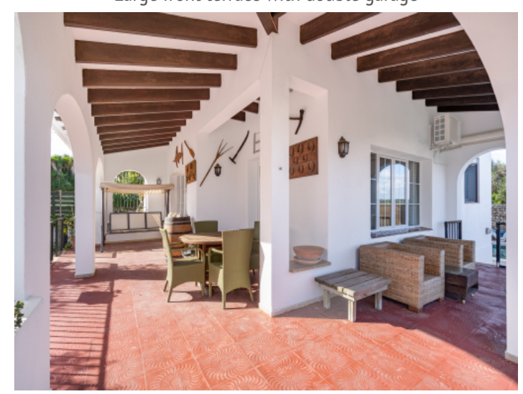
Large covered veranda