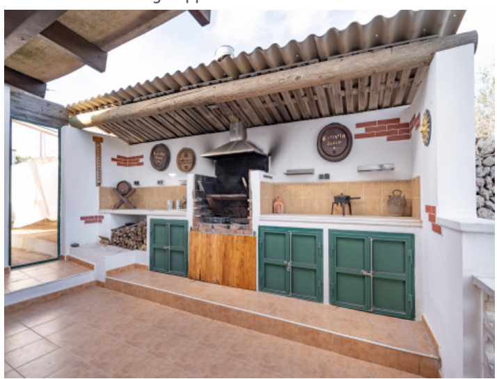
Fantastic bbq area