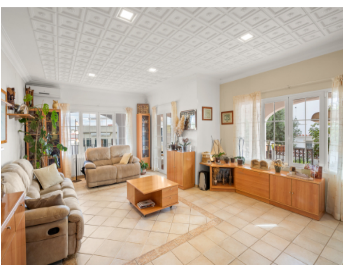
Large, lightflooded living area