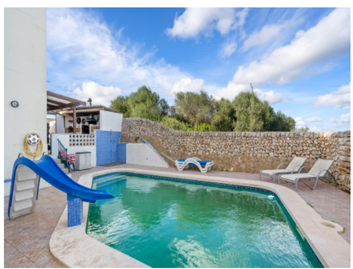
Pool with outdoor shower