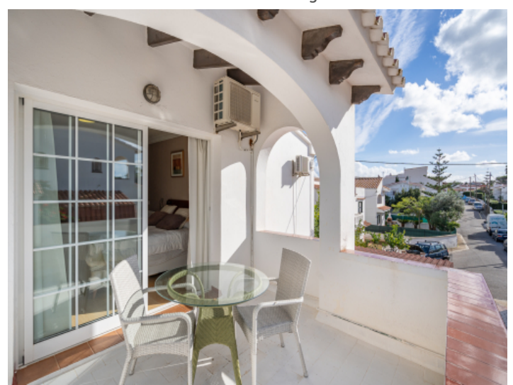
Second terrace on the upper floor