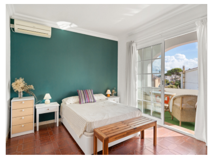
Double bedroom with covered terrace