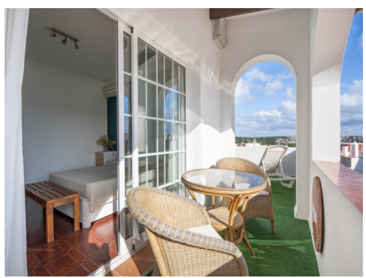
Terrace with seating area