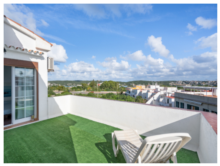
Large upper terrace with a view