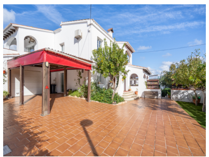
Large front terrace with double garage