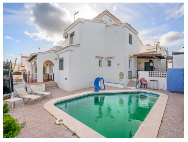
Pool area and sun terrace