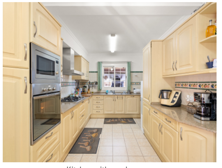
Kitchen with ample space