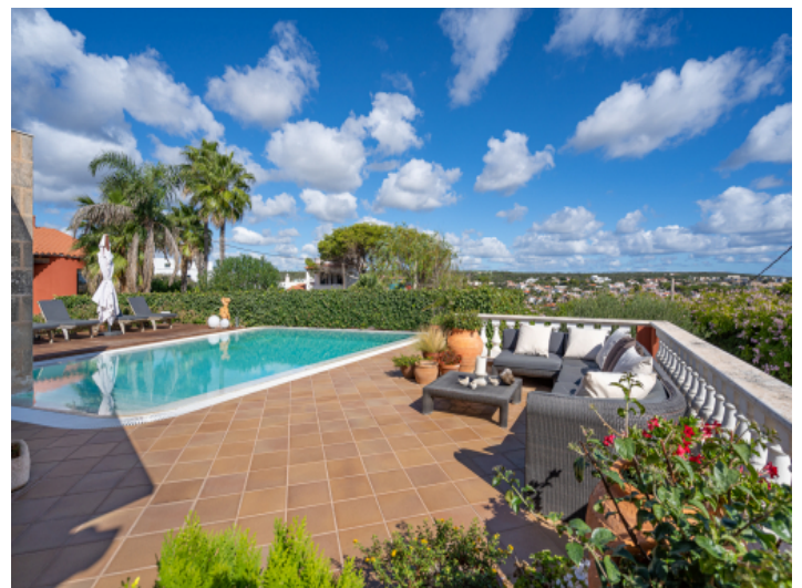
Wonderful views from the pool terrace