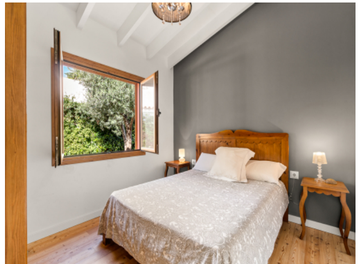
One of in total 7 bedrooms