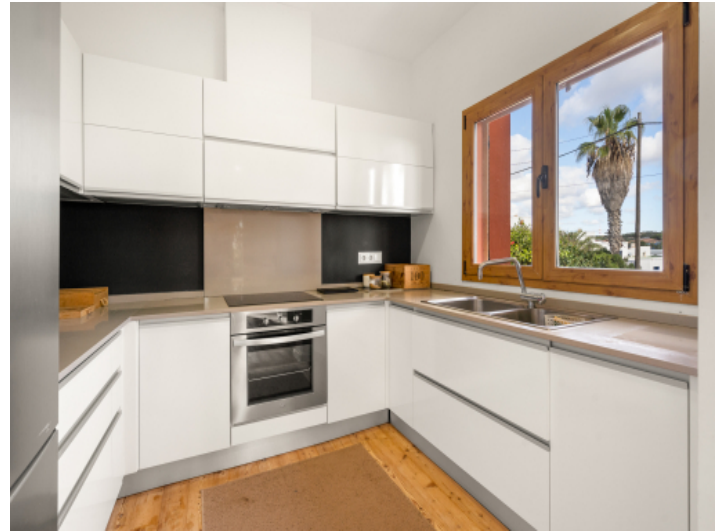
Modern equipped kitchen