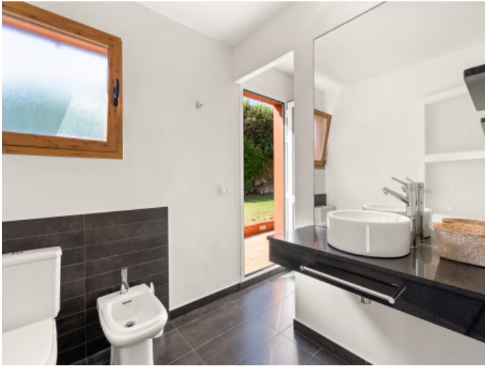
Modern bathroom with garden access