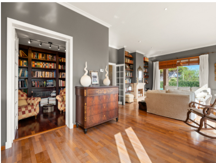
Access to the separate library