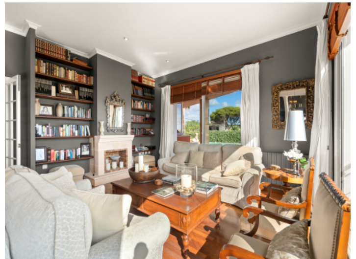
Living area with fireplace for the winter