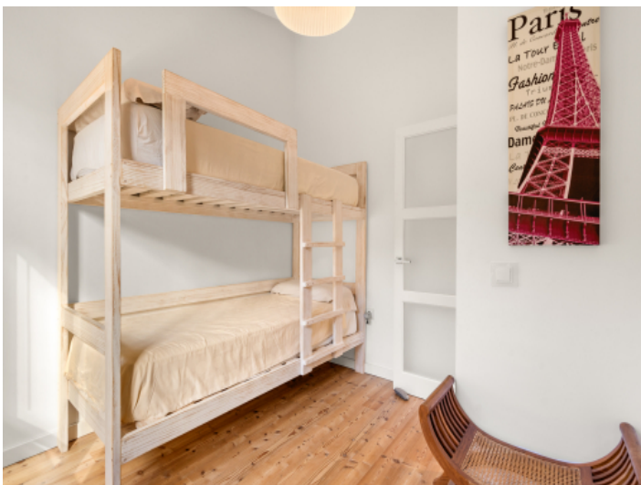
One of in total 7 bedrooms