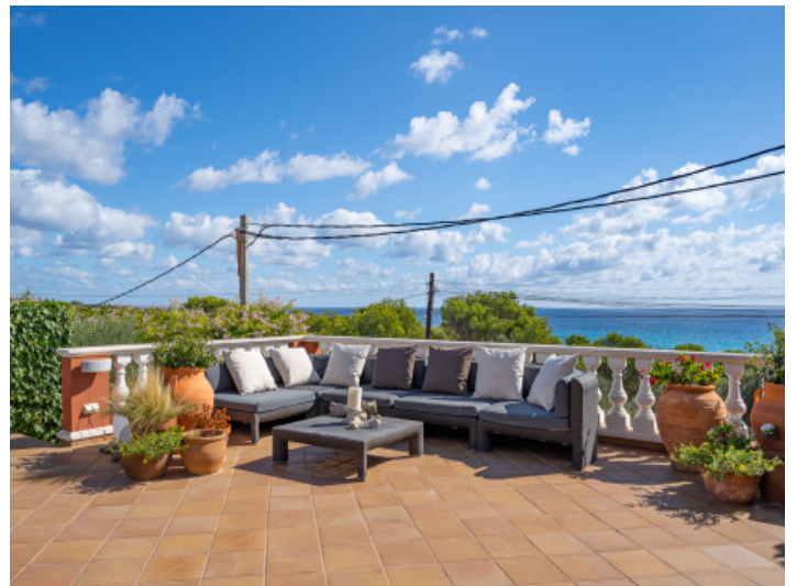
Lounge area with sea views