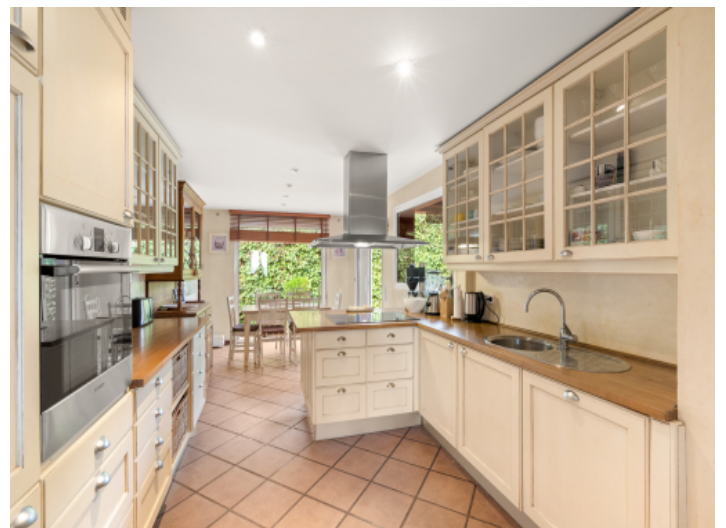
Large kitchen with further breakfast area