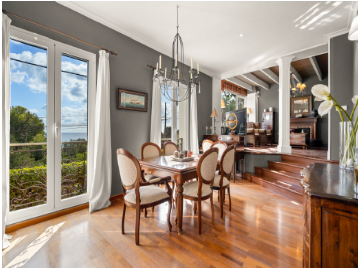
Elegant dining area with sea views