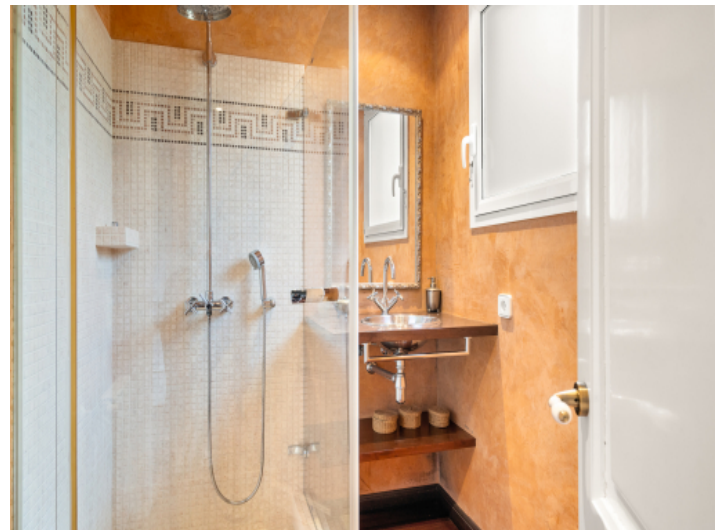
One of in total 4 bathrooms