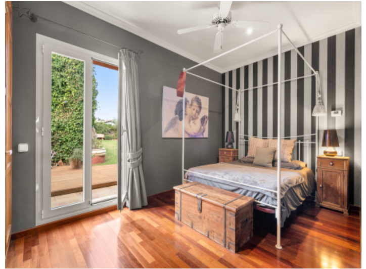
Double bedroom with garden access