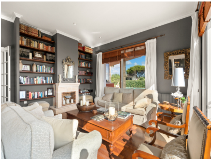
Living area with fireplace for the winter