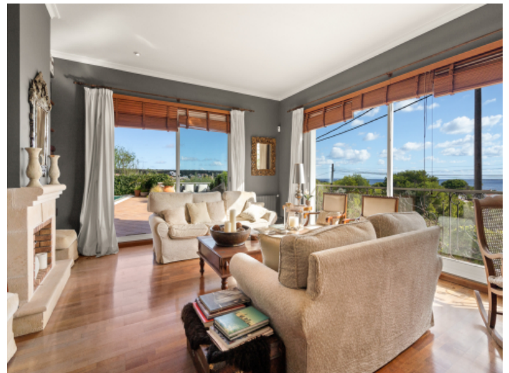
Lightflooded living area with sea views