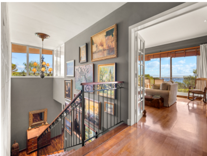
Stairs lead up to a further living room