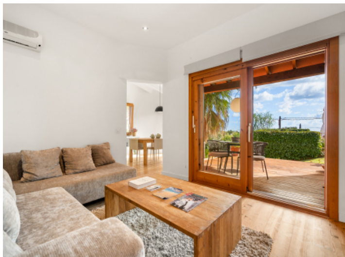
Modern living area with terrace