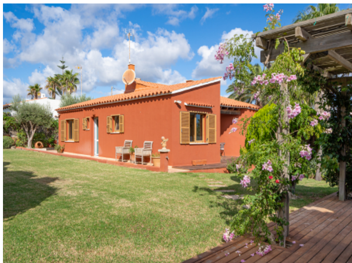
View to the second house on the plot