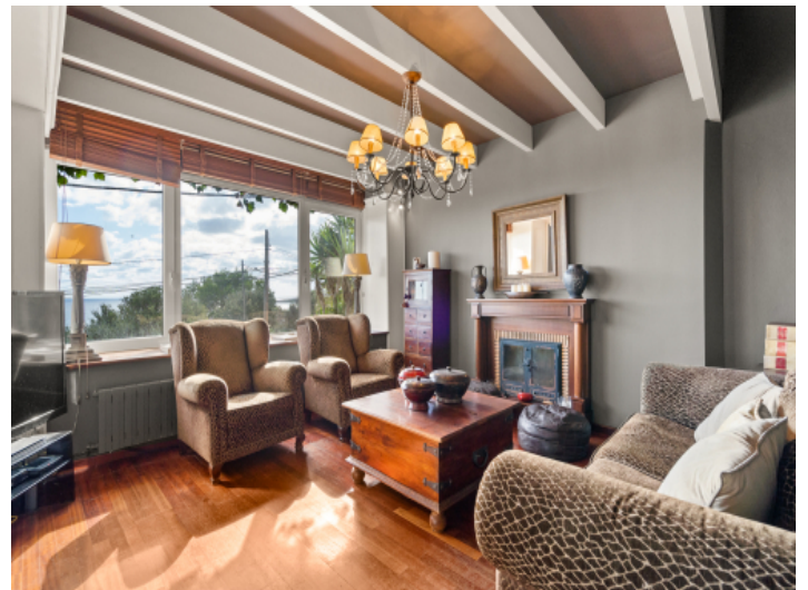
Adjoining comfortable fireplace area