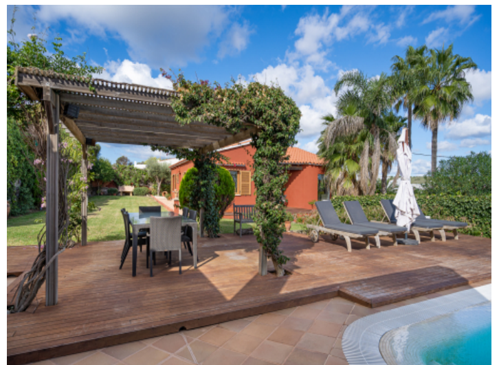
Covered outdoor dining area