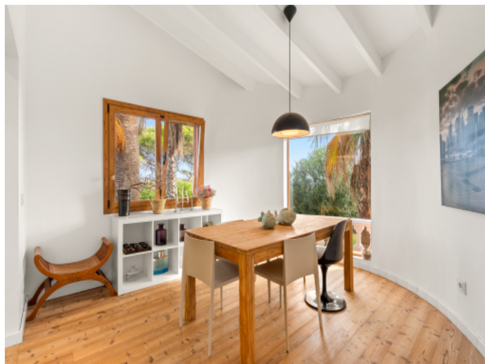
Beautifully renovated dining area