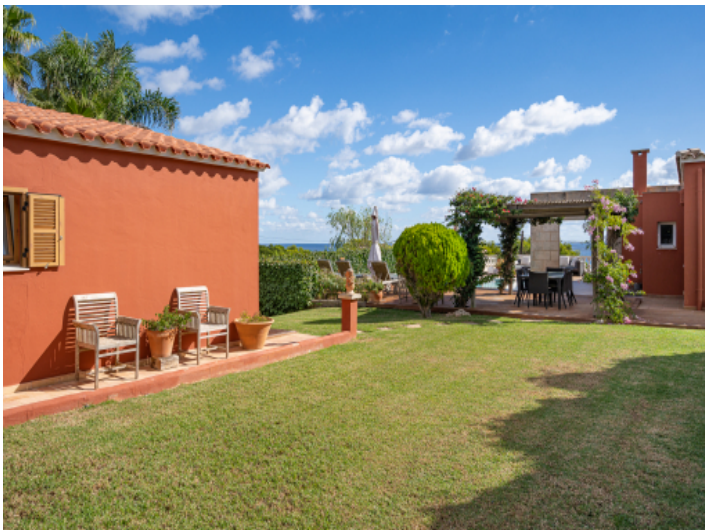
Large, well-maintained garden