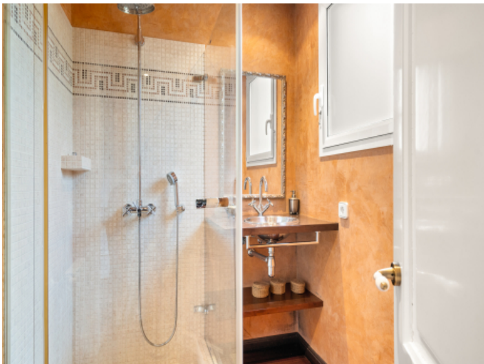
One of in total 4 bathrooms