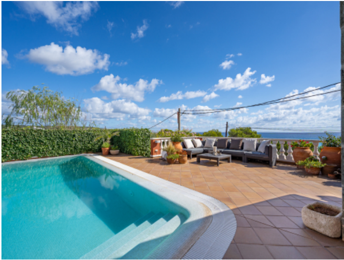
Pool area in a stunning location