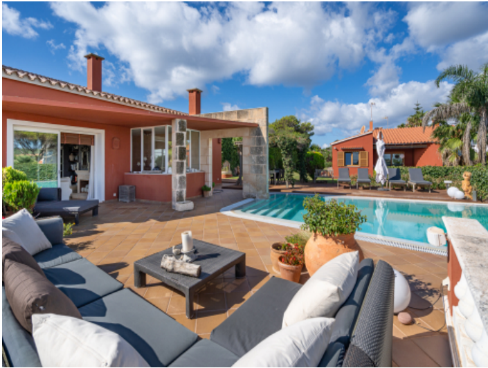
Tranquil lounge area on the pool terrace