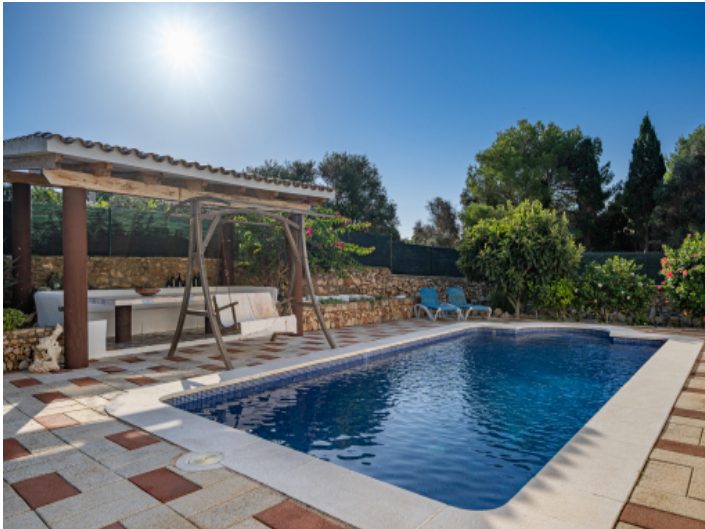
Beautiful pool area with seating area