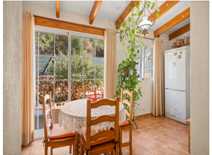
Bright dining area with terrace access