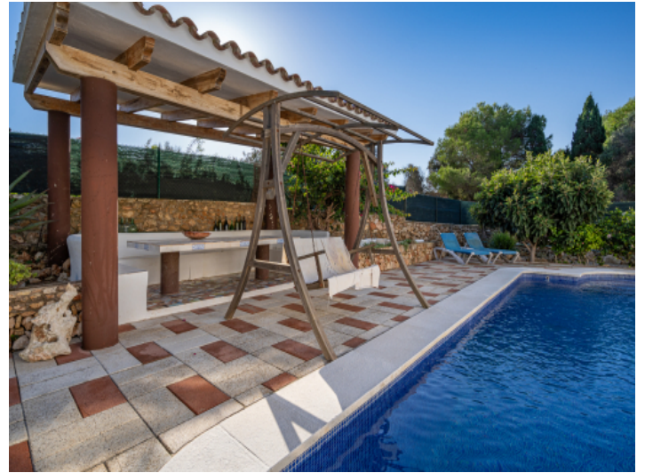
Tranquil lounge area