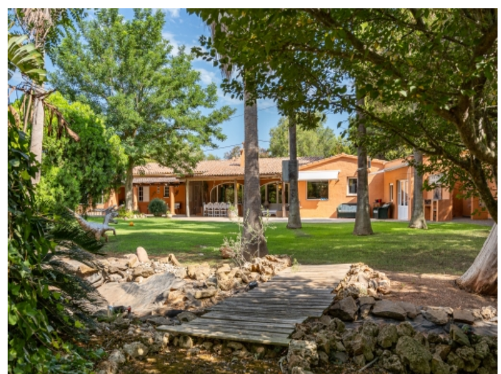
Finca with wonderful garden