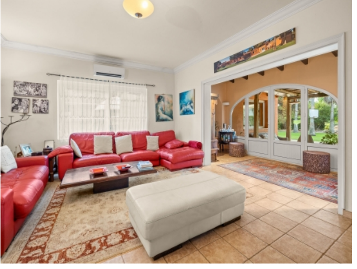
Generous living area