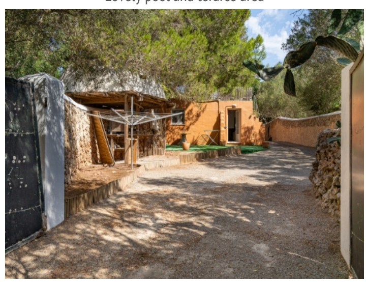
Access to the guest apartment