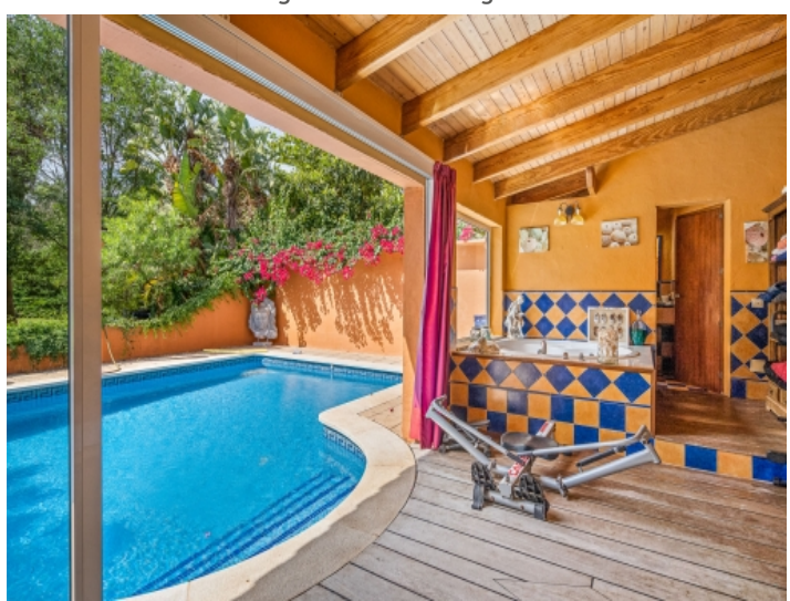
Covered pool terrace with jacuzzi