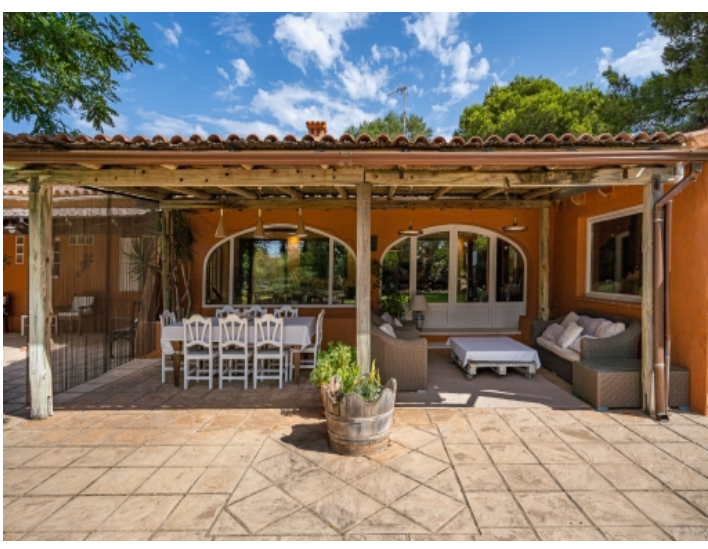
Large outdoor dining area