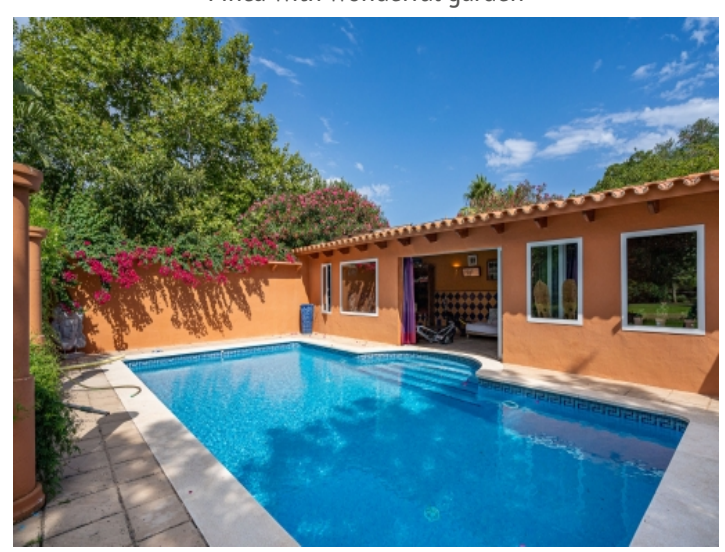
Pool with absolute privacy