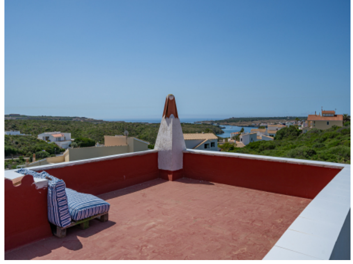
Roof terrace with stunning views of Cala Llonga