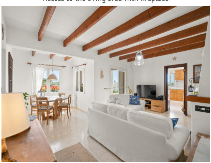
Friendly, open living and dining area