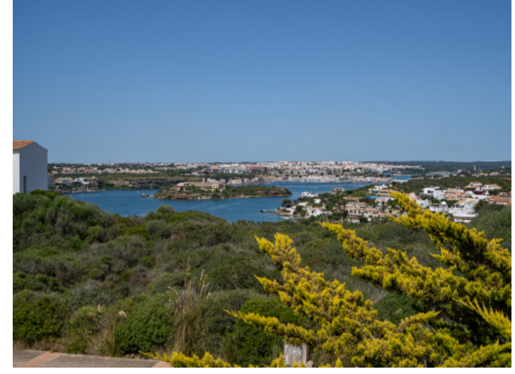
Wonderful views as fas as Mahon

PORTA MONDIAL MENORCA • AVENIDA FORT DE L'EAU, 175, LOCAL 6, 07701 MAHóN, MENORCA, SPAIN TEL.: +34 871 510 261 • MENORCA@PORTAMONDIAL.COM • WWW.PORTAMONDIAL.COM/EN/MENORCA/