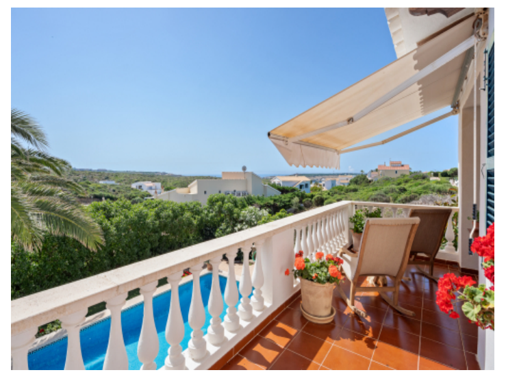
Lovely terrace with pool and sea views