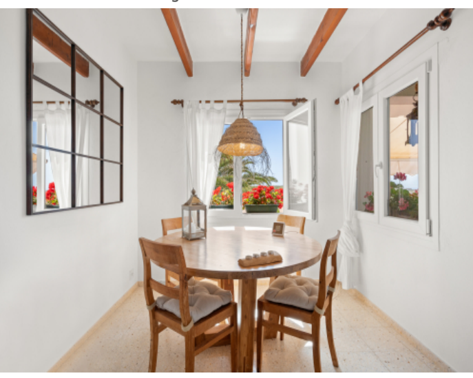
Light-flooded dining area