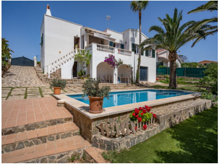
View of the villa with pool and garden