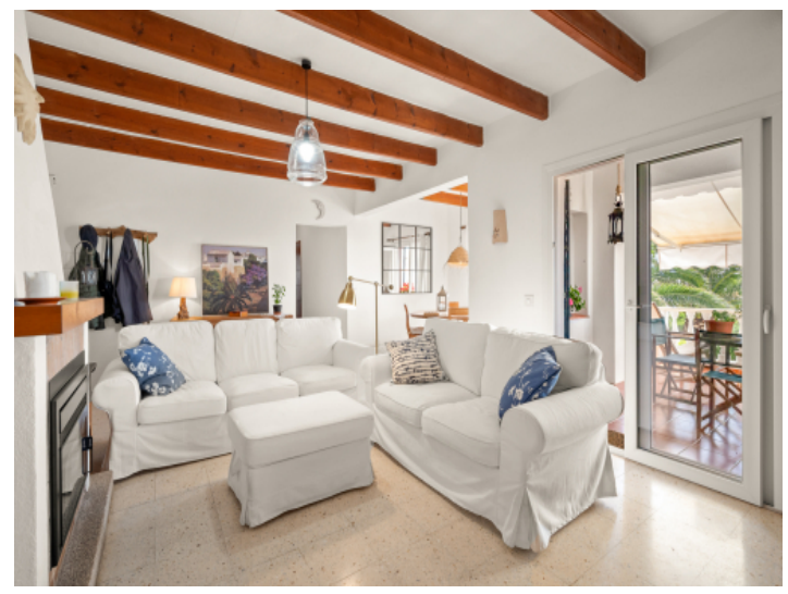
Access to the living area with fireplace