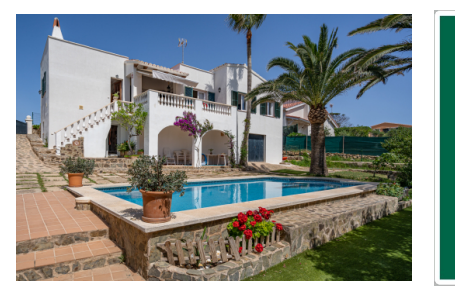
Cala Llonga search for property MEN-100540