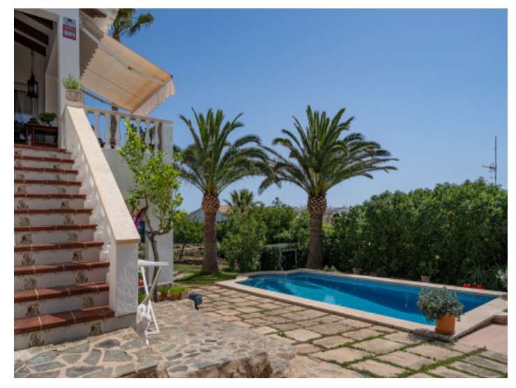
Pool terrace and stairs to the upper terrace