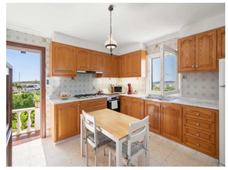
Large kitche with terrace access

PORTA MONDIAL MENORCA • AVENIDA FORT DE L'EAU, 175, LOCAL 6, 07701 MAHÓN, MENORCA, SPAIN TEL.: +34 871 510 261 • MENORCA@PORTAMONDIAL.COM • WWW.PORTAMONDIAL.COM/EN/MENORCA/