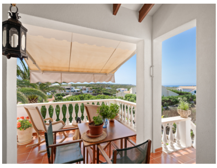
Enchanting covered sea view terrace