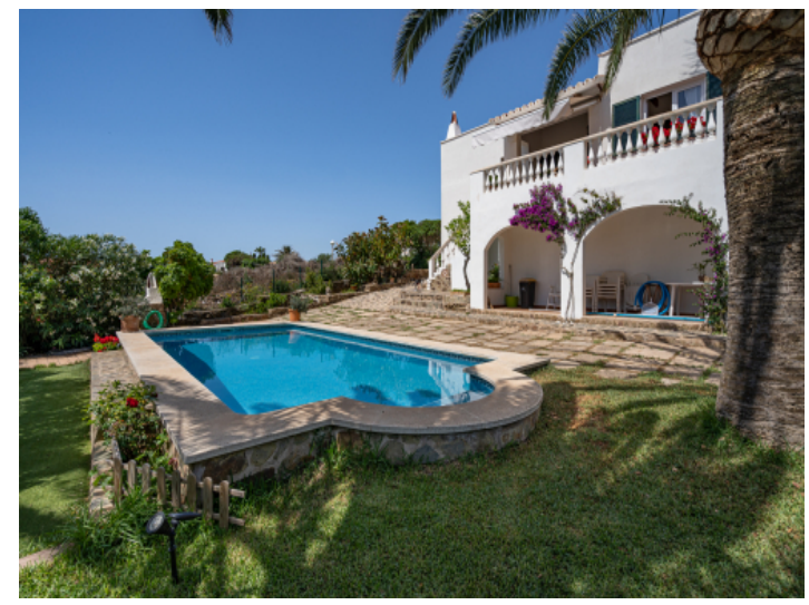
Pool and garden with natural shade