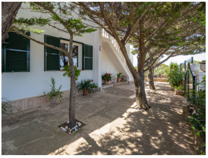
Beautiful side terrace of the house