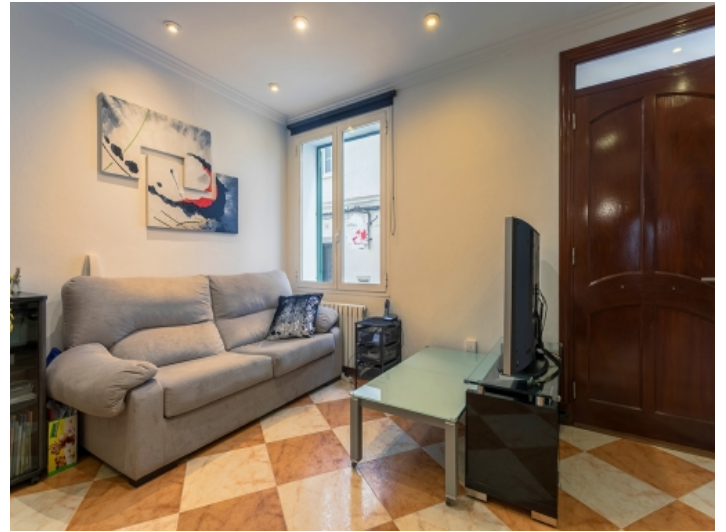
Open living and entrance area