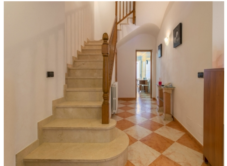
Views of the floor