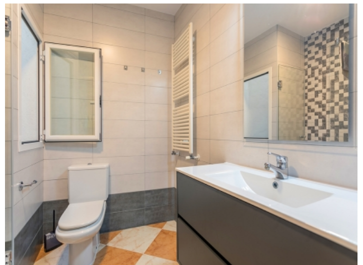
Modern bathroom with bathrub