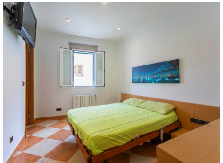
Master bedroom with double bed