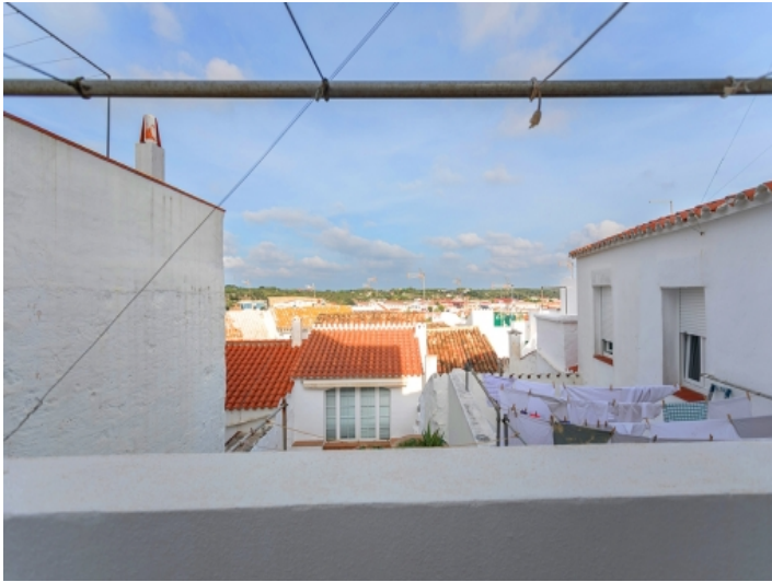
Views from the balcony