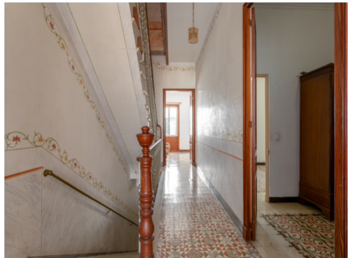
Staircase of the house