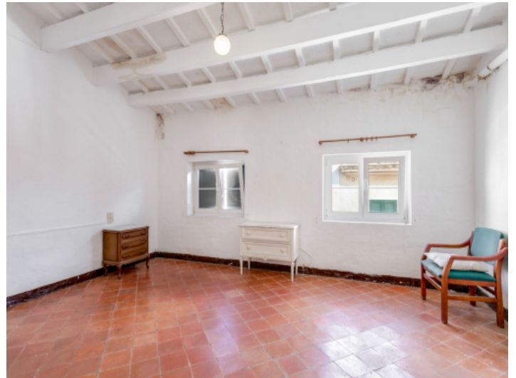
Living area on the upper floor