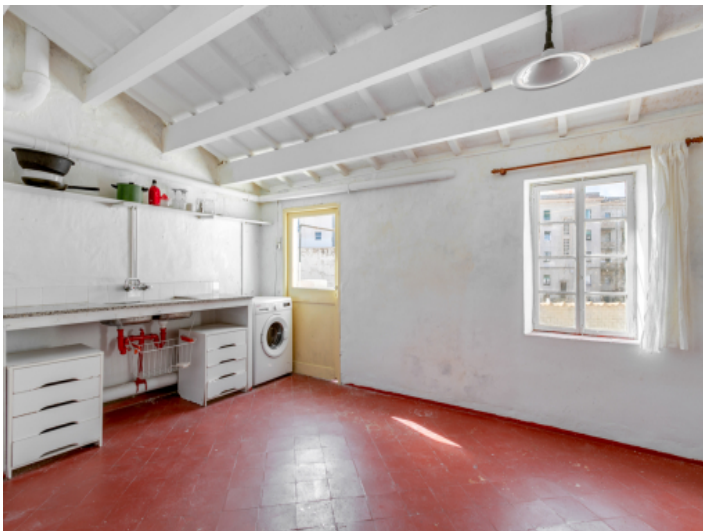
Kitchen on the upper floor