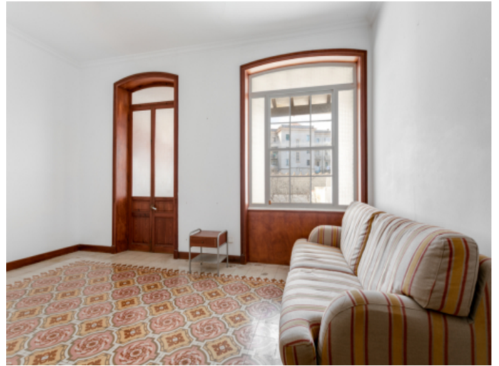
Rustic living area