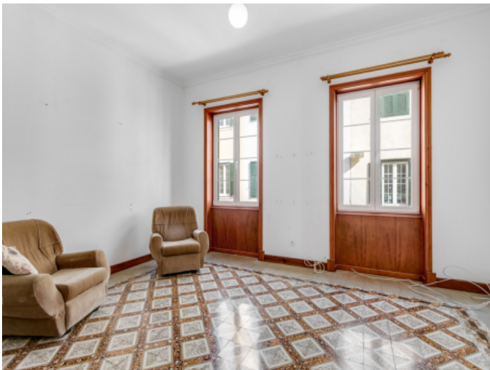
Alternative view of the living area