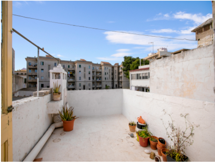
Incredible roof top terrace