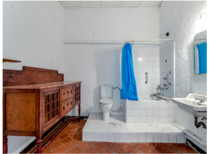
Large bathroom of the house