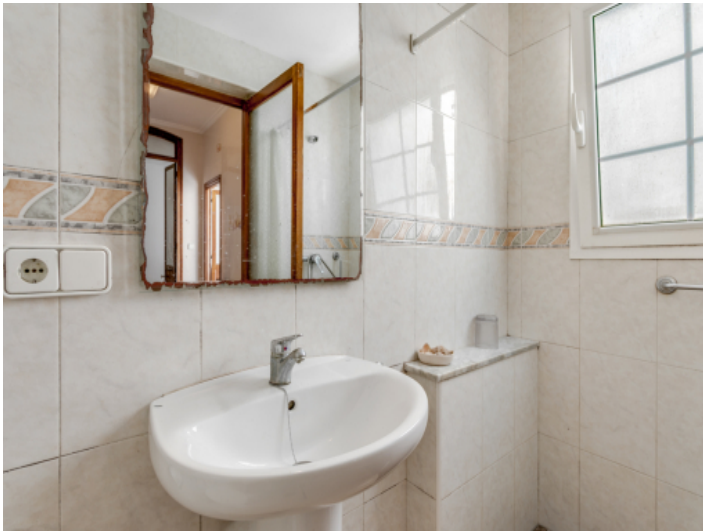
Light flooded bathroom