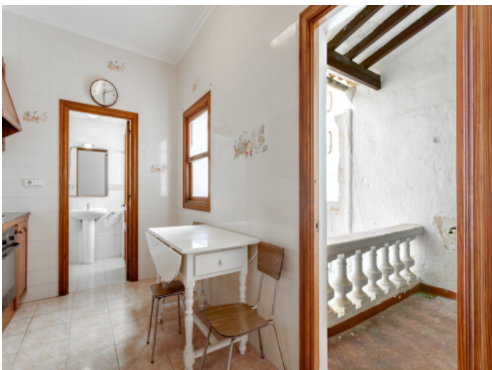
Access from the kitchen to the balcony