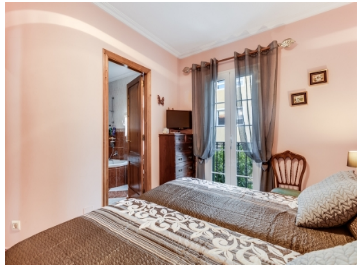
Bedroom with french balcony