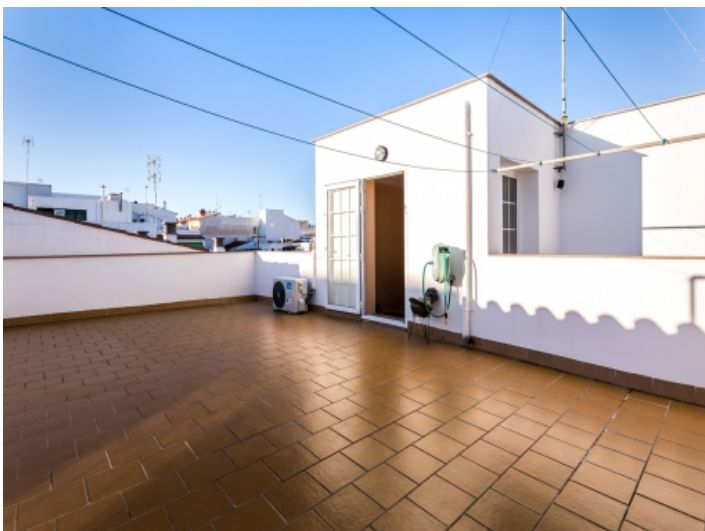
Private roof terrace