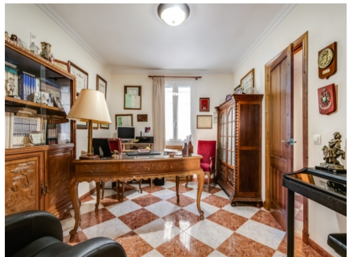
Capacious working room