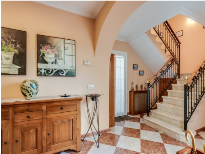
Inviting entrance area