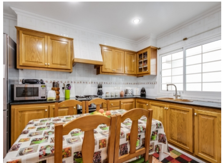
Kitchen with further dining area