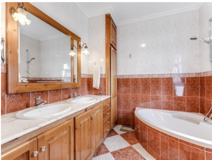
Bathroom en Suite with bathtub