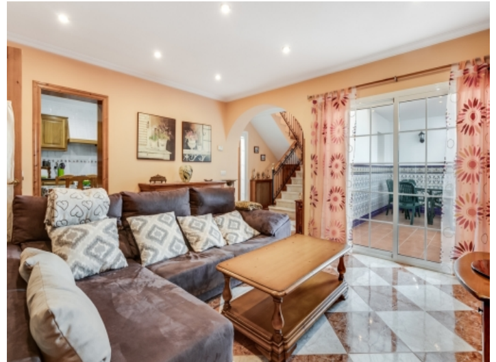
Living area with terrace access