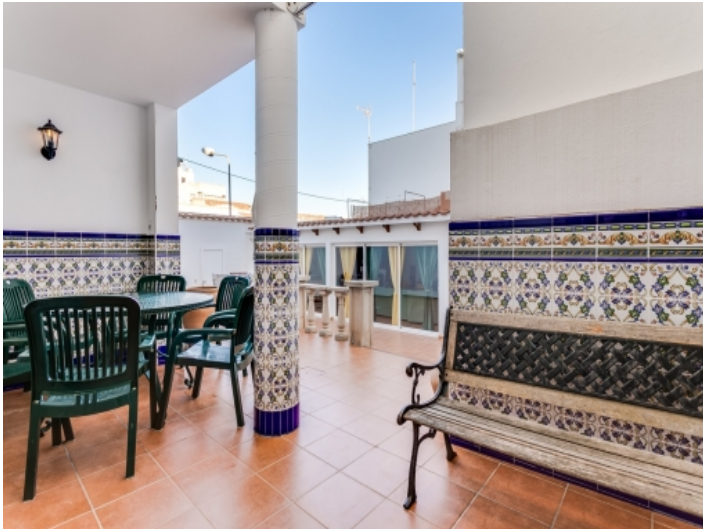
Terrace with beautifully tiled wall