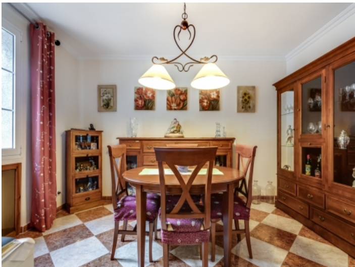
Spacious dining area