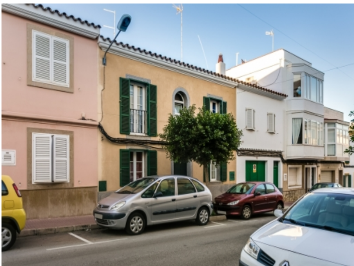
Exterior view of the house