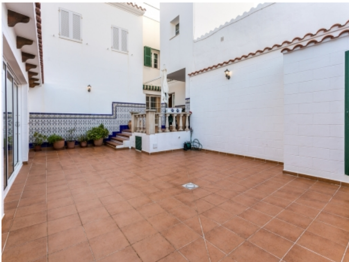
Large terrace on the ground floor