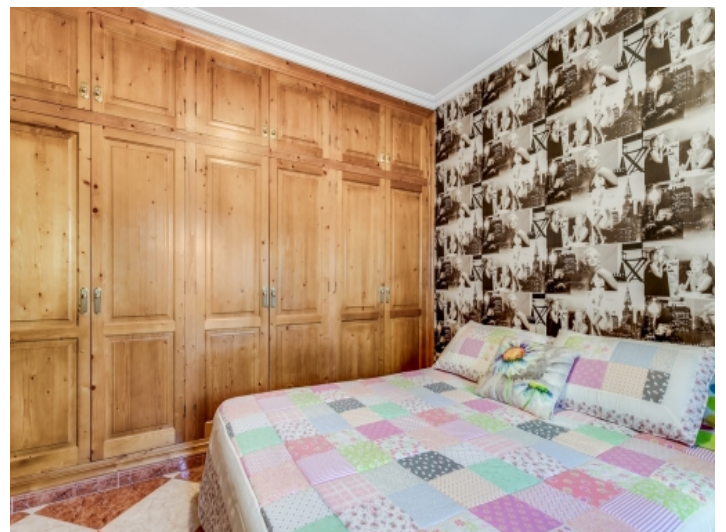
One of 5 bedroom