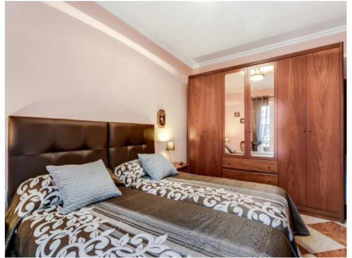
Master bedroom with built-in wardrobe