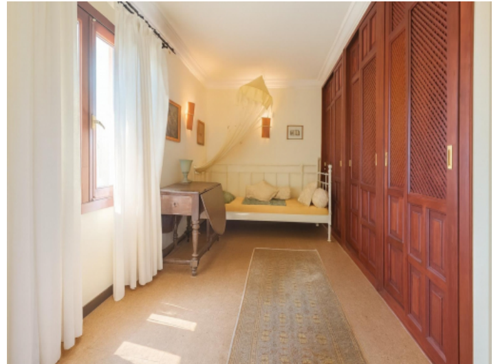
Bright bedroom with large wardrobe