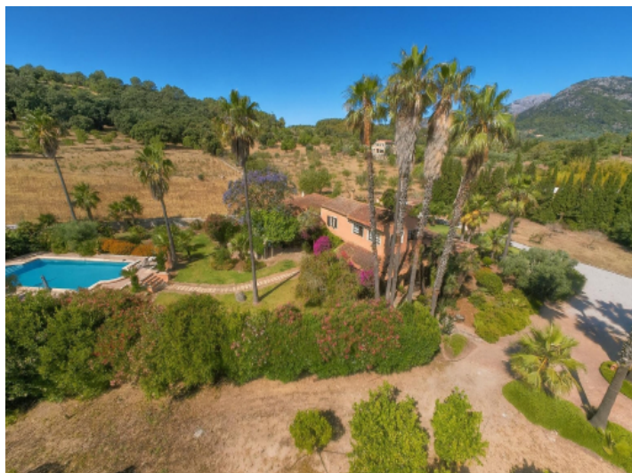
Aerial view of property with pool and garden