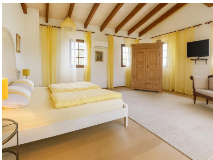
Bright spacious master bedroom interior