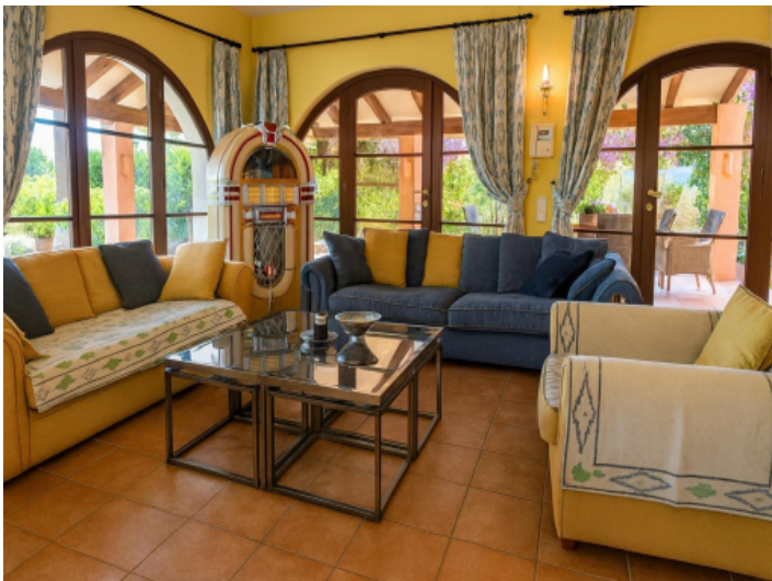
Cozy living area with jukebox and outdoor view