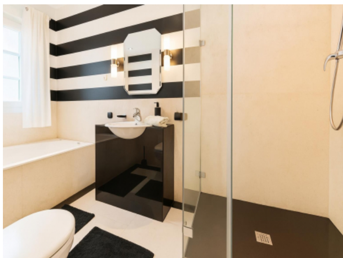
Modern en suite bathroom with shower