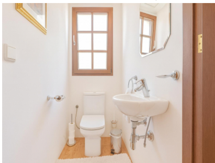
Bright small guest toilet room