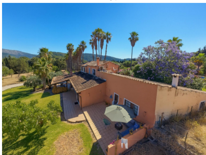
Spacious property with garden and patio