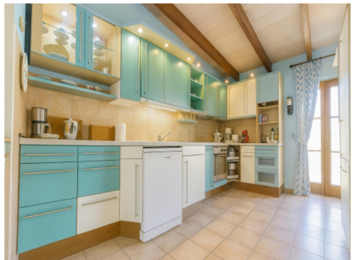
Bright kitchen with blue cabinets