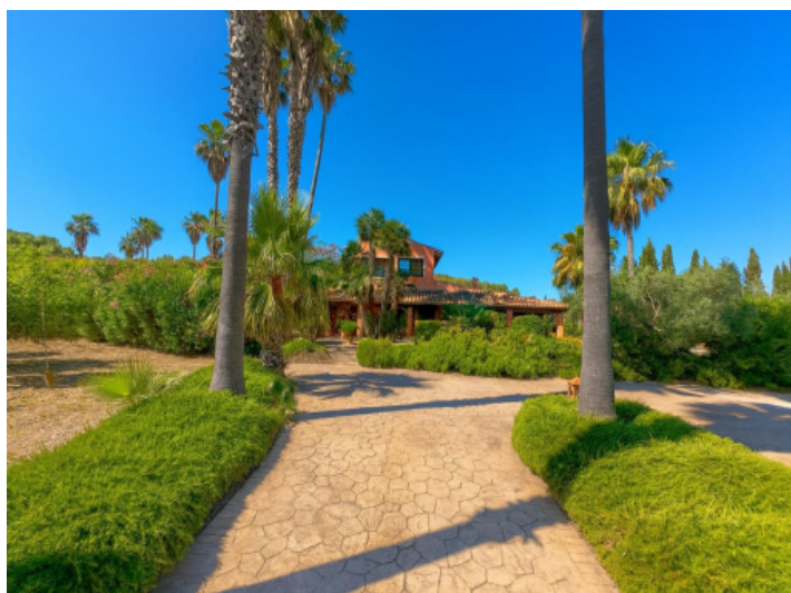
Palm tree lined driveway to house