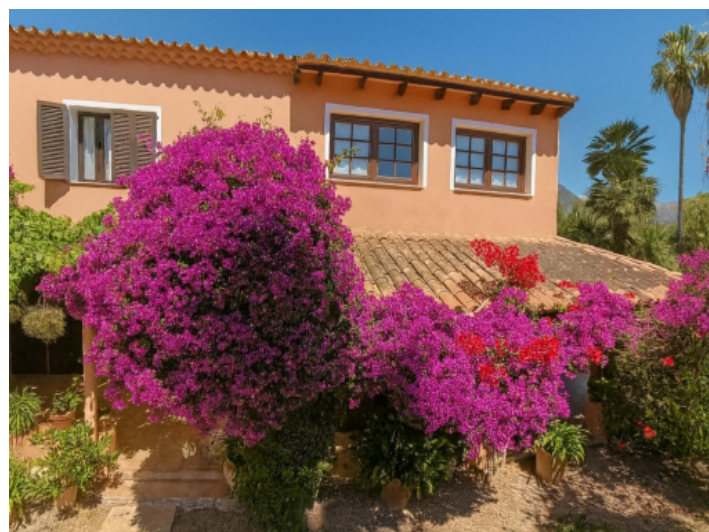
House facade with flowering garden