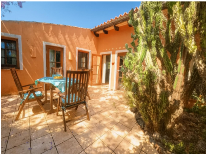
Sunny outdoor terrace with cactus garden