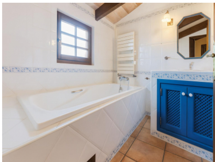
Bathroom with bathtub and blue cabinet