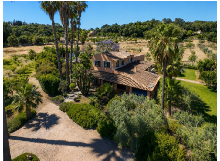
Aerial view of large villa with garden