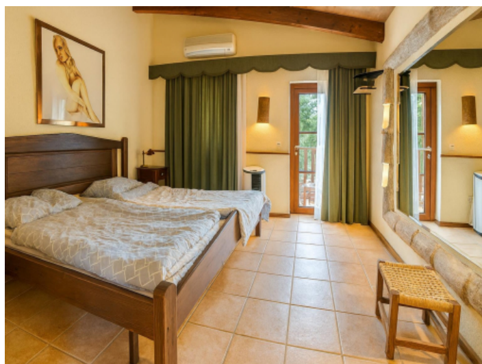
Guest double bedroom with balcony access