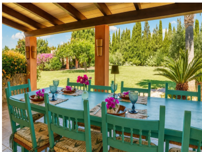
Covered terrace with dining table and garden view