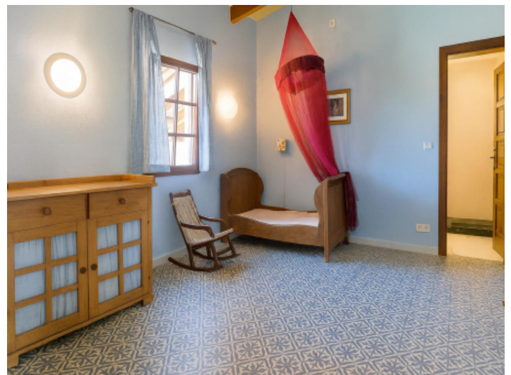
Rustic bedroom with decorative flooring