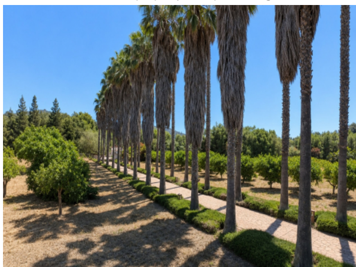
Tree lined path with garden landscape