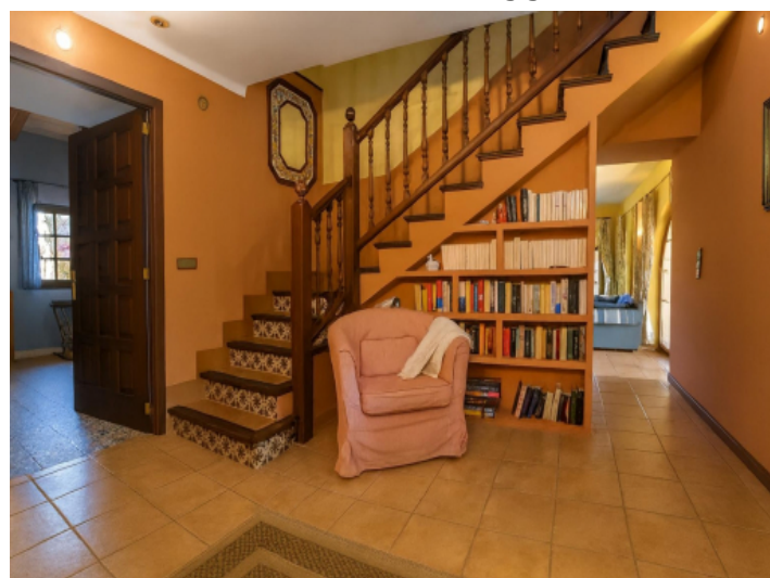
Cozy ground floor hall with staircase and bookshelf