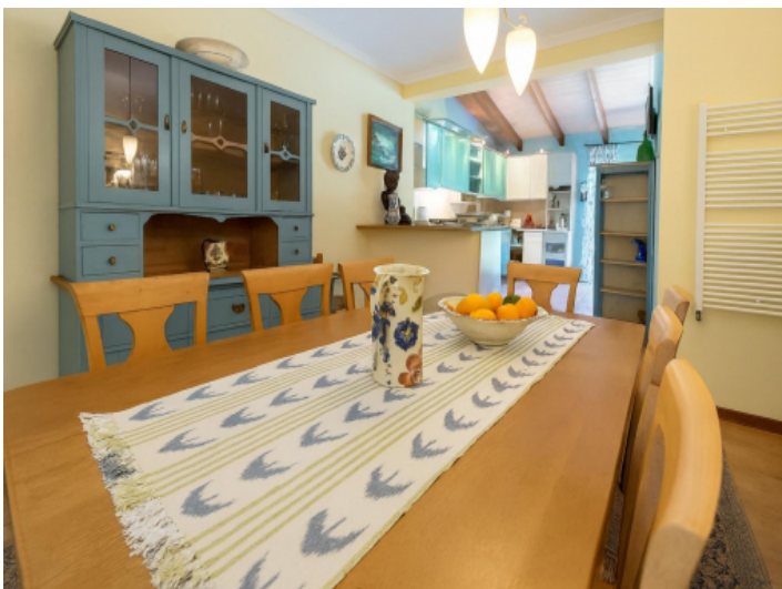
Dining area with decorative vases