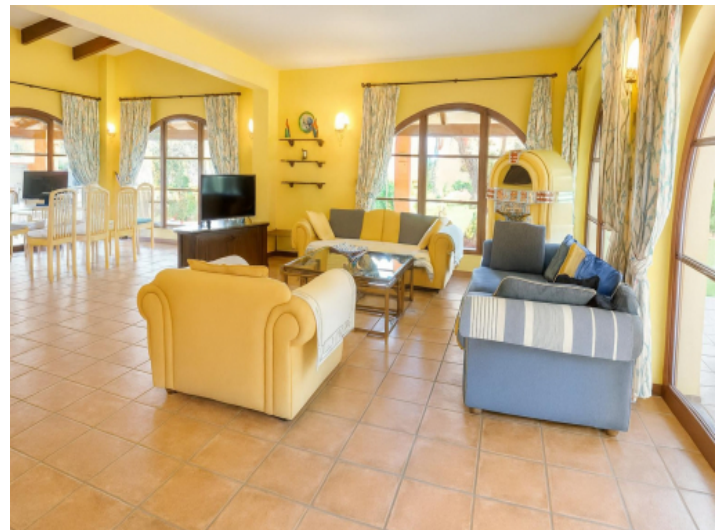
Spacious living dining room with TV