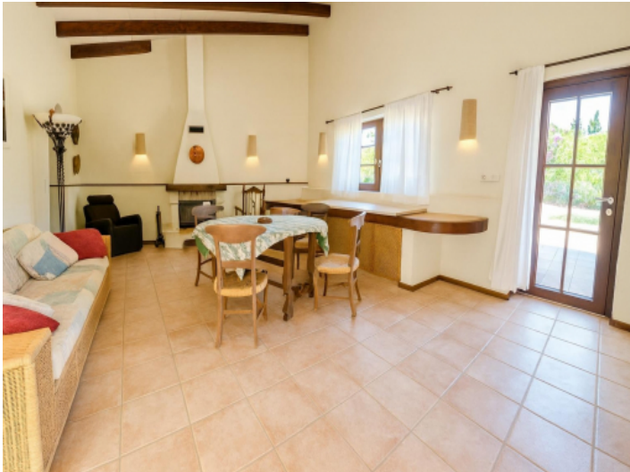
Guest living dining kitchen area