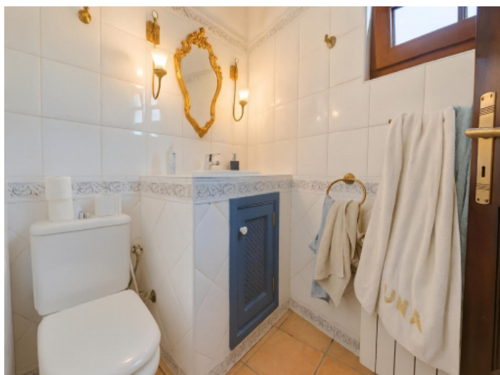
Small bathroom with decorative mirror