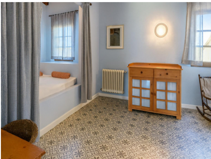
Cozy ground floor bedroom with sitting area