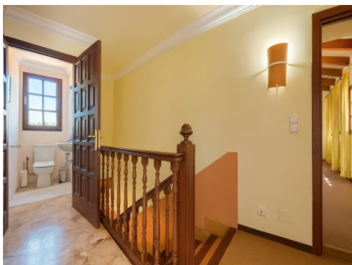
First floor landing with bathroom access