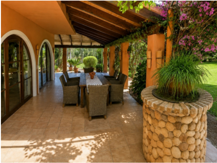
Covered terrace with dining area and garden view