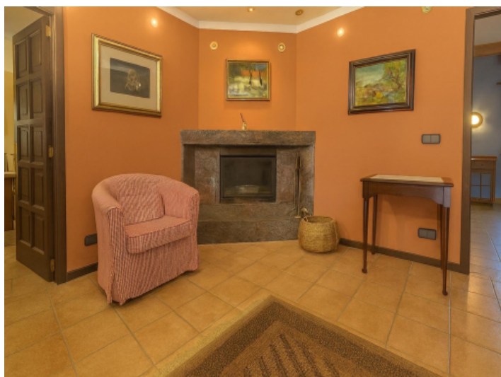
Cozy hallway with fireplace and armchair