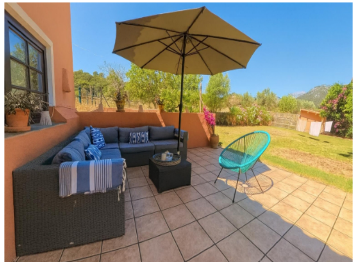
Cozy terrace with garden view