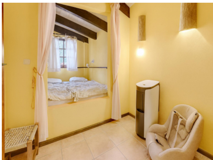
Guest bedroom with cozy lighting