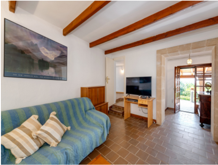
Second living area