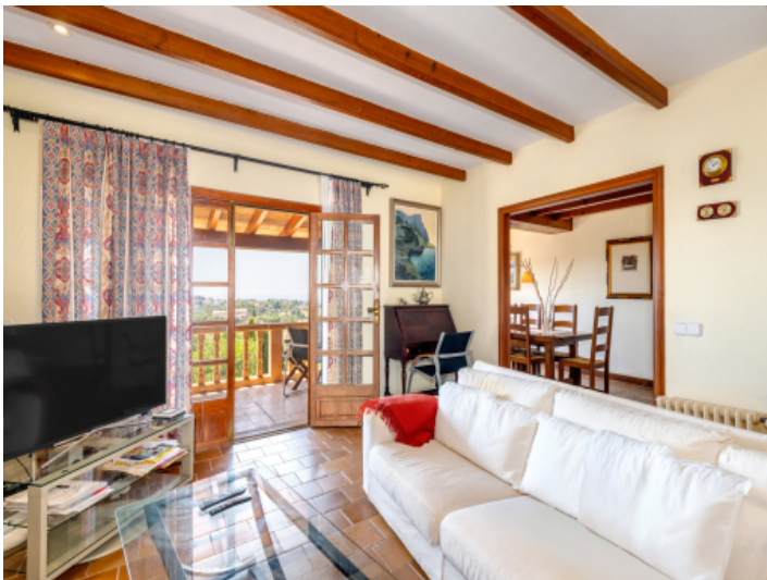
Big living area