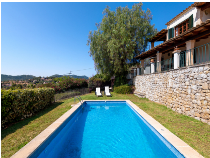
Pool with garden