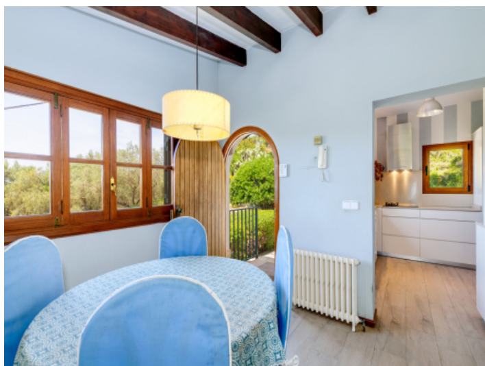
Dining area in kitchen