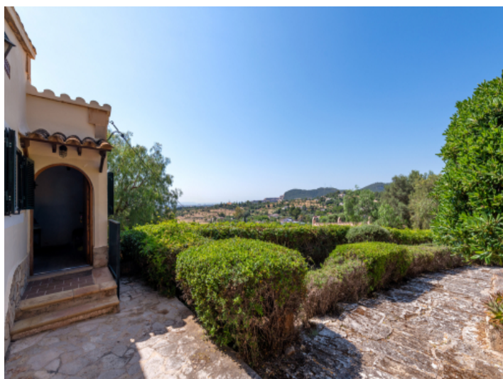
Garden with views