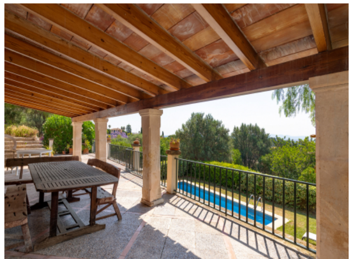
Covered terrace with views